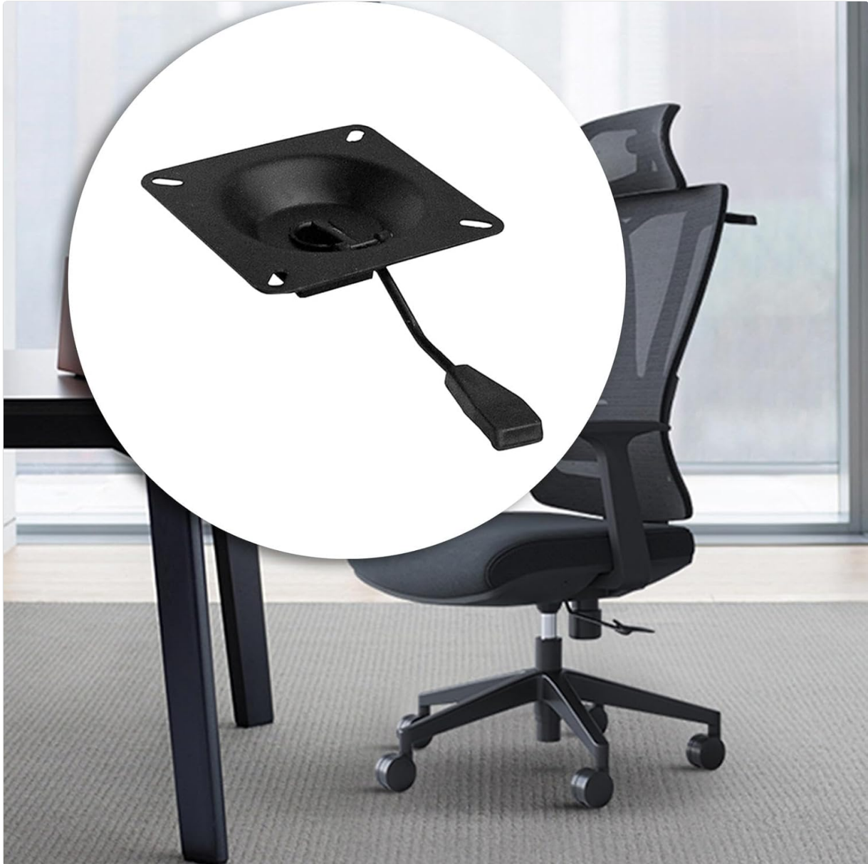
Image: A detailed view of the black metal tilt control mechanism, highlighting its square shape and the integrated lever.