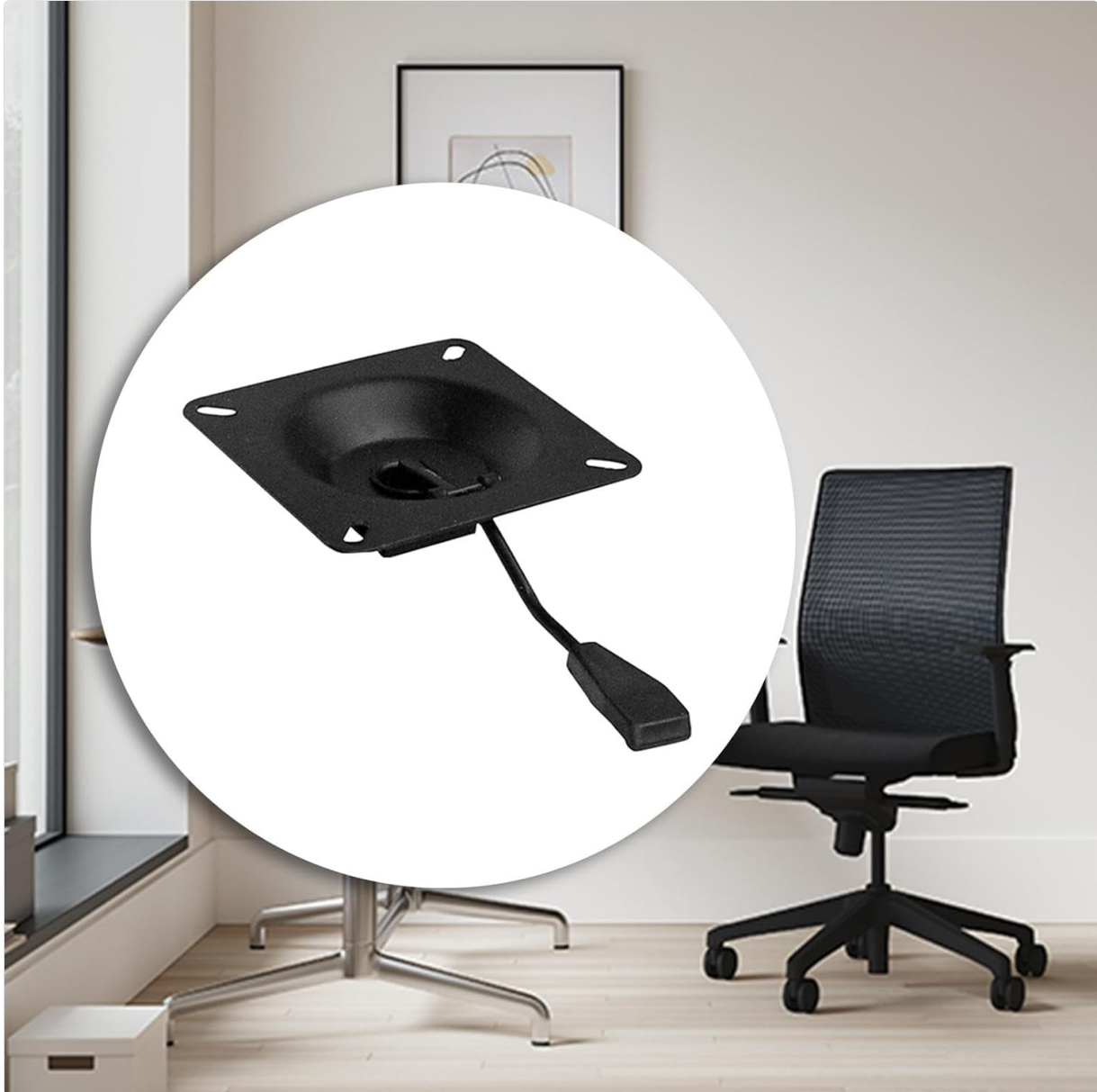
Image: The tilt control mechanism is shown in a circular inset, superimposed over a modern dark office chair in a room setting, illustrating its application.