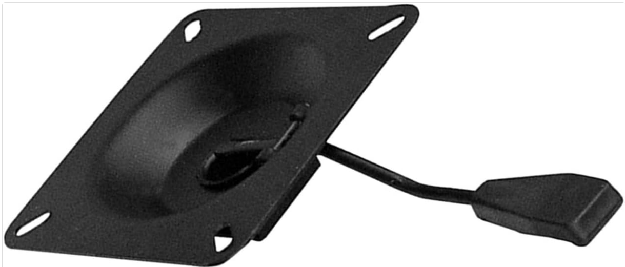
Image: The Office Chair Tilt Control Seat Mechanism, a square black metal plate with a lever for adjustment.

This manual provides comprehensive instructions for the installation, operation, and maintenance of your new Office Chair Tilt Control Seat Mechanism. Designed for durability and ease of use, this mechanism is a vital component for adjusting the height and tilt of various office chairs, bar chairs, gaming chairs, and salon chairs. Please read this manual thoroughly before installation and use to ensure proper function and longevity of the product.