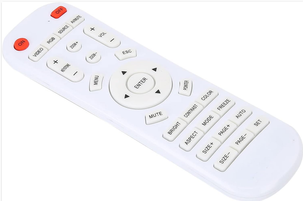
Figure 2: Remote Control Layout. All buttons are clearly visible.

The JTLB Universal Projector Remote Control features a range of buttons for various projector functions. Familiarize yourself with the layout and functions below: