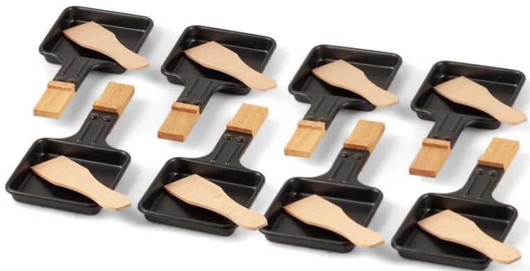
Image 2: Close-up view of the adjustable thermostatic control, indicator light, and the 8 raclette pans with wooden spatulas.