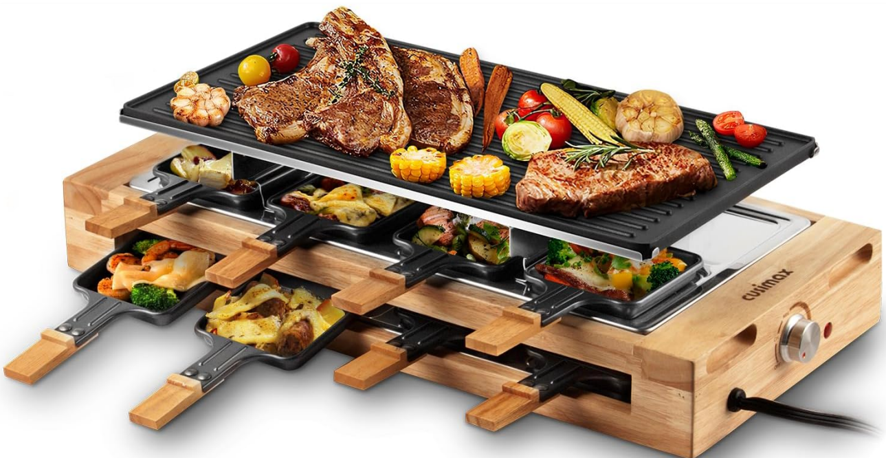
Image 1: The CUSIMAX Raclette Table Grill, showcasing its main components including the reversible grill plate and individual raclette pans.

The CUSIMAX Raclette Table Grill is an electric indoor grill designed for versatile cooking and interactive dining experiences. This 1500W appliance features a 2-in-1 reversible non-stick grill plate, allowing for both grilling with distinct grill marks and flat-top cooking for items like crepes and pancakes. It includes 8 individual raclette pans and wooden spatulas, enabling multiple users to prepare personalized dishes simultaneously. The grill is built with a heat-resistant wooden base and a unique two-tier construction, providing a warming inter-layer for raclette pans.