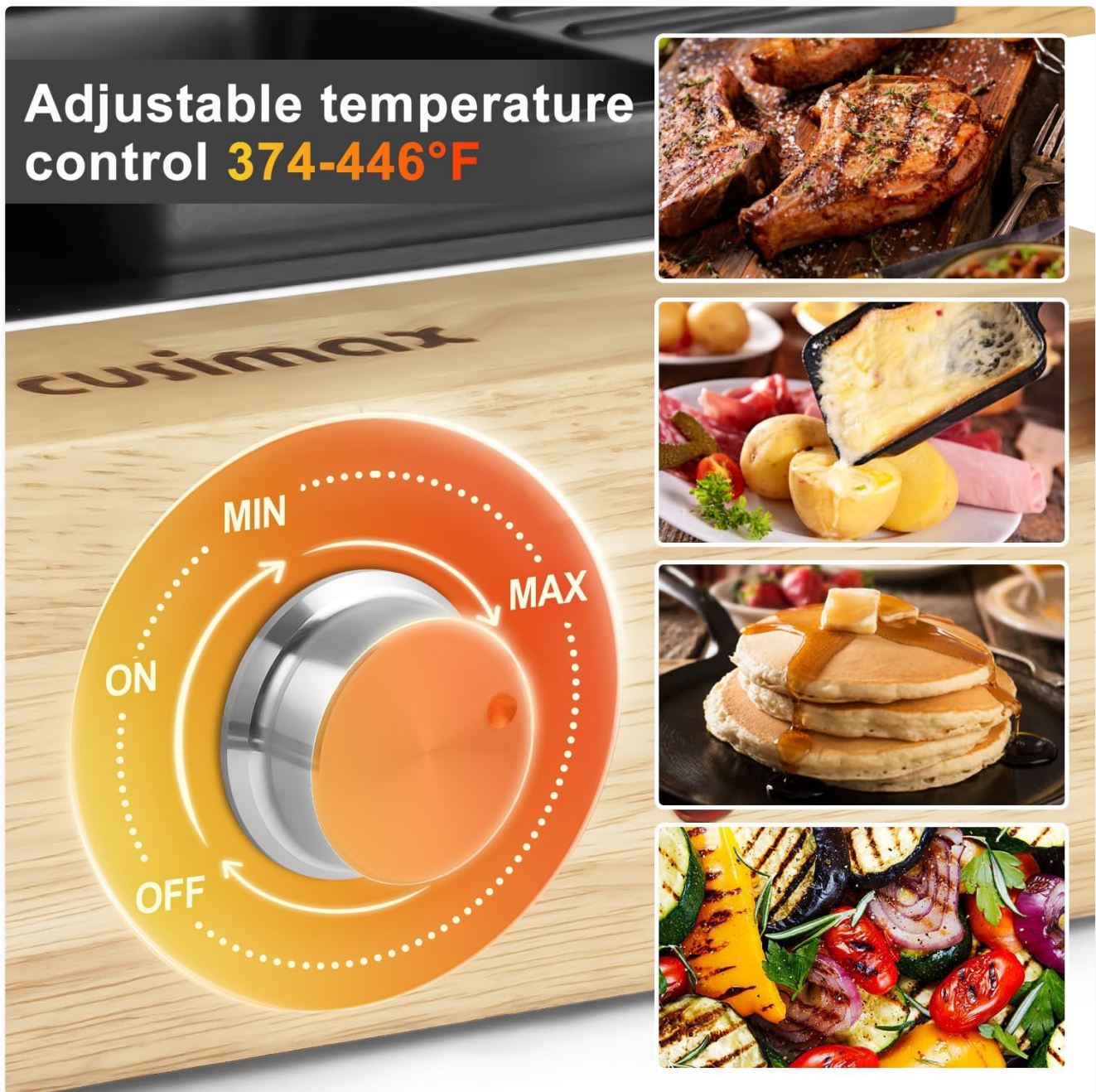
Image 4: The adjustable temperature control knob and examples of food that can be cooked on the grill, including steak, raclette cheese, pancakes, and grilled vegetables.