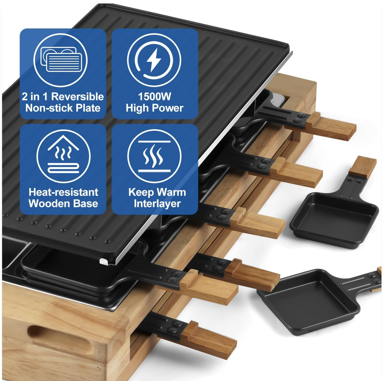
Image 3: The assembled grill, highlighting the 2-in-1 reversible non-stick plate, 1500W high power, heat-resistant wooden base, and the keep-warm interlayer.