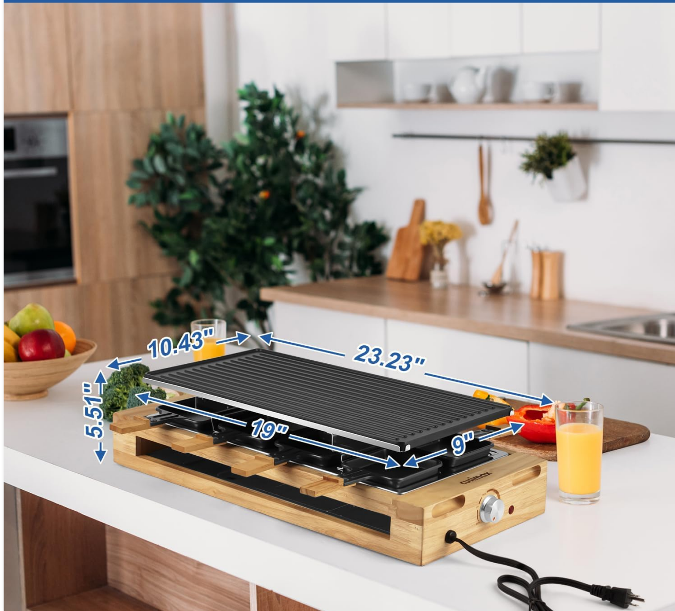
Image 6: Diagram illustrating the dimensions of the CUSIMAX Raclette Table Grill.