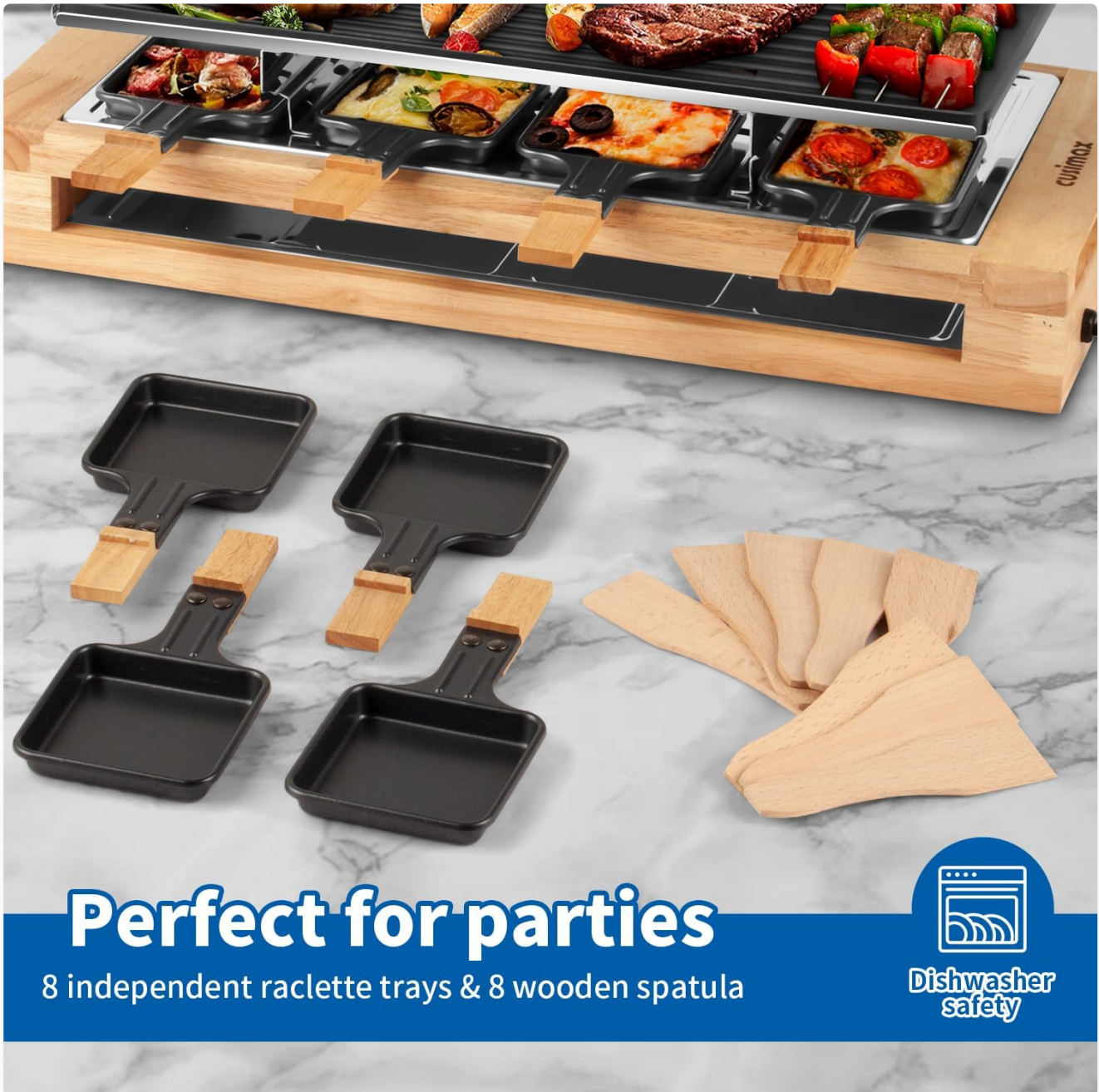
Image 5: The 8 independent raclette pans and 8 wooden spatulas, highlighting their suitability for parties and ease of cleaning.