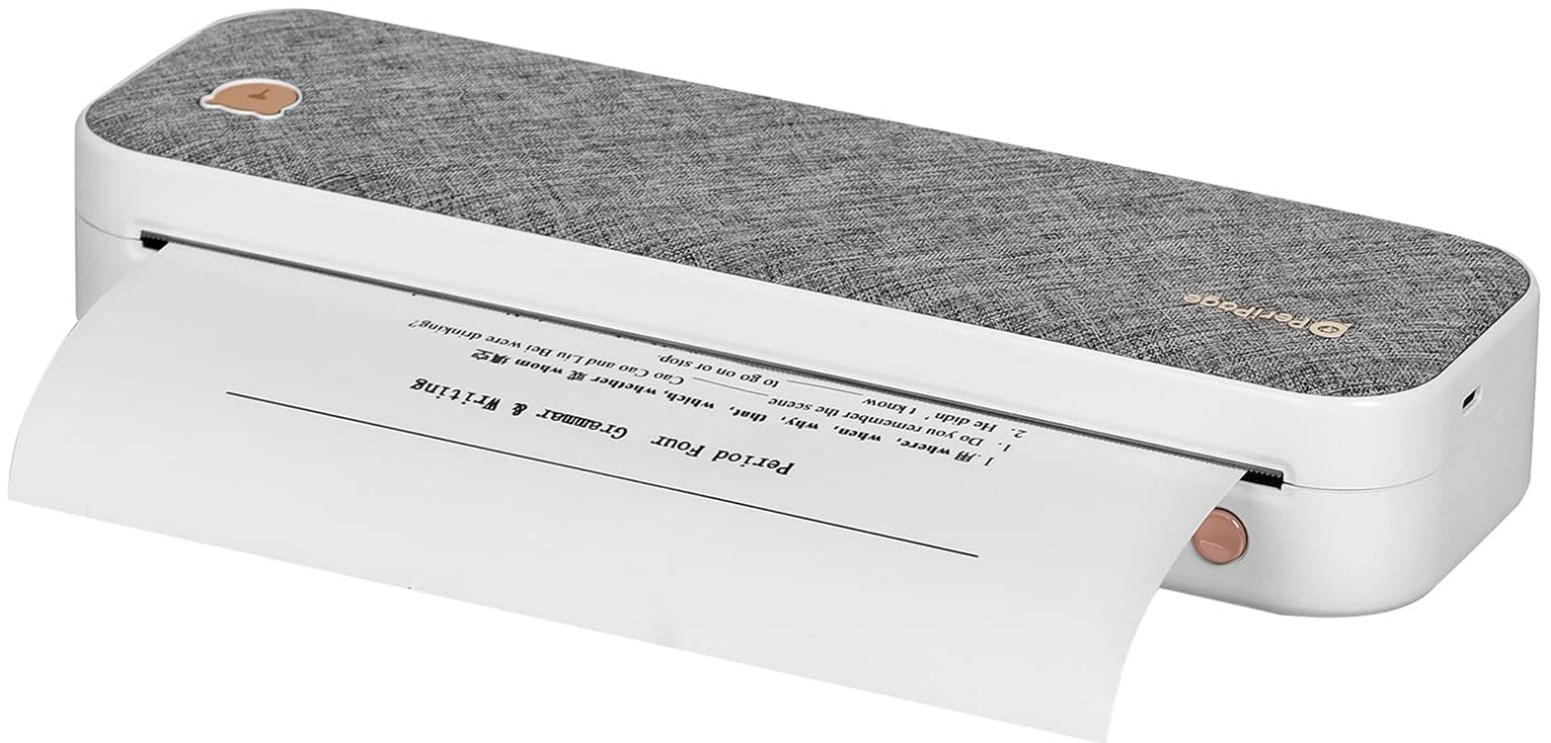
Image: The PeriPage A40 printer actively printing a document, showcasing its compact design and paper output.

Welcome to the user manual for your new PeriPage A40 Portable Thermal Printer. This compact and versatile printer is designed for convenient printing of documents, photos, and various materials on thermal paper. It supports multiple paper sizes and offers seamless connectivity via Bluetooth and USB. Please read this manual thoroughly to ensure proper setup, operation, and maintenance of your device.