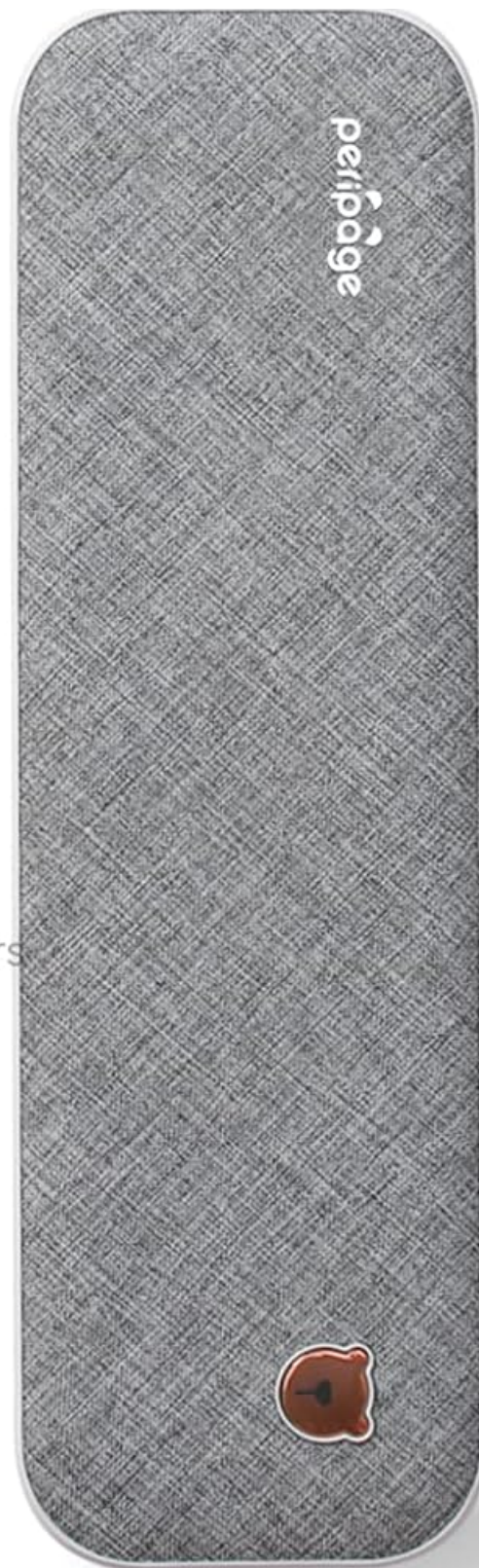
Image: Visual details on the long standby time and powerful battery capacity of the PeriPage A40 printer.