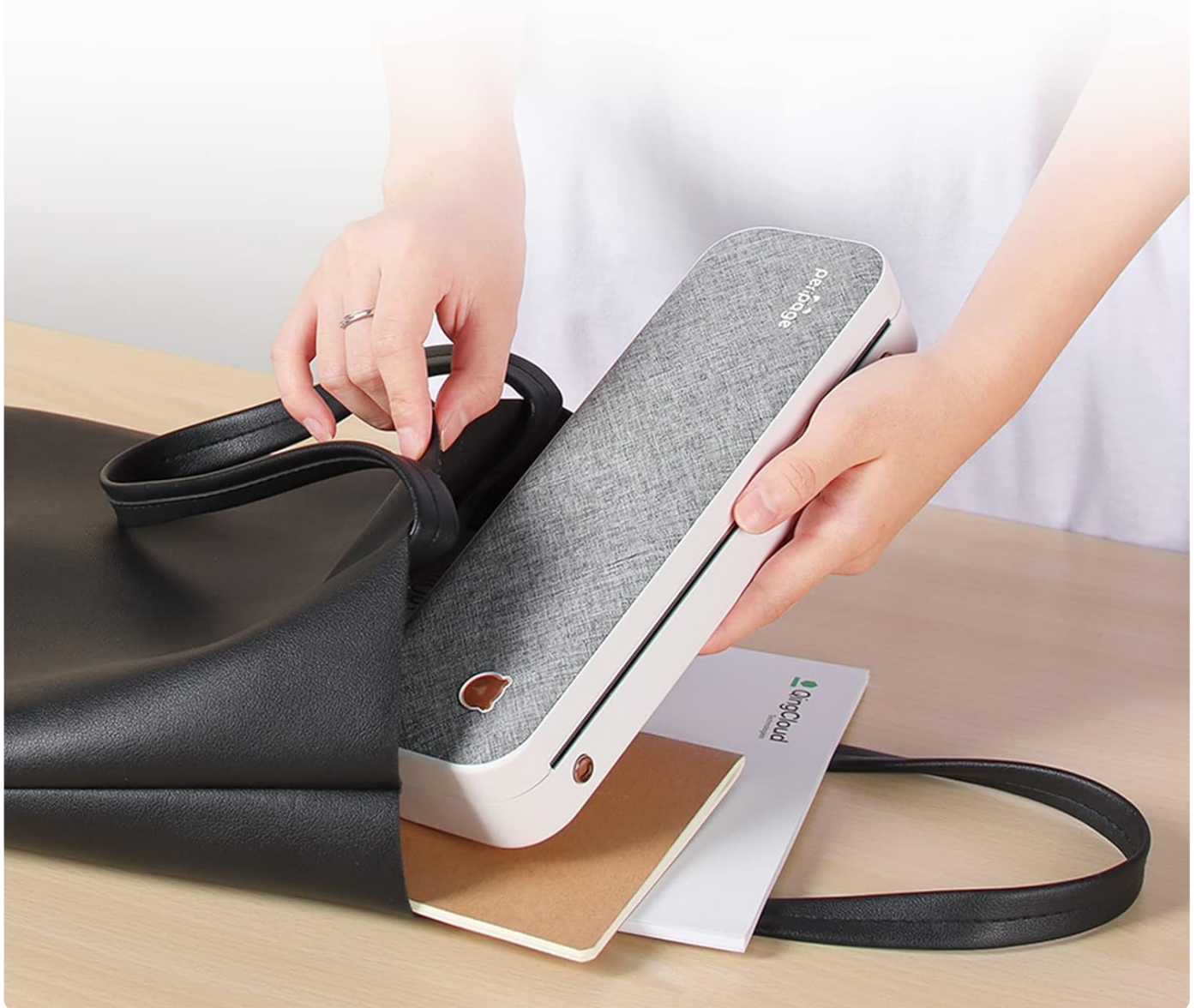
Image: A person demonstrating the portability of the PeriPage A40 printer by easily placing it into a bag.

Print wherever you go , carry it easily More efficient for business