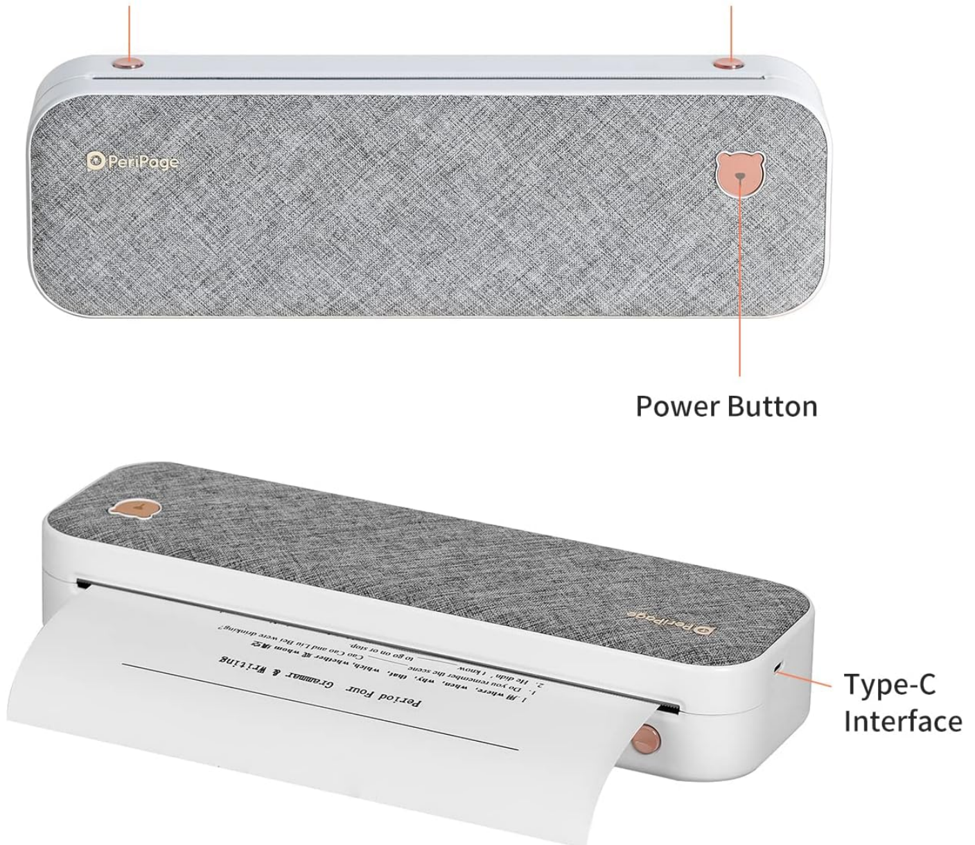
Image: A visual guide showing how to open the printer cover by pressing side buttons, and identifying the power button and Type-C interface.

Press the buttons at the same time to open the cover