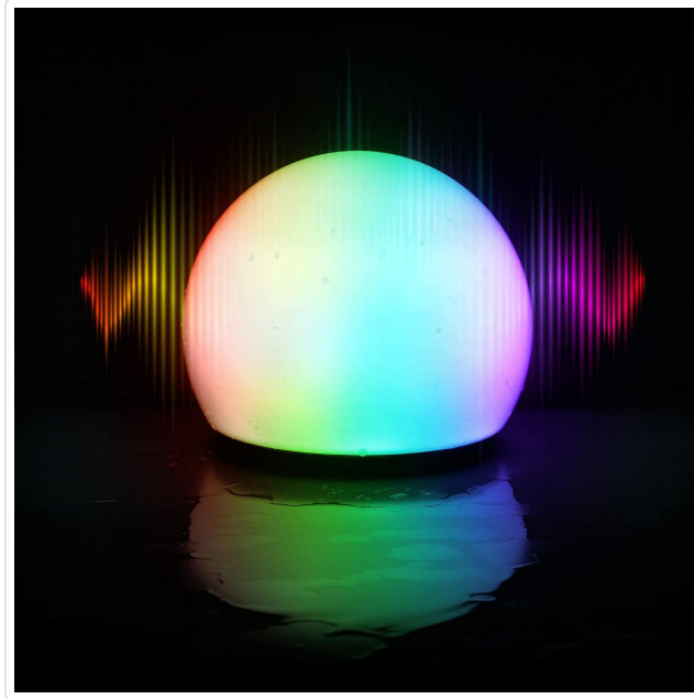
Image: The Orb+ displaying vibrant, sound-reactive light patterns, with visual representations of sound waves on either side, illustrating its music sync feature.