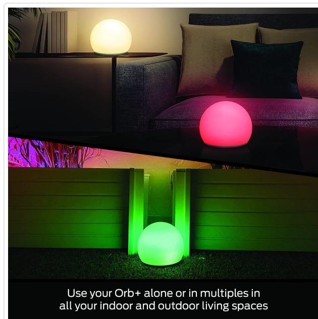
Image: Multiple Orb+ lights illuminating various indoor and outdoor spaces, including a living room and a garden, showcasing their versatility for different environments.