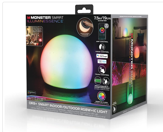
Image: The Monster Smart Illuminence Orb+ in its retail packaging, showcasing its features and design.