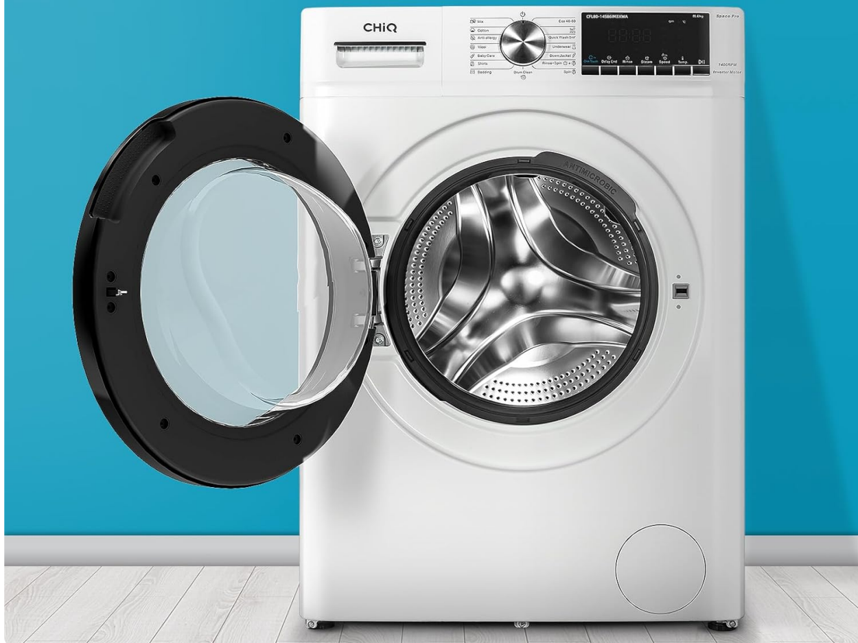
Detailed view of the intuitive control panel, showing the program selection dial and digital display.