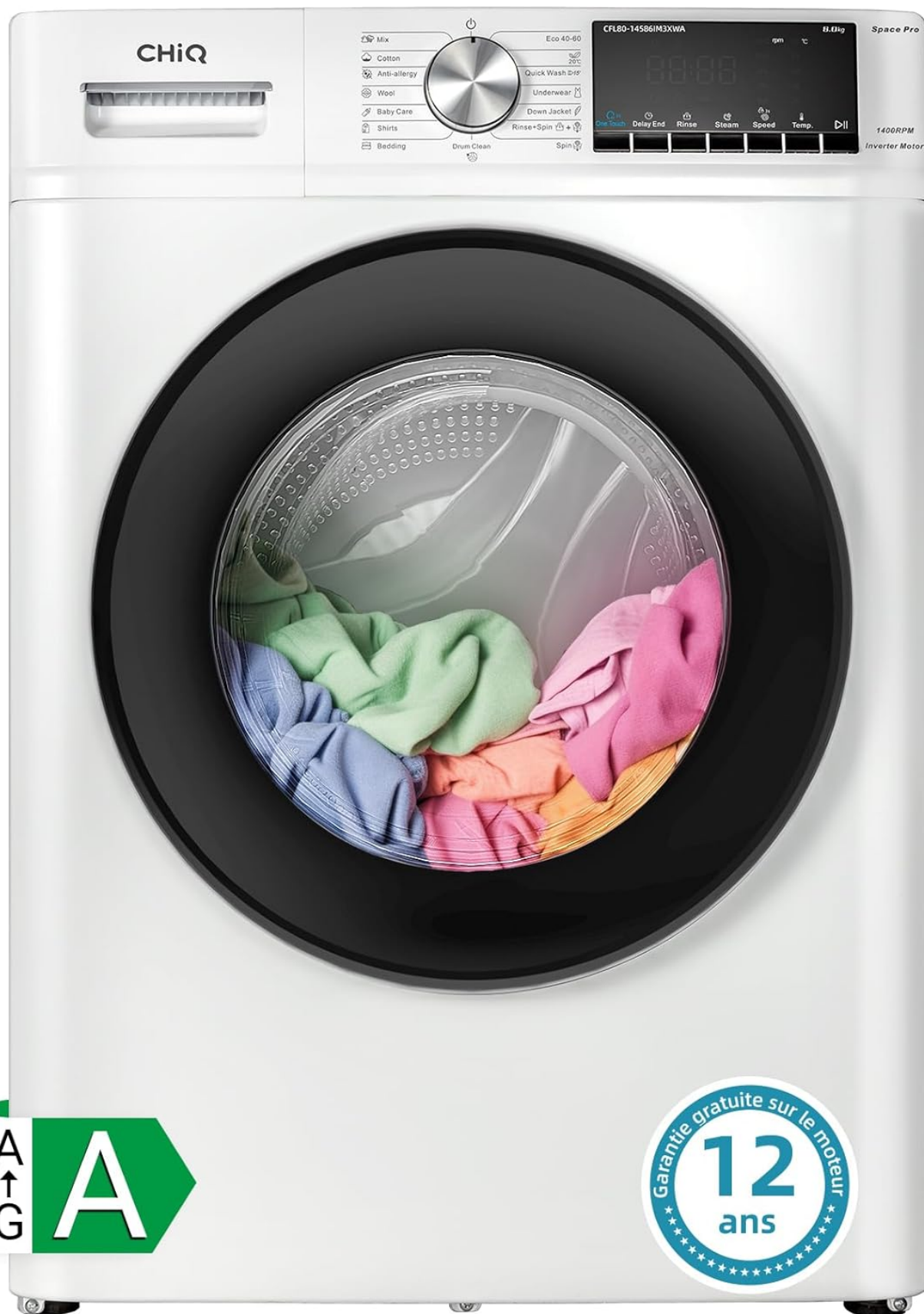
Front view of the CHI Q 8kg washing machine with a full load of laundry.