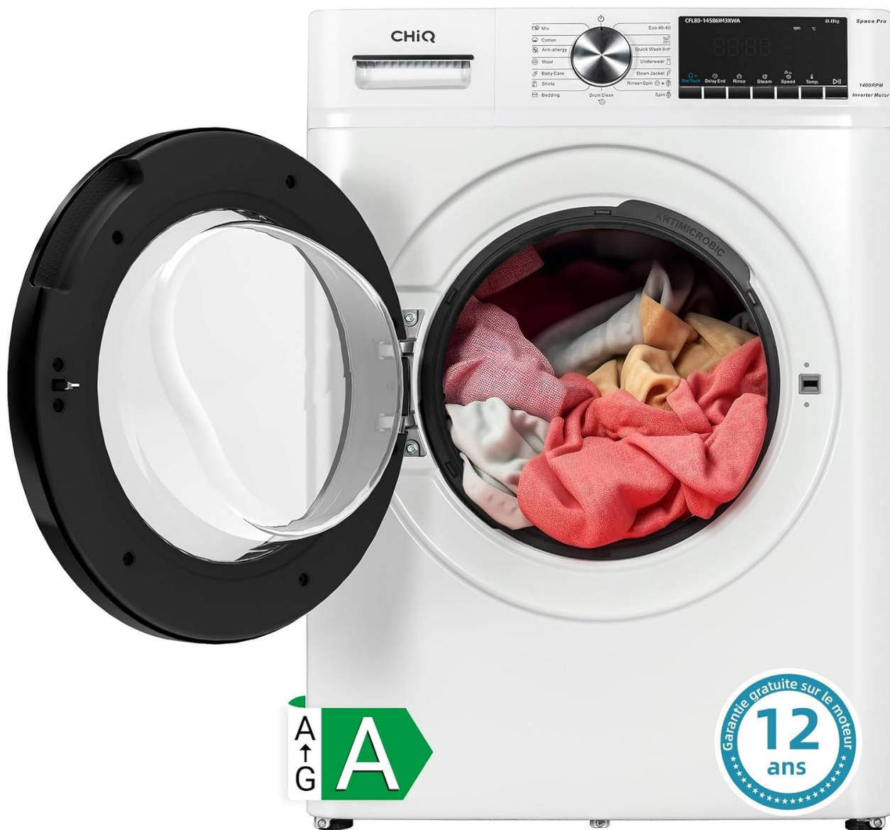
The washing machine with its door open, revealing the spacious drum and laundry.