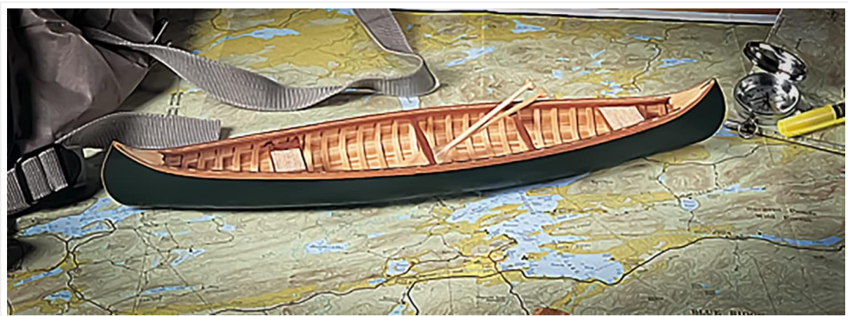
Image: A fully assembled Indian Girl Canoe model, showcasing its intricate details, placed on a map alongside miniature camping gear, suggesting its display purpose.