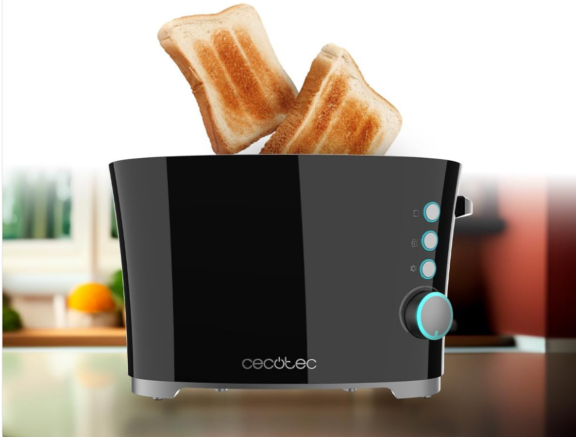
Figure 6: The toaster features an automatic shut-off and pop-up mechanism for convenience.