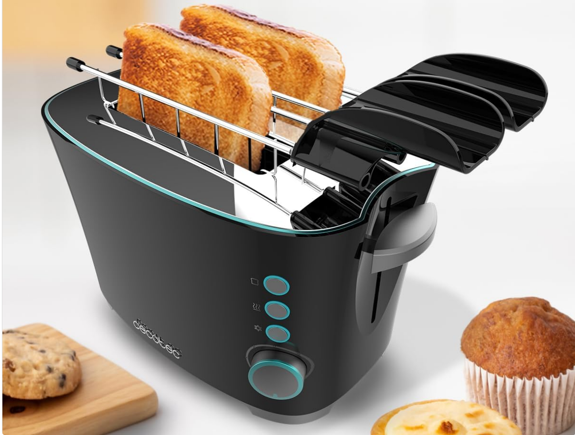
Figure 3: The toaster includes tongs for safe and easy toast extraction.