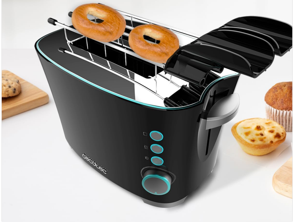
Figure 5: The extra-lift system allows for convenient removal of smaller items.