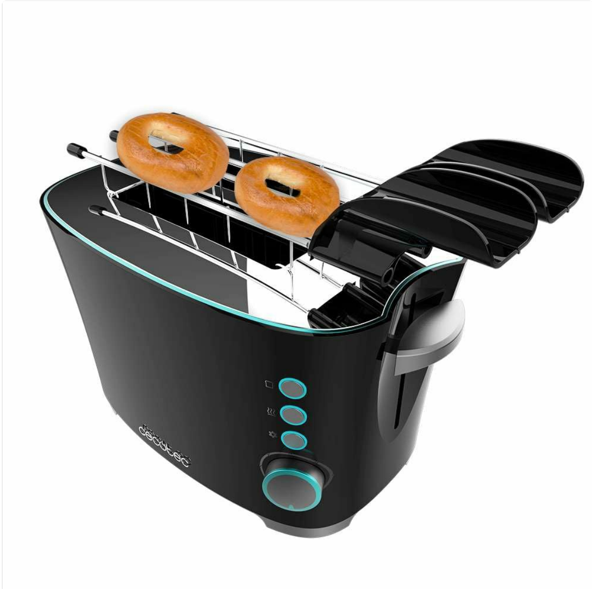
Figure 1: Front view of the Cecotec Toast&Taste 1500 Toaster with bread slices.

The Cecotec Toast&Taste 1500 is a vertical toaster designed for efficient toasting of various bread types. It features two wide slots, a browning control dial, and multiple function buttons.