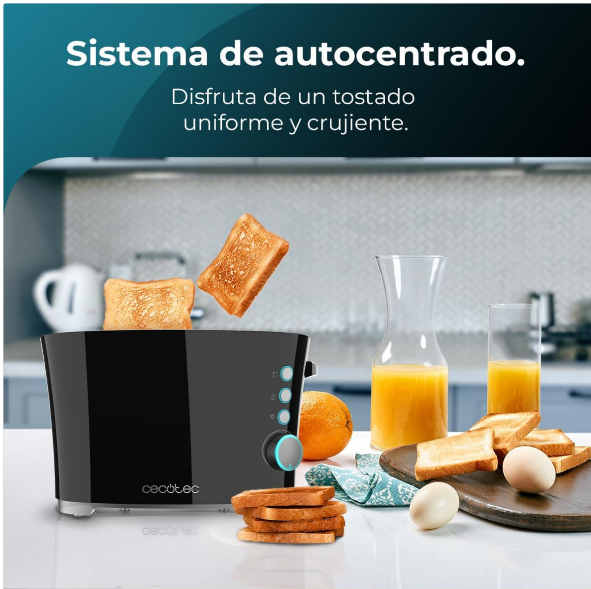
Figure 4: The self-centering system ensures uniform toasting for crispy results.