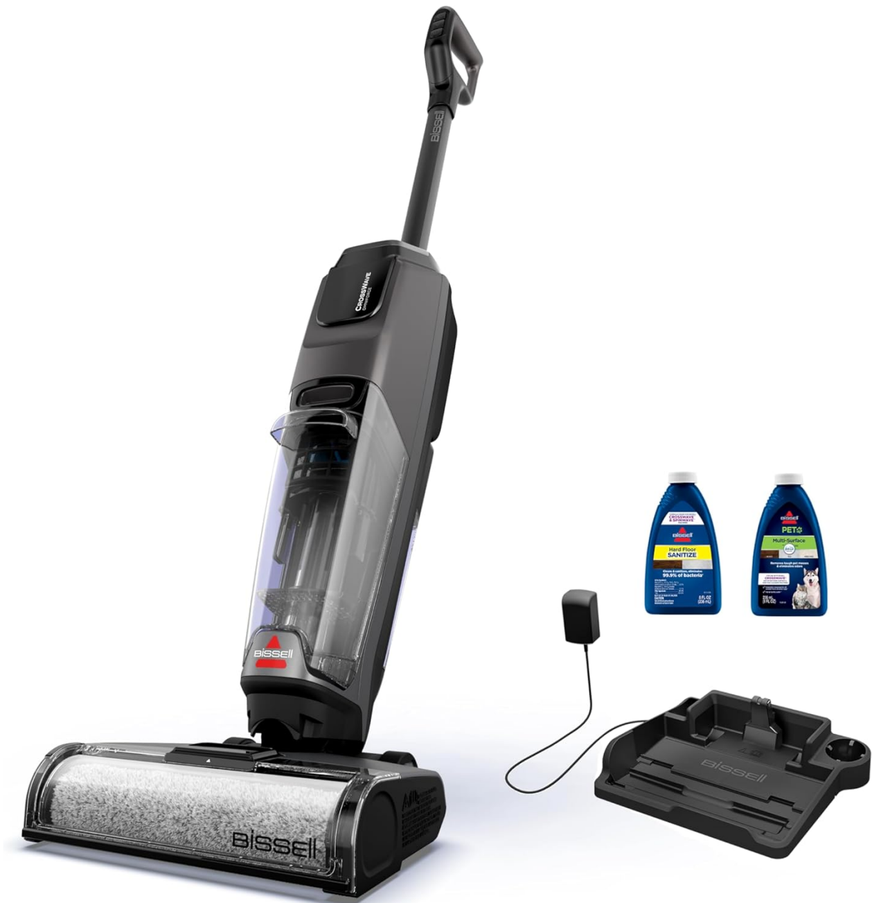
Figure 1: Bissell CrossWave OmniForce with charging dock and cleaning solutions.