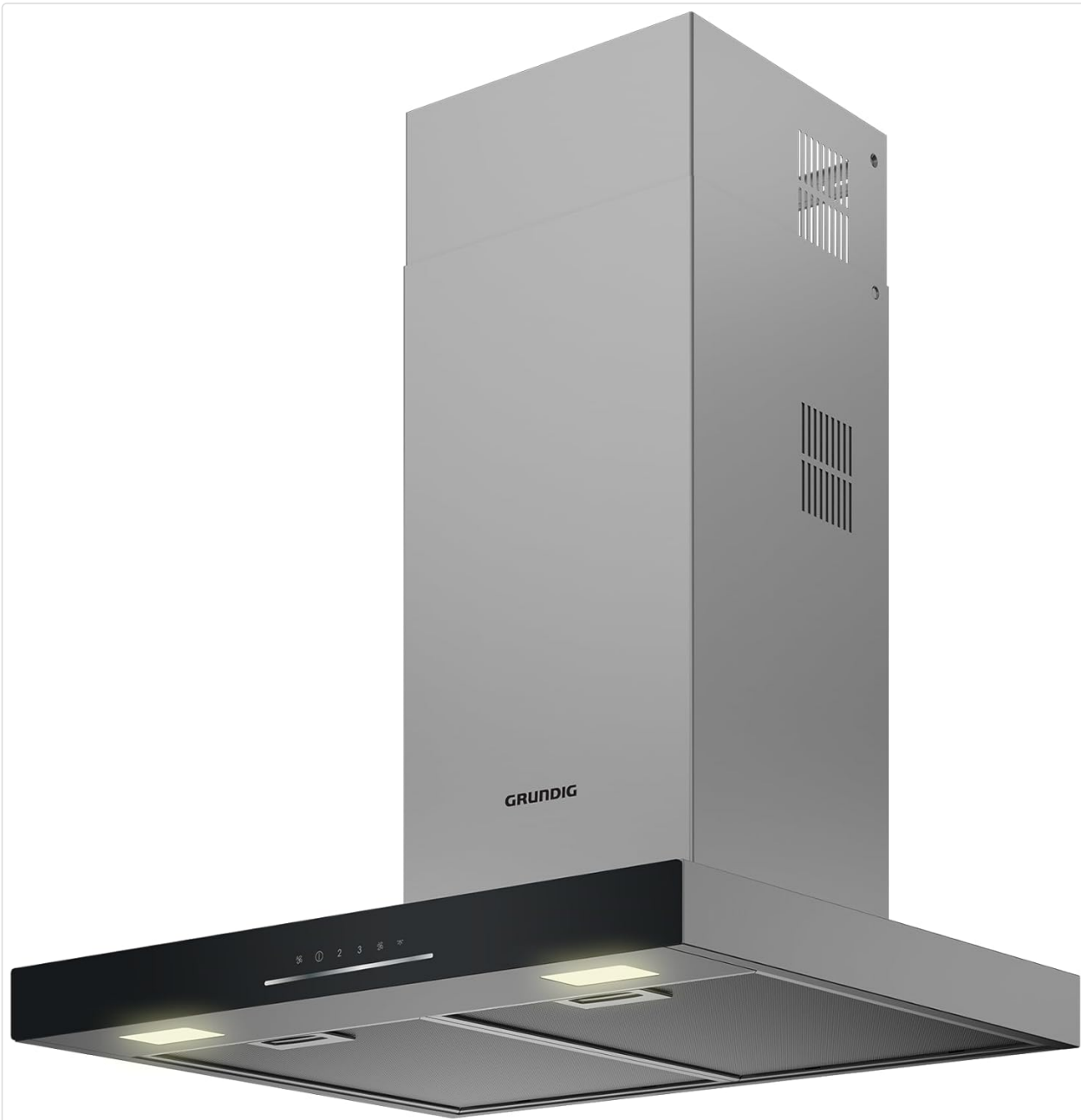
Figure 2.1: Front view of the Grundig GDKP2464BBSC T-Shaped Cookerhood. This image shows the overall design of the stainless steel cookerhood, including the main body, the black control panel, and the integrated lights.