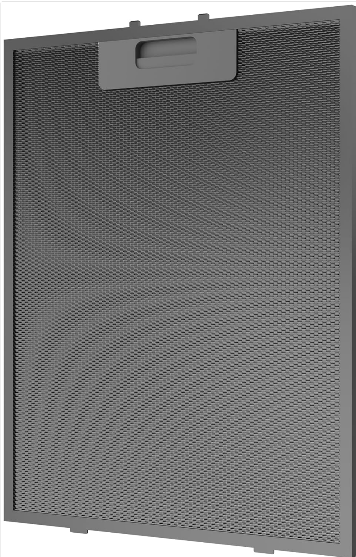
Figure 5.1: Close-up view of a single metal grease filter. This image shows the mesh structure of the filter, designed to trap grease particles from cooking fumes.