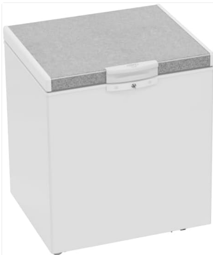
Figure 1.1: Front view of the Defy Multimode Chest Freezer, closed.

Welcome to the user manual for your new Defy Multimode Chest Freezer with Chill-In Technology. This appliance is designed to provide reliable and energy-efficient food storage, offering flexibility with its multi-mode operation. Please read this manual thoroughly before operating your freezer to ensure safe and efficient use.