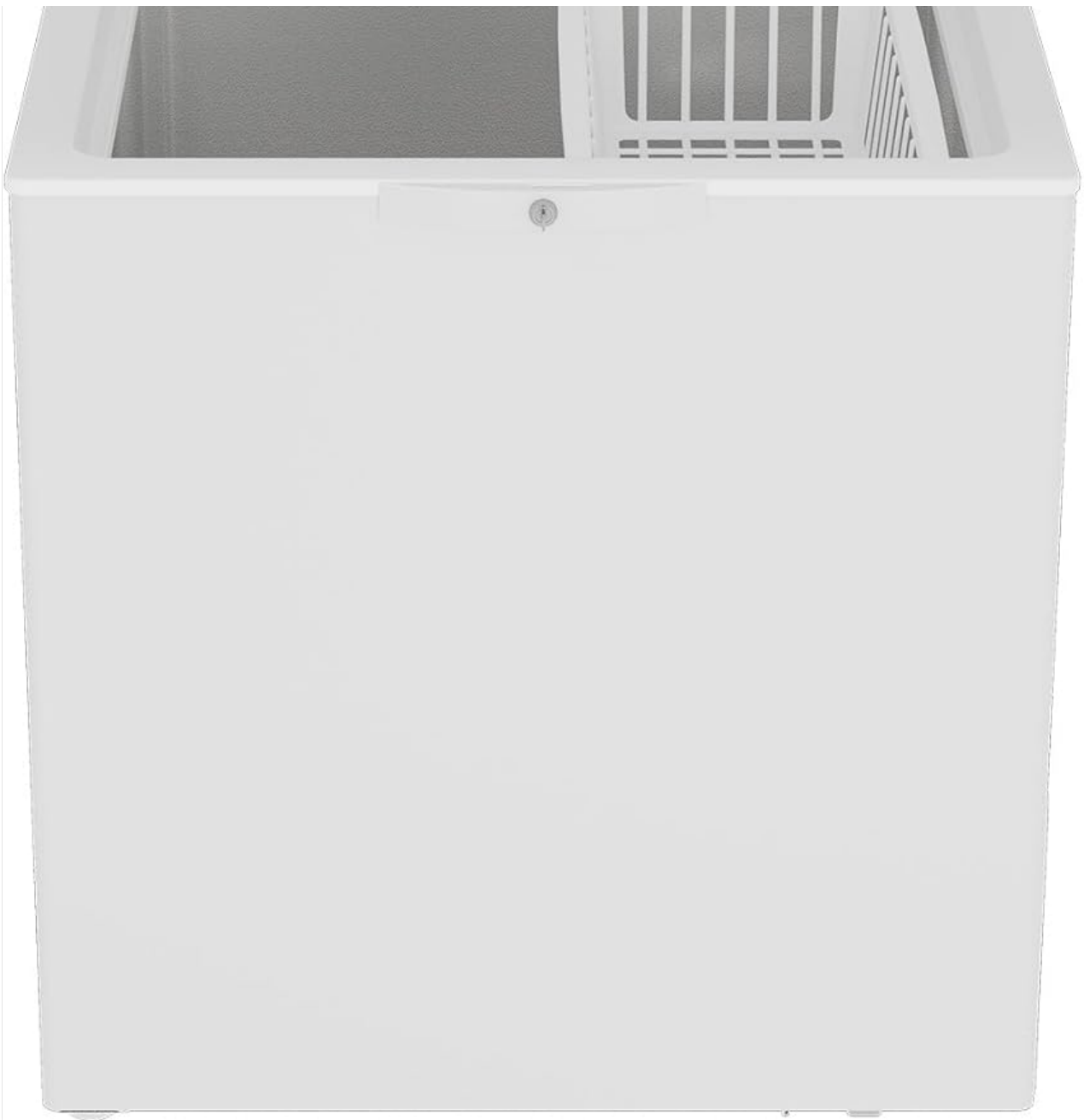
Figure 3.1: Interior view of the Defy Multimode Chest Freezer with the lid open, highlighting the movable basket.