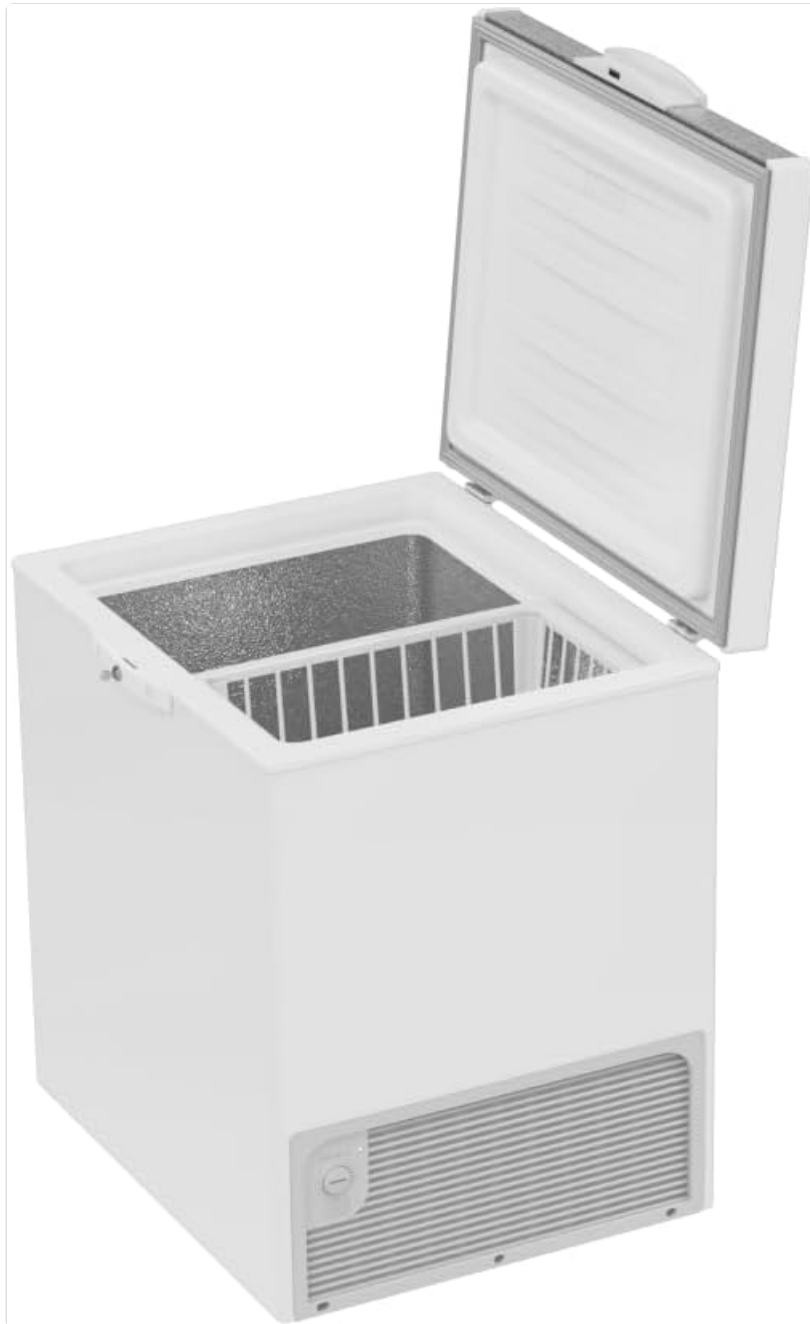
Figure 4.1: Rear view of the freezer, illustrating the area where ventilation is crucial.