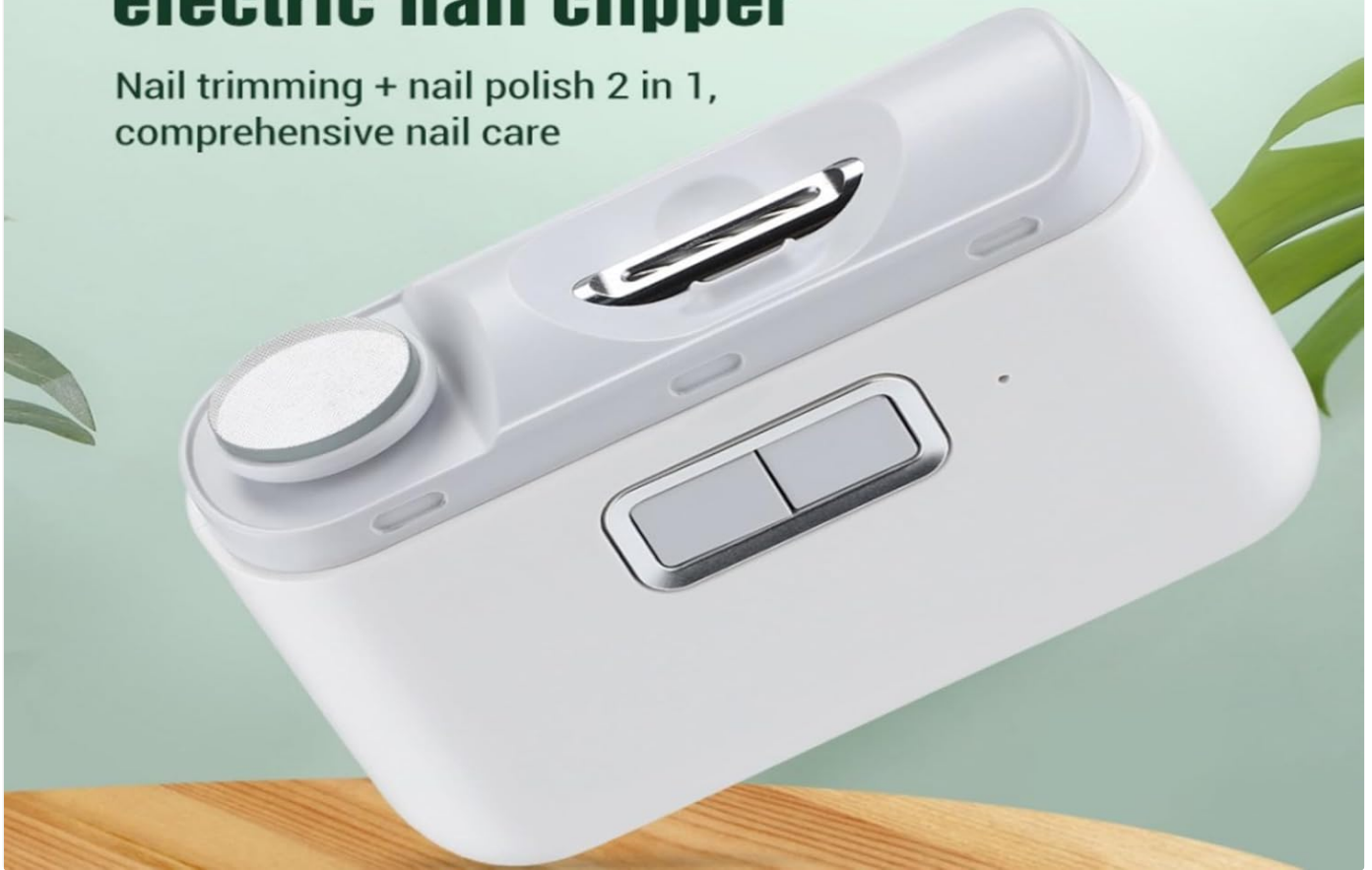
Image: The electric nail clipper highlighting its multifunctional design, combining nail trimming and polishing for comprehensive nail care.

Nail trimming + nail polish 2 in 1, comprehensive nail care