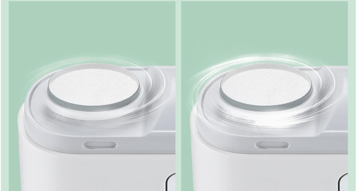
Image: Illustration of the two-speed settings available on the electric nail clipper, indicating suitability for both adults and children.