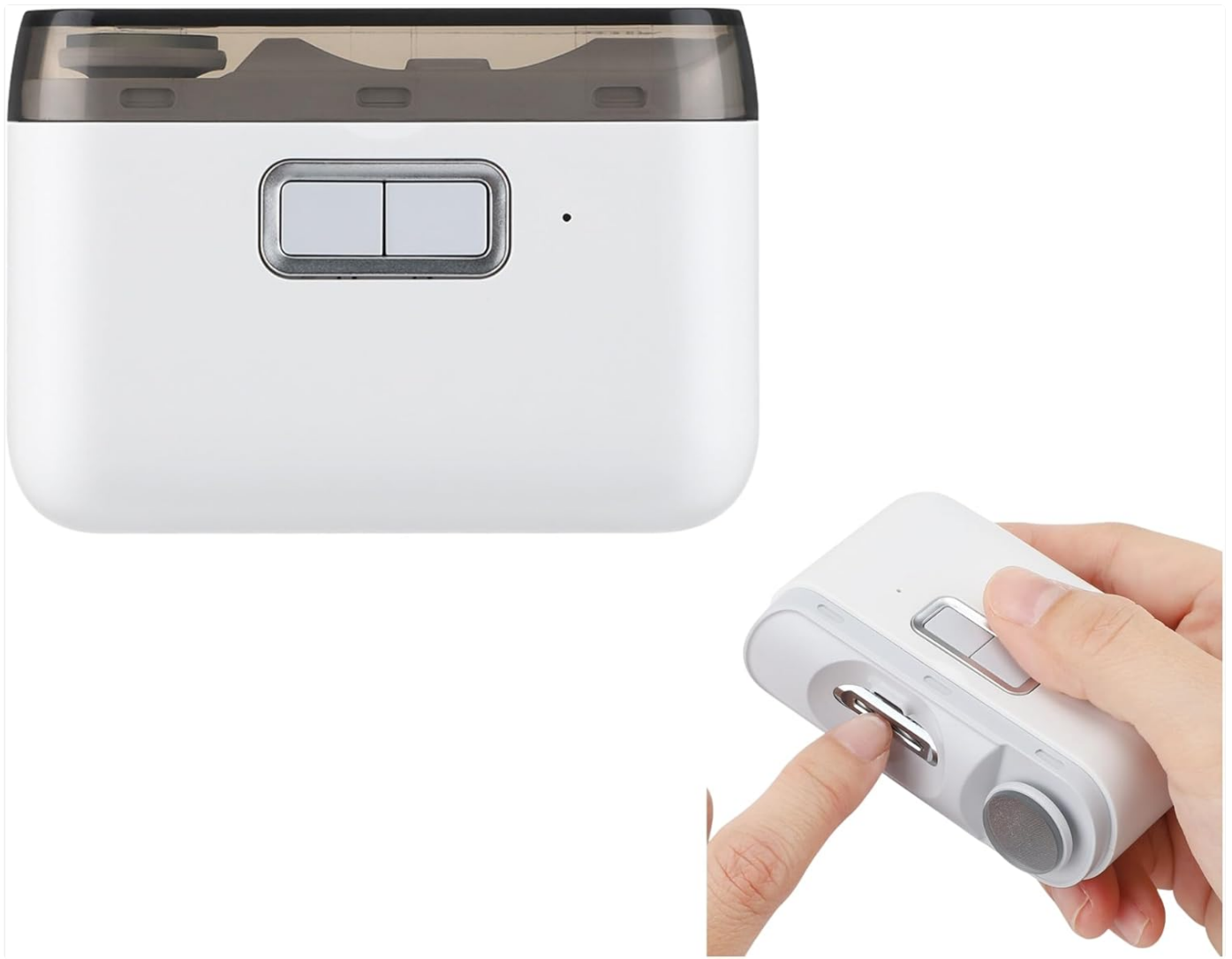
Image: Front view of the Bewinner Electric Nail Clipper, showing the two control buttons and the nail trimming slot.