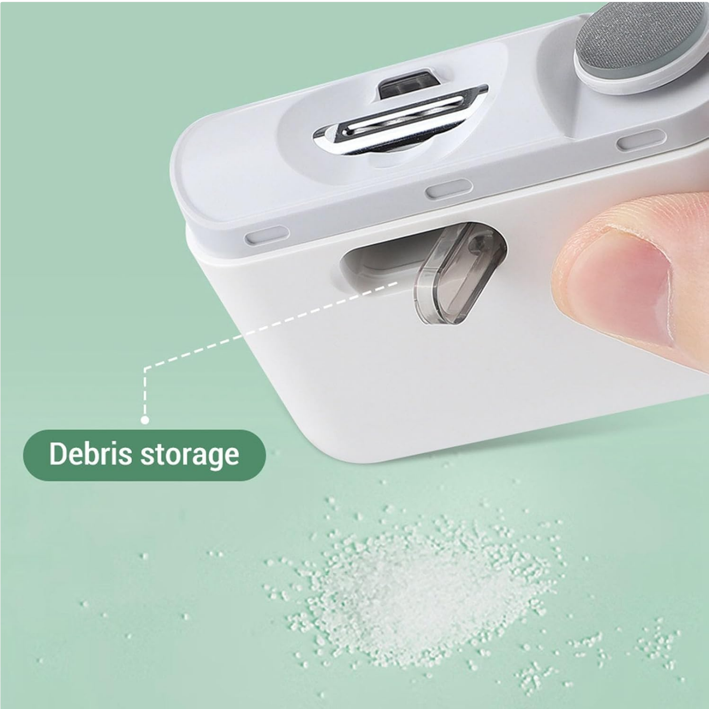
Image: A close-up view of the electric nail clipper's debris storage compartment, showing collected nail scraps for easy disposal.