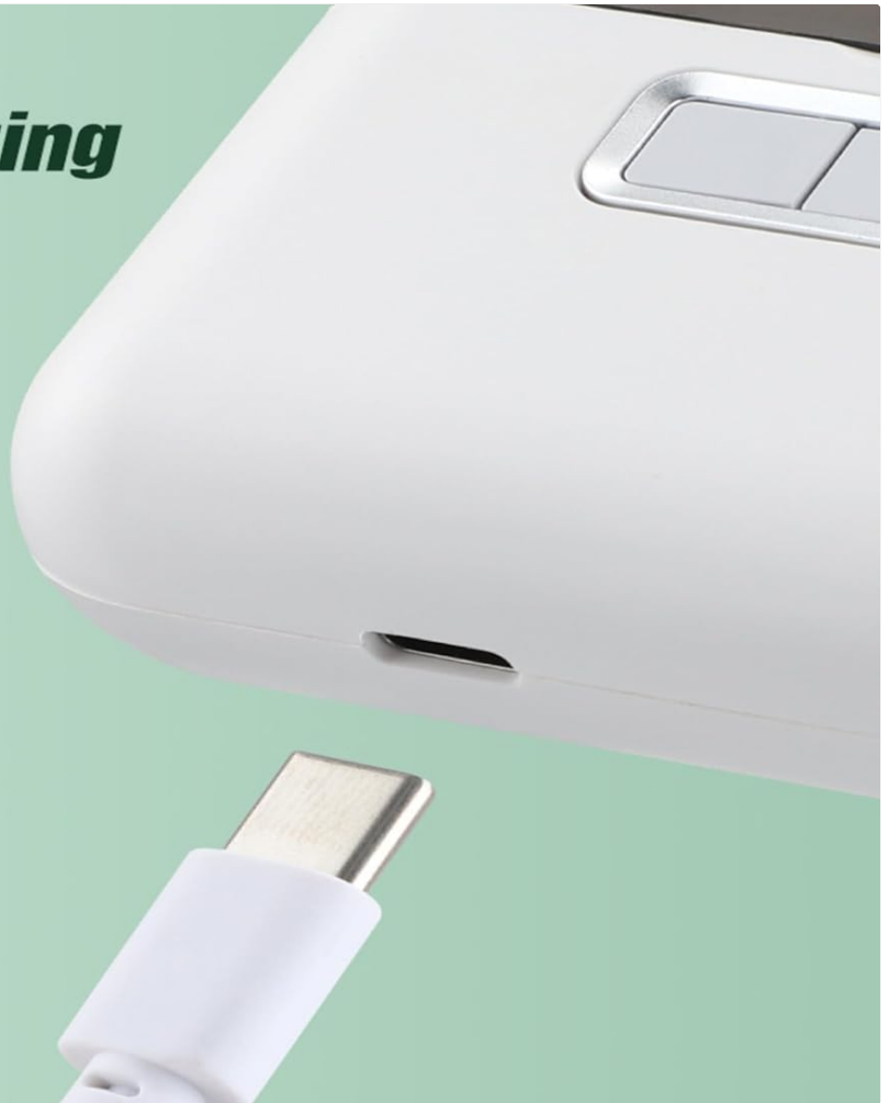
Image: Close-up of the electric nail clipper's Type-C charging port, illustrating its compatibility with various USB power sources for wireless use.