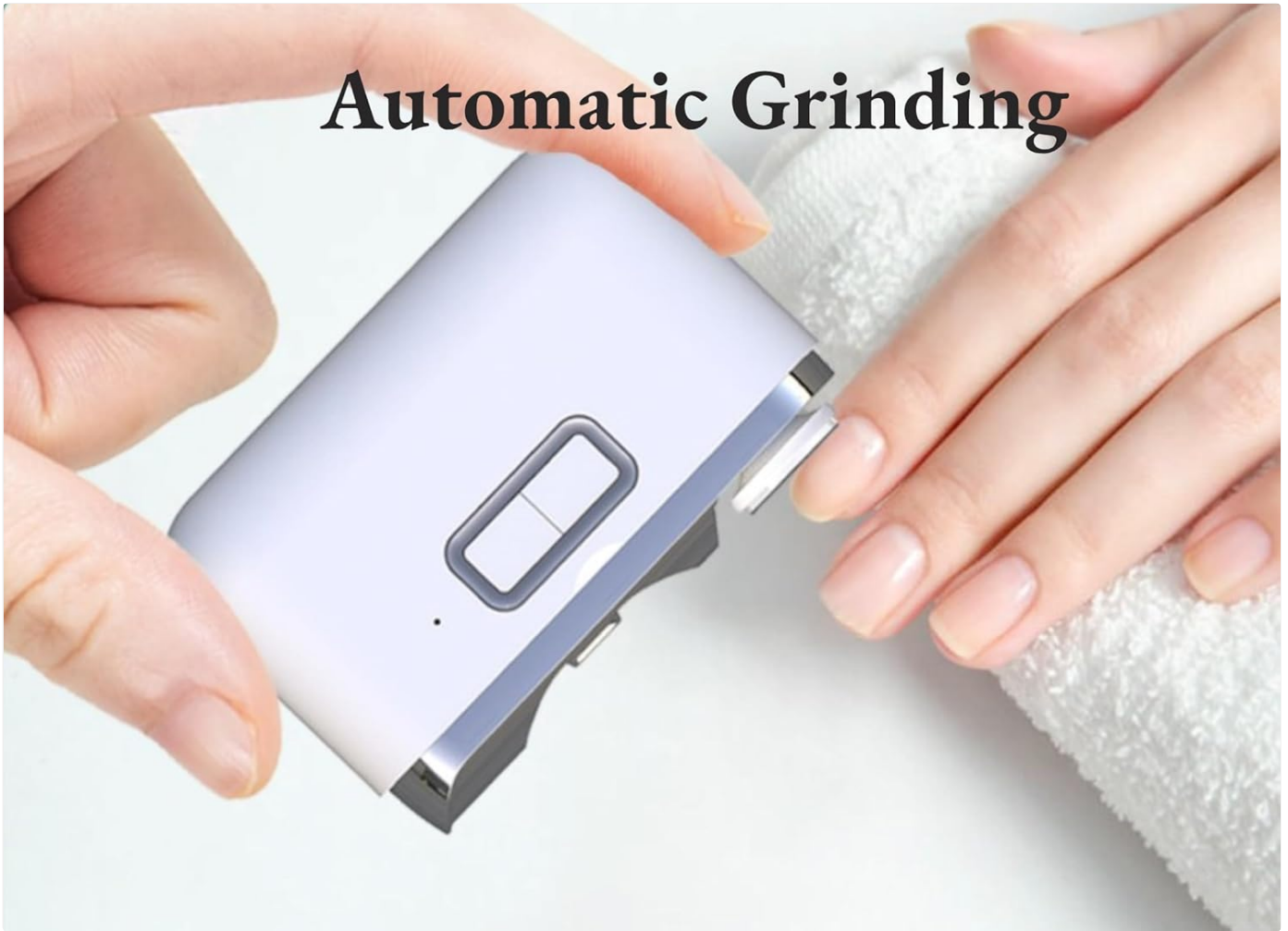
Image: A hand using the electric nail clipper for automatic nail trimming, showing the ease of use and the device's ergonomic design.