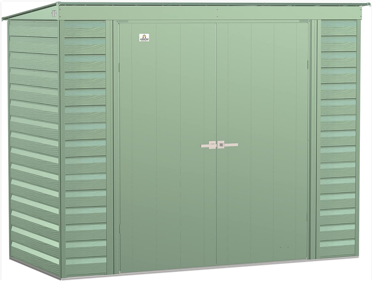
Image 1.1: Front view of the Arrow Sheds 8' x 4' Outdoor Steel Storage Shed.