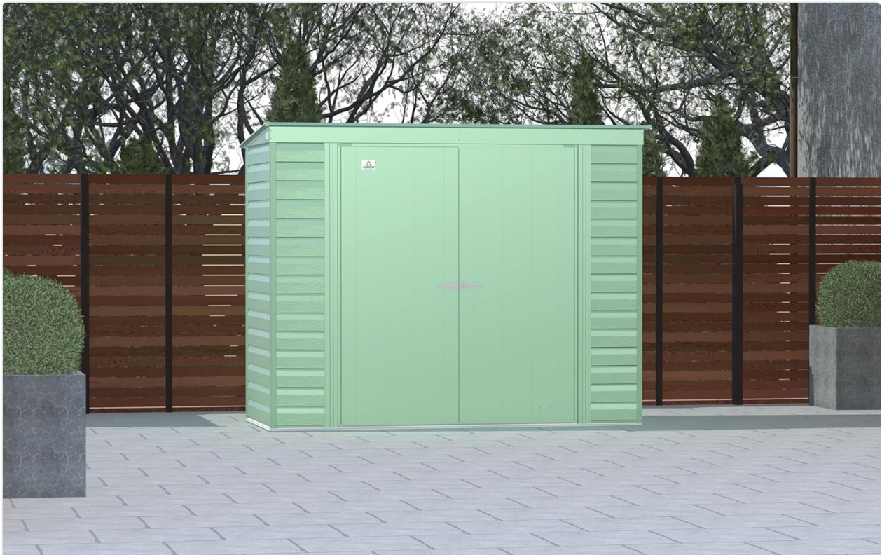
Image 6.1: The shed provides ample space for various outdoor equipment.