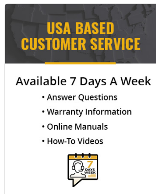
Image 9.2: Arrow offers dedicated customer support for all inquiries.