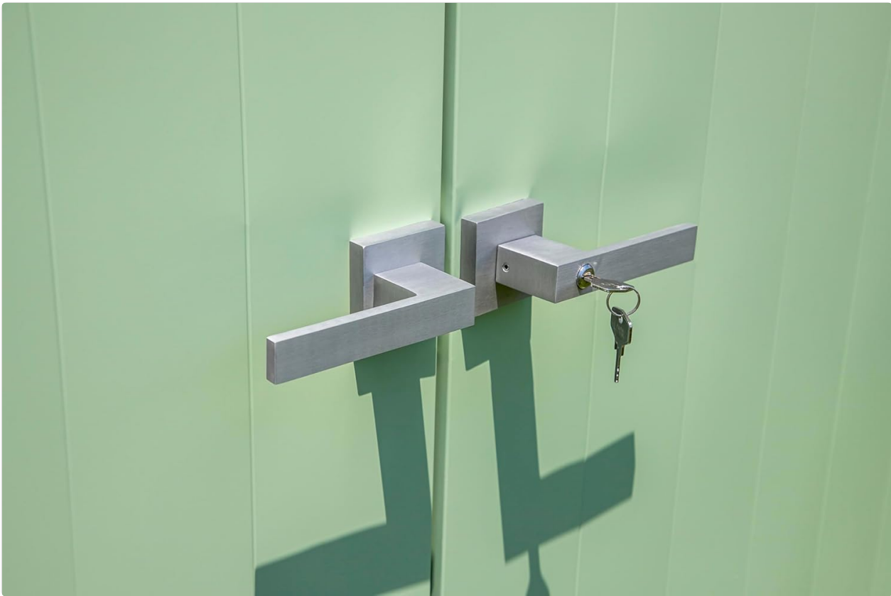
Image 3.2: Detail of the integrated keyed brushed metal locking handles for enhanced security.