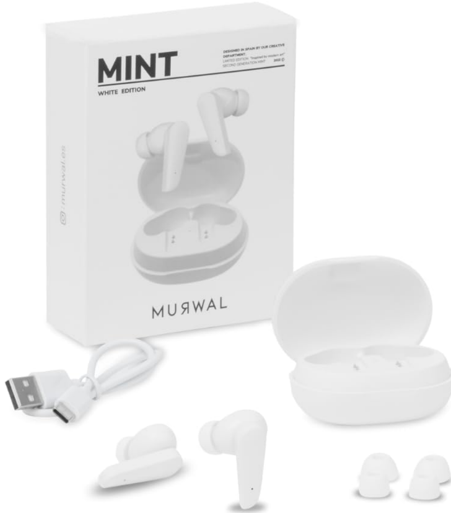
Image: Package Contents