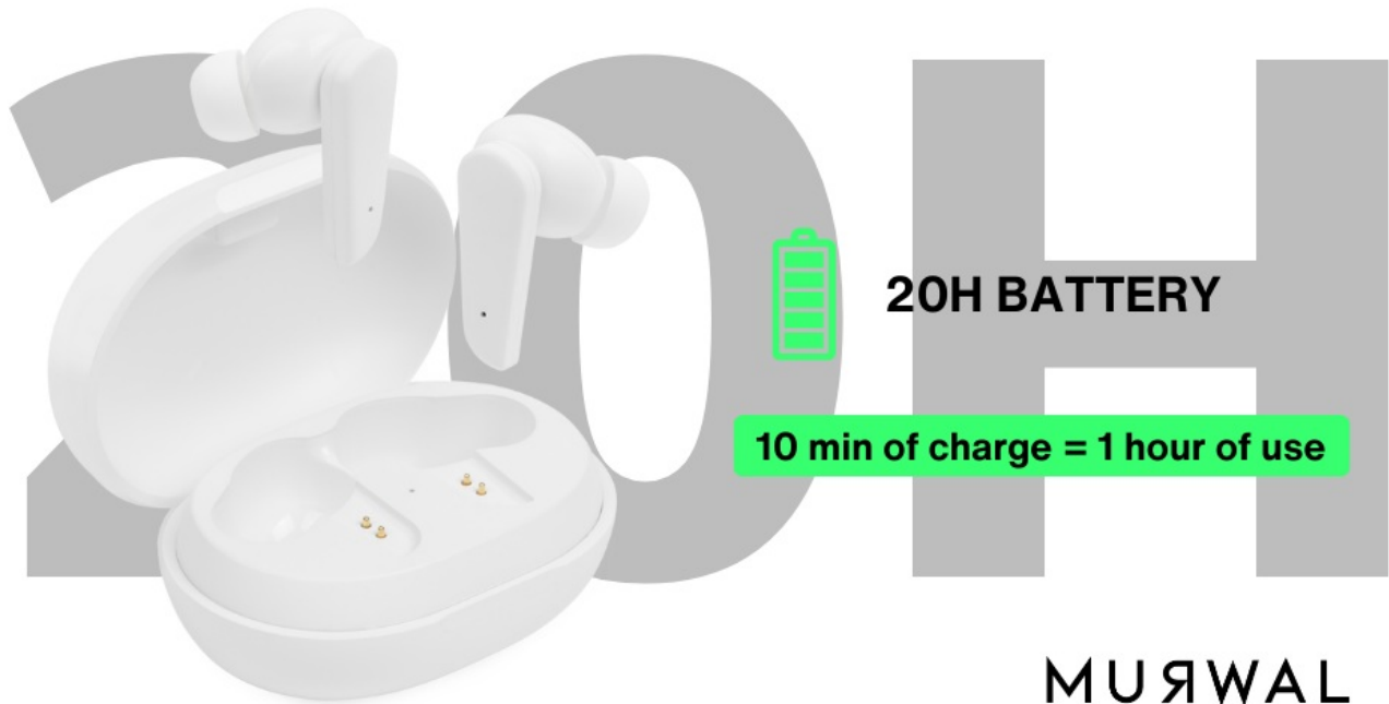
Image: Battery Duration Information