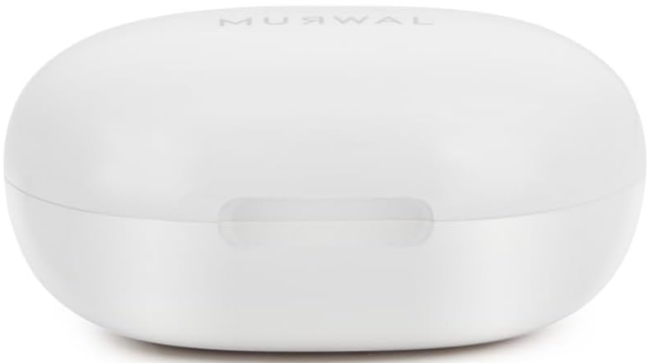
Image: murwal Mint Earbuds and Charging Case