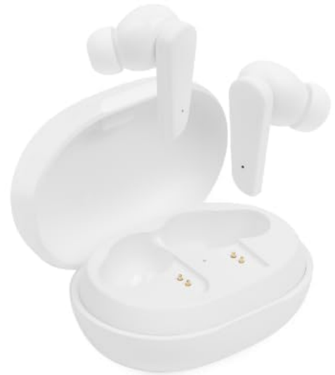
Image: Bluetooth 5.3 Pairing Process