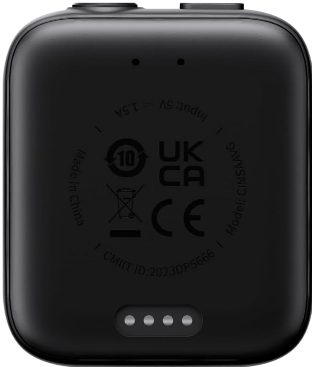
Image: The rear view of the Insta360 GPS Preview Remote, displaying regulatory marks and the model number CINSAAVG.