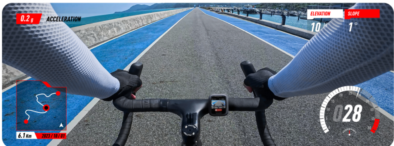
Image: A video frame with real-time GPS data overlays, including speed, elevation, and a map of the route, as captured with the Insta360 GPS Preview Remote.

速度、ルート、位置などのデータをリアルタイムで収集できます。Insta360アプリまたはStudioで、動画に追加できます。