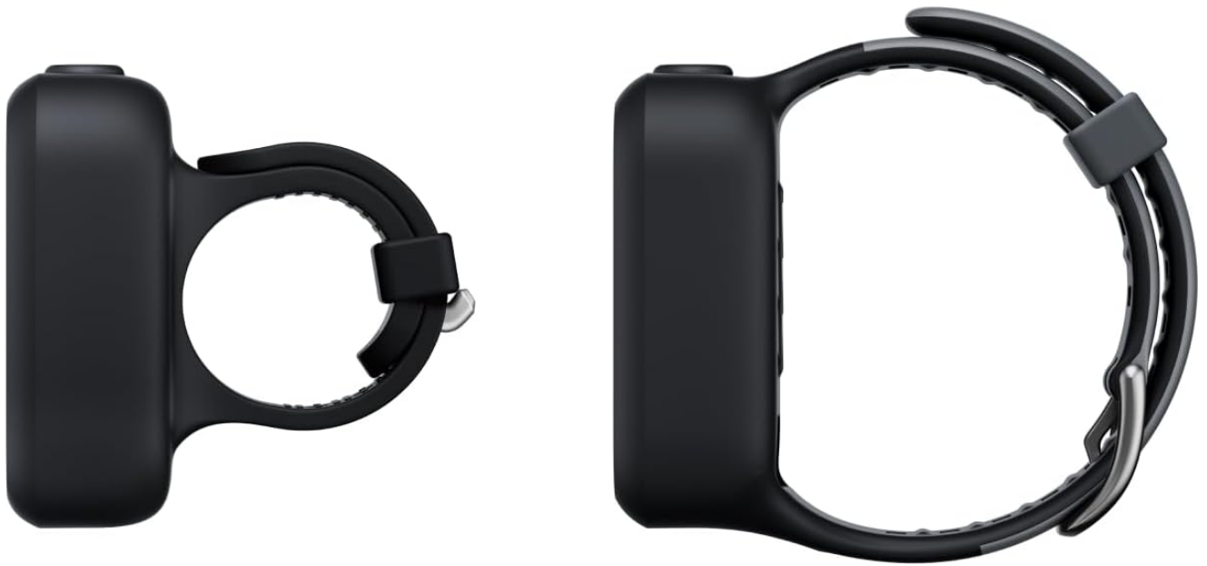
Image: The Insta360 GPS Preview Remote shown with the universal strap attached, ready for mounting on a handlebar or similar object.