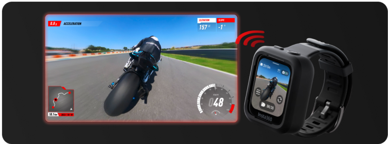
Image: The Insta360 GPS Preview Remote displaying a live preview from a camera mounted on a motorcycle, with speed and other data overlays.