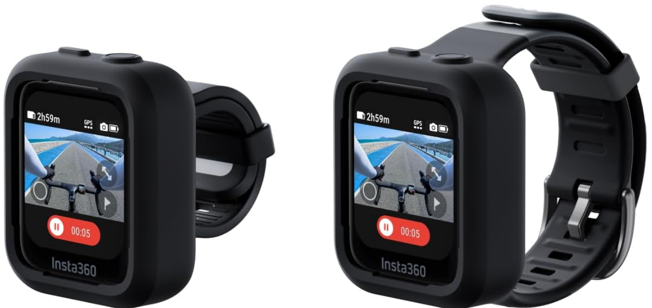
Image: The Insta360 GPS Preview Remote shown with the wrist strap attached, suitable for wearing on the wrist.