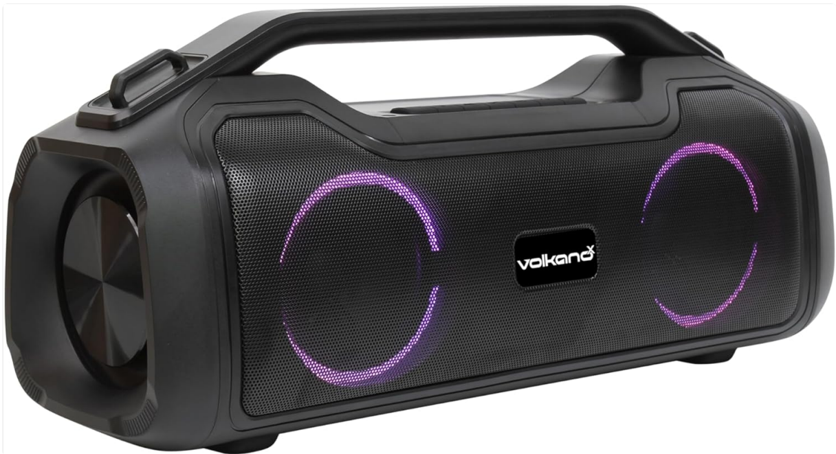
Image Description: A front-angled view of the Volkano X Adder Series Bluetooth Speaker in black. It features two main speaker grilles with purple LED rings, a central Volkano logo, and a sturdy handle on top. The overall design is rugged and portable.