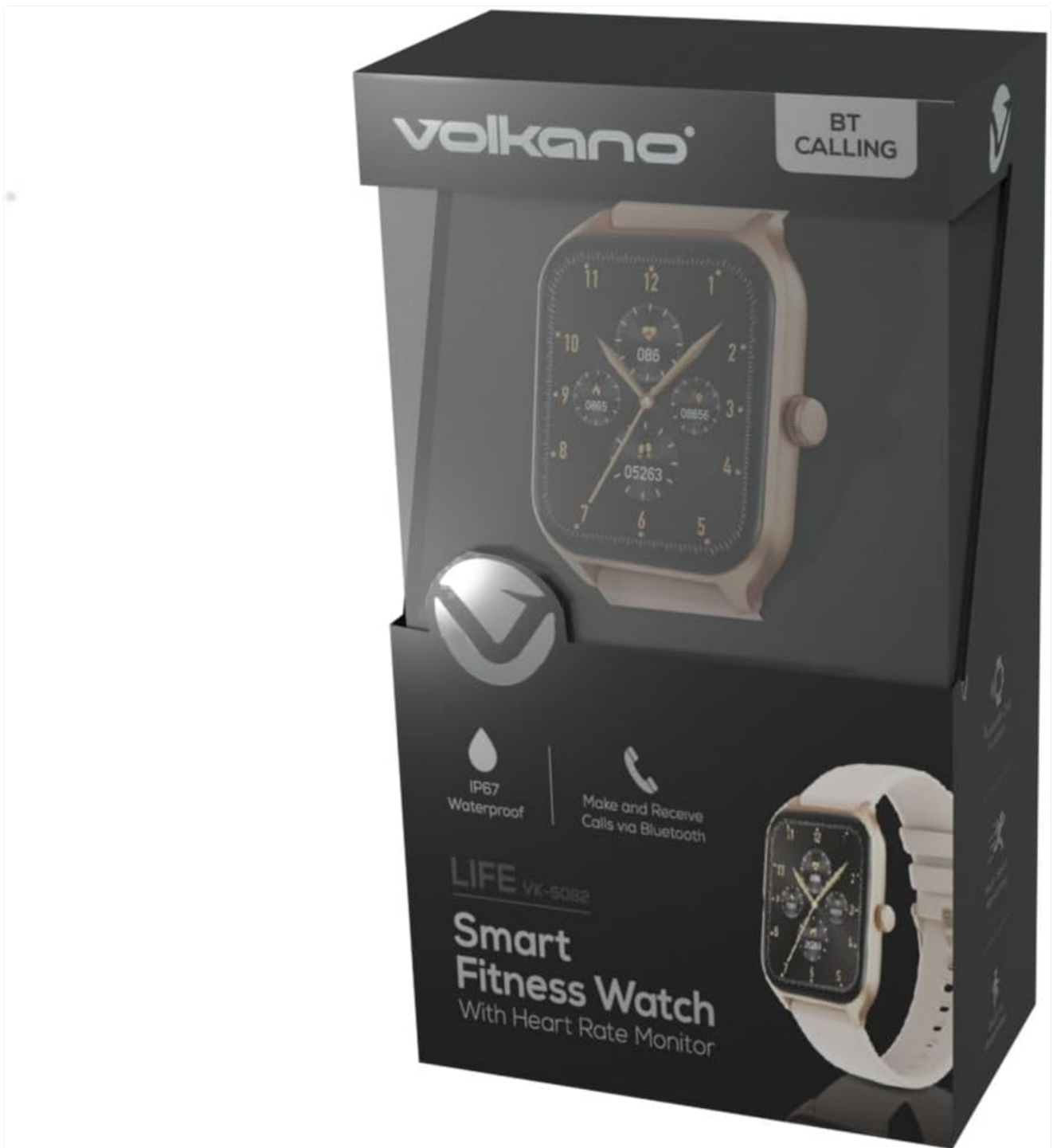
Figure 3.1: Product Packaging