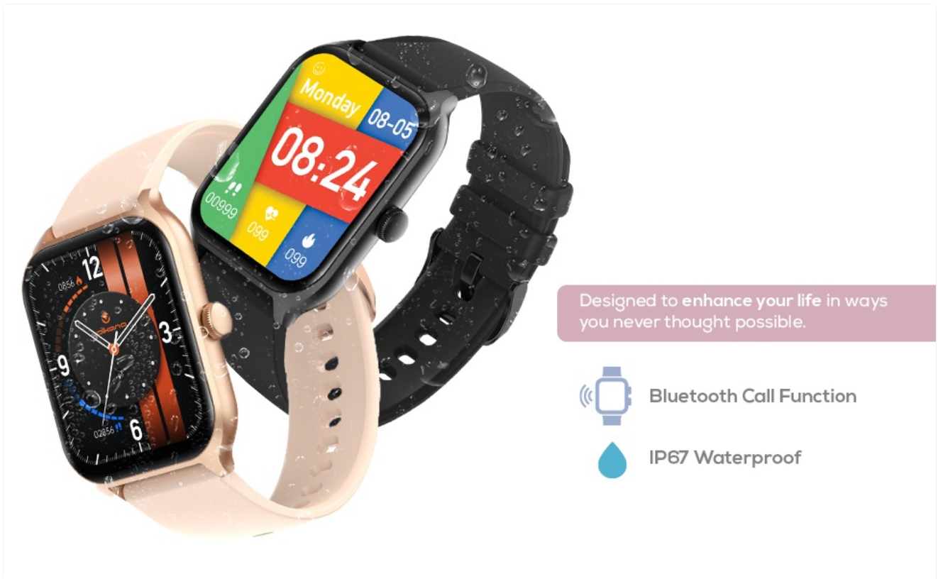
Figure 5.2: Bluetooth Call and Water Resistance