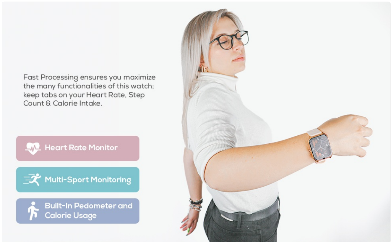
Figure 2.1: Health and Fitness Tracking Features