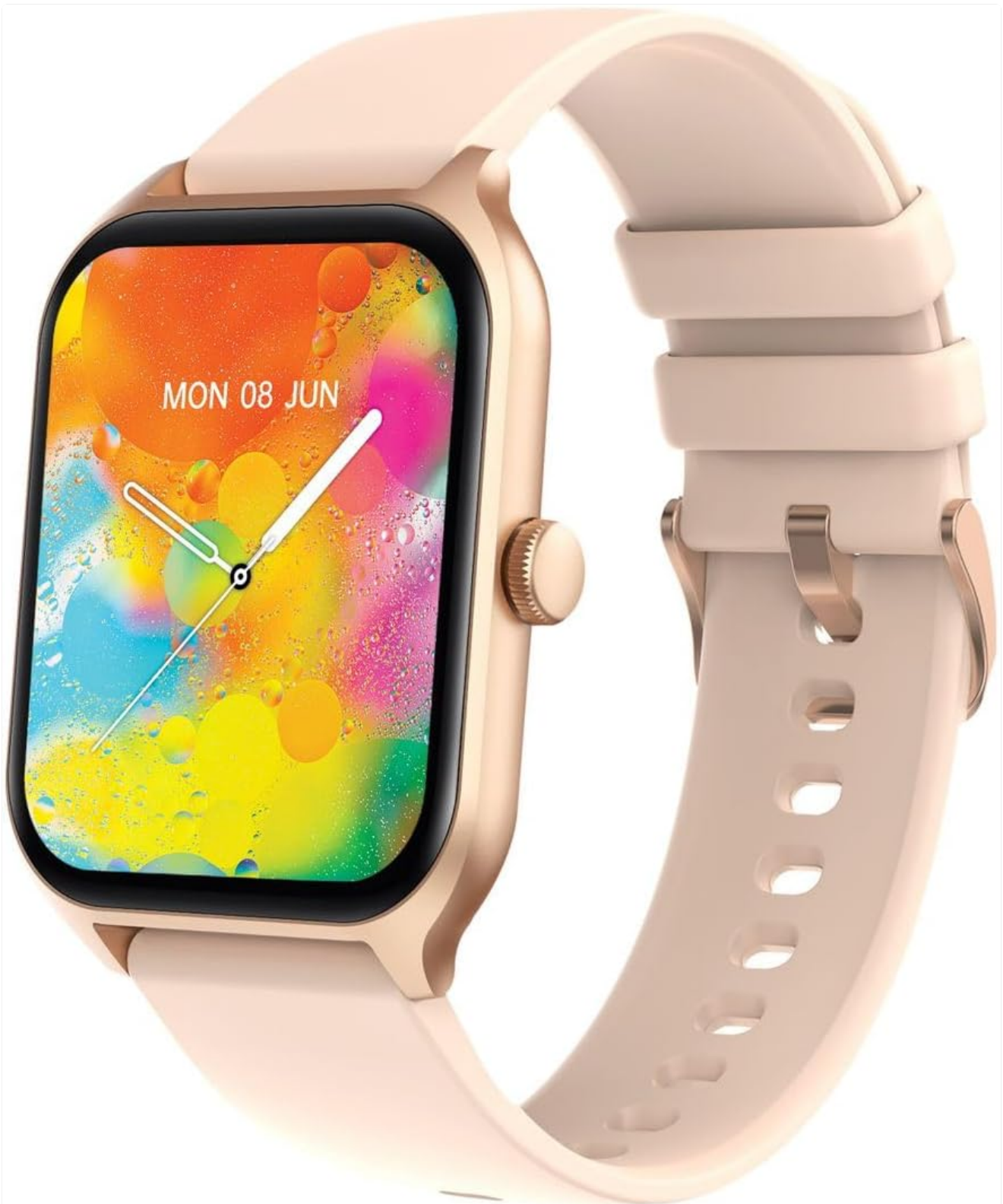
Figure 1.1: Volkano Fit Life Series Smart Watch (Gold)