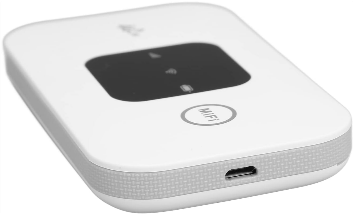
Image: A close-up of the circular "MiFi" button, likely used for power or status checks.