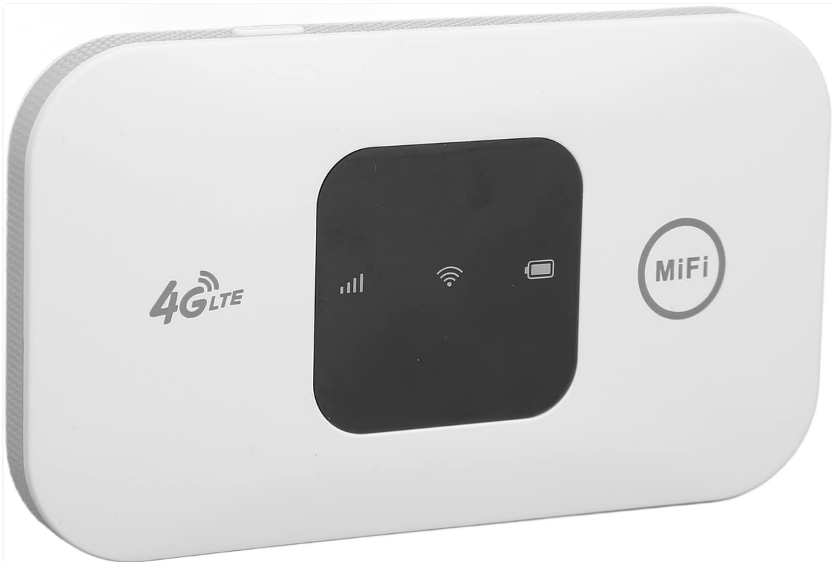
Image: Front view of the GOWENIC MF800-2 Mobile WiFi Hotspot, showing the 4G LTE branding, signal strength, Wi-Fi, and battery indicators, along with the MiFi button.

Take out the battery, tear off the insulation tape of the battery, insert the device and turn it on