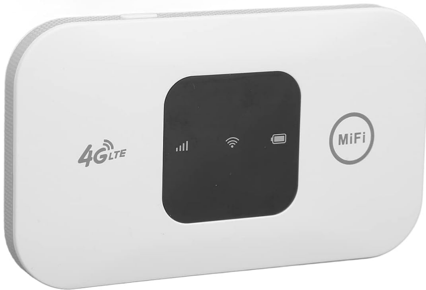
Image: The GOWENIC MF800-2 hotspot, illustrating its capability to provide 3G/4G high-speed internet access and support for up to 10 simultaneous users.

Provide 3G 4G high speed Internet access Support 10 users simultaneously