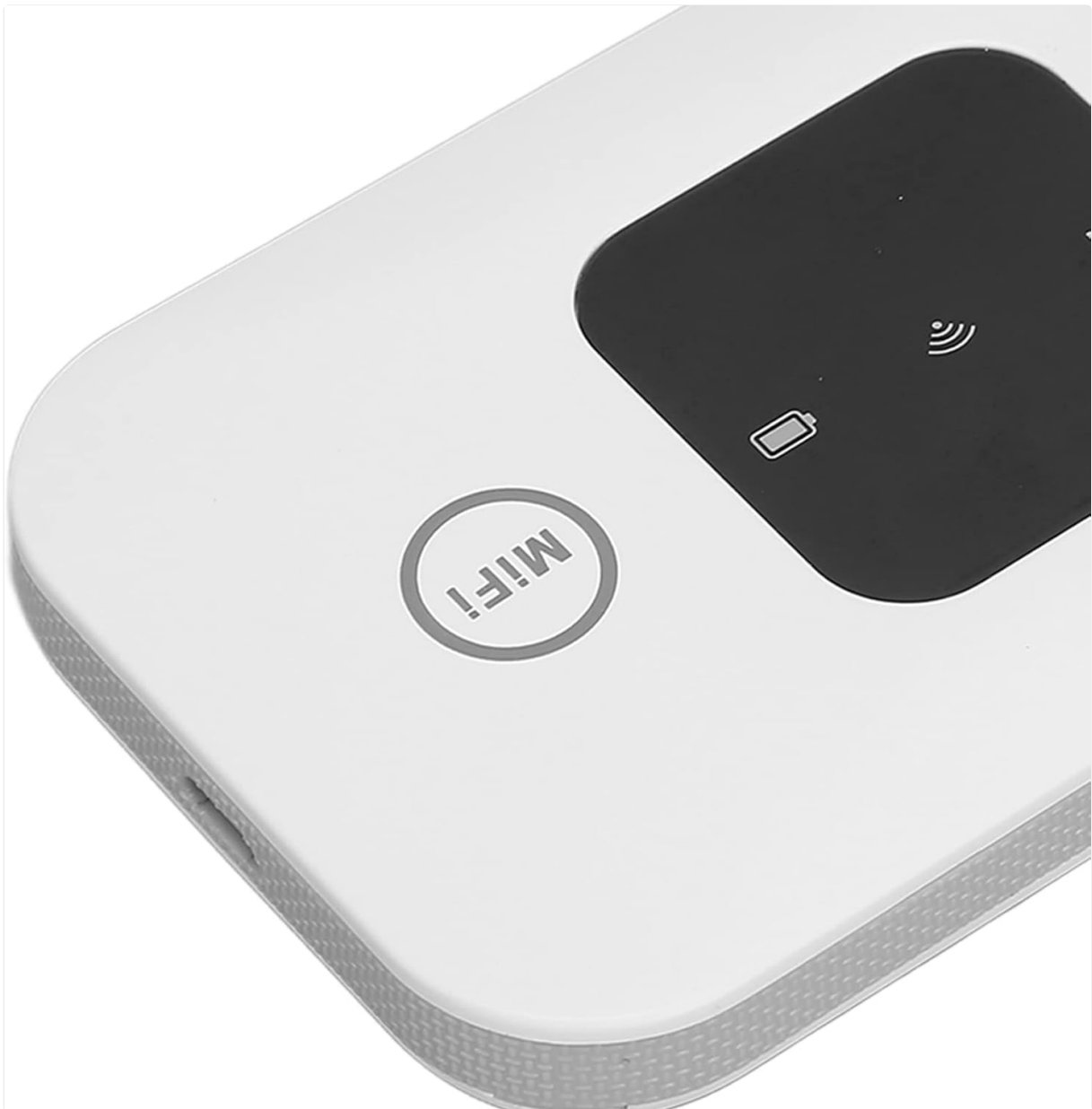
Image: The GOWENIC MF800-2 Mobile WiFi Hotspot, its removable battery, and the included USB charging cable.