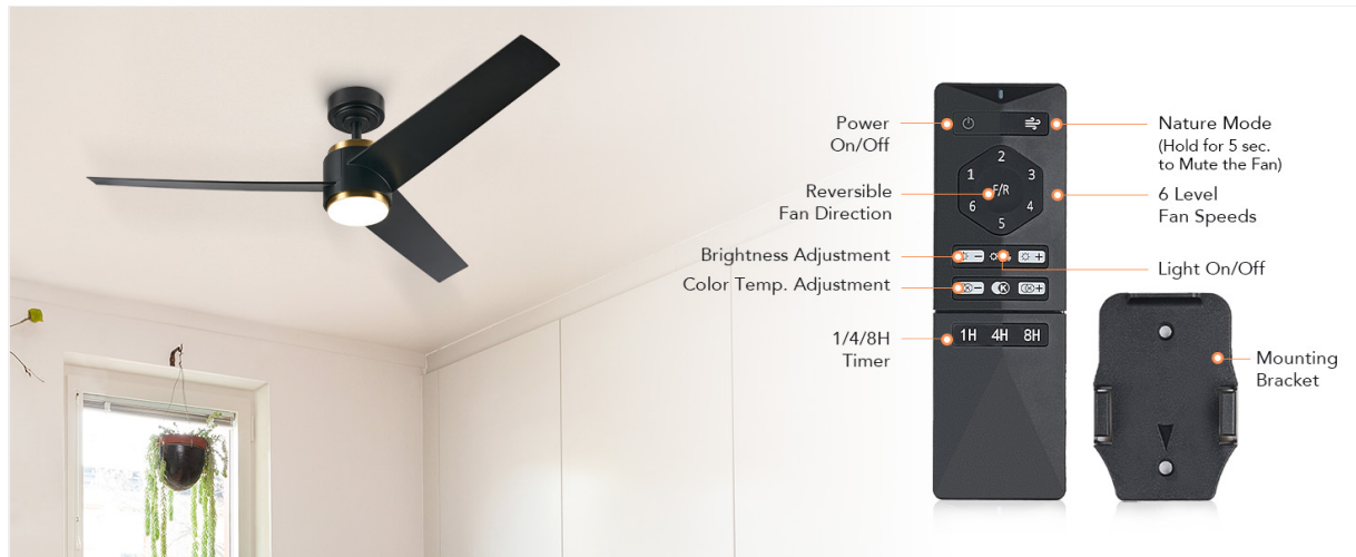
Image: Demonstrates the adjustable color temperature of the LED light, ranging from warm white (3000K) to cool white (6500K), with stepless brightness control.