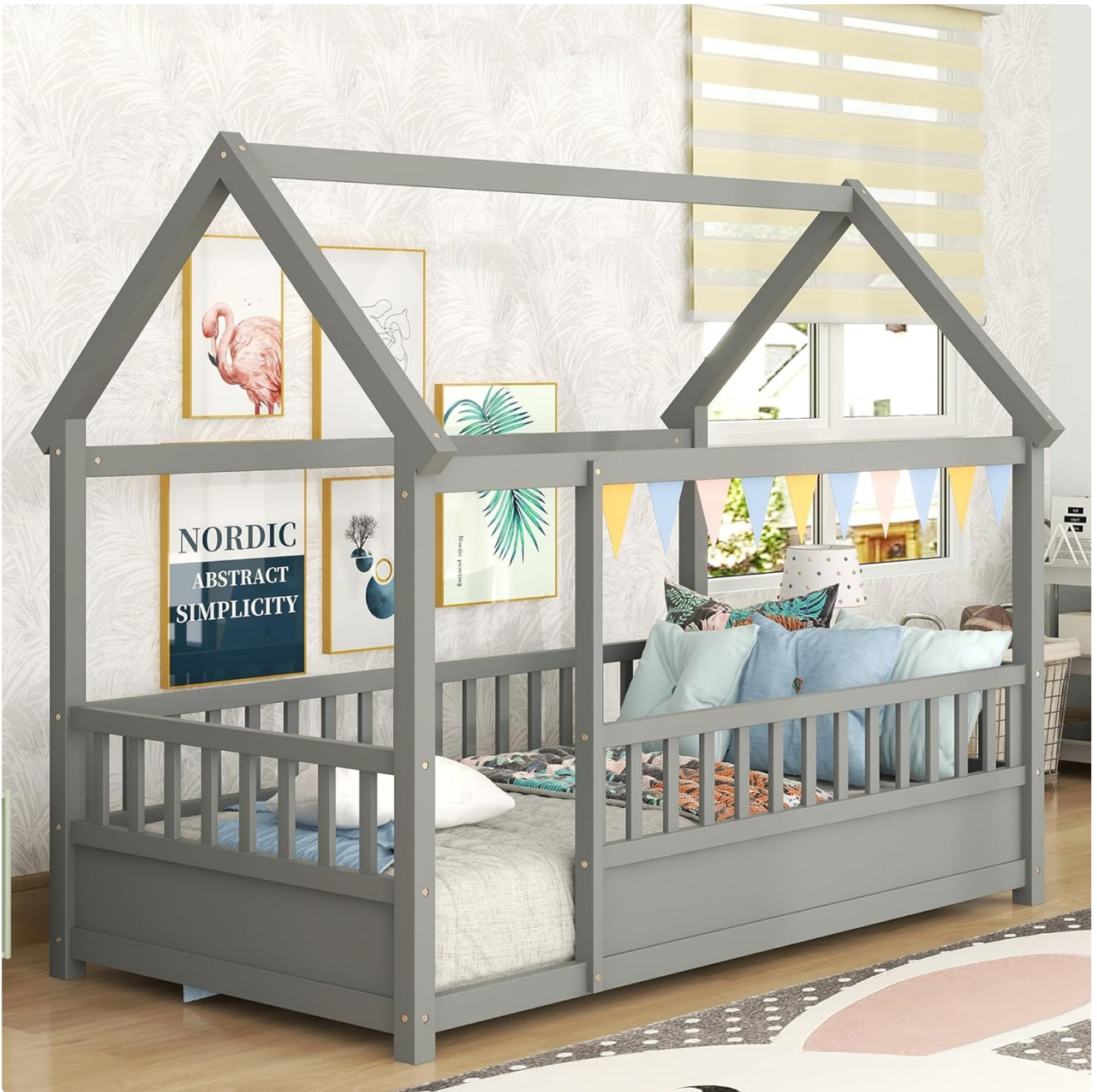
The Bellemave Twin Size Floor Bed provides a cozy and imaginative space for children.