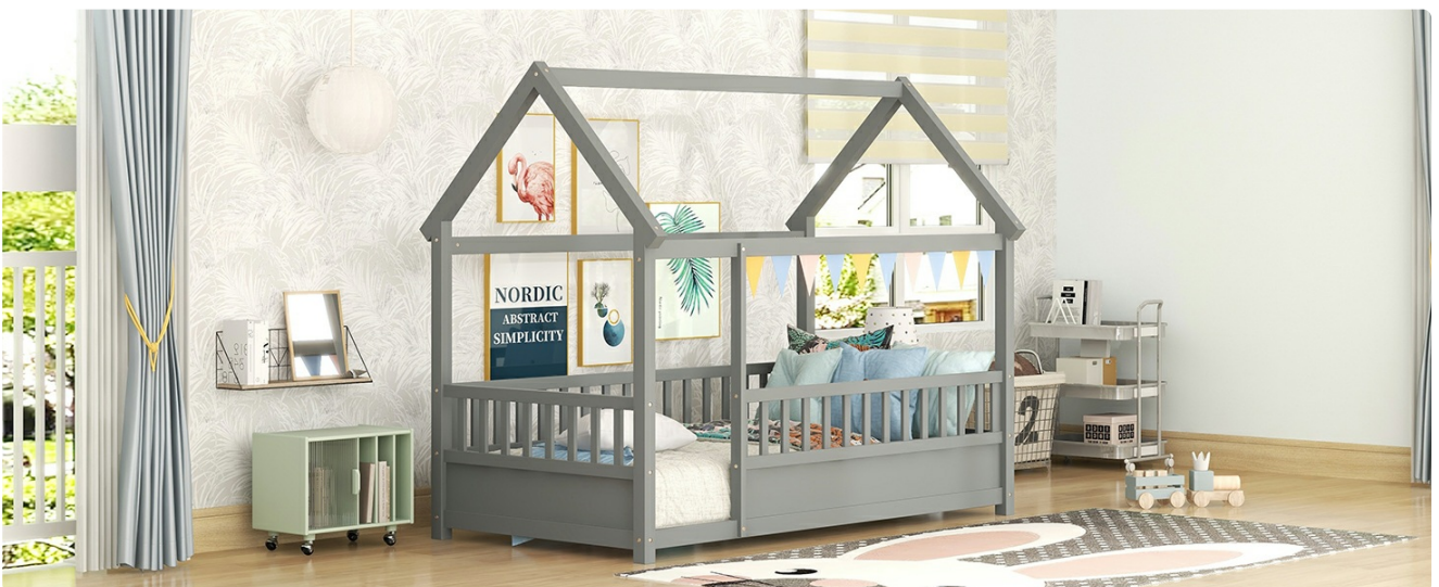
Encourage creativity by allowing children to customize their bed with various decorations.