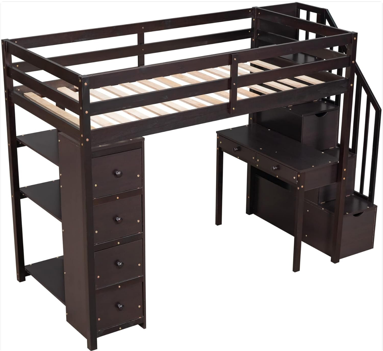
Image: An angled view of the loft bed, showing the desk and the stairs with their storage compartments.