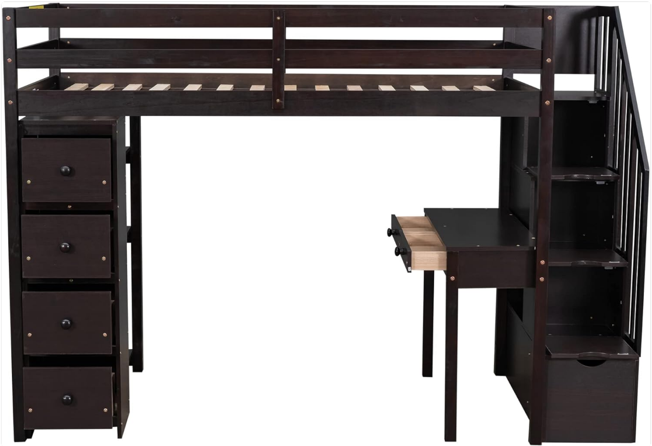
Image: A view of the loft bed showing the four storage drawers and the open shelving unit beneath the bed.