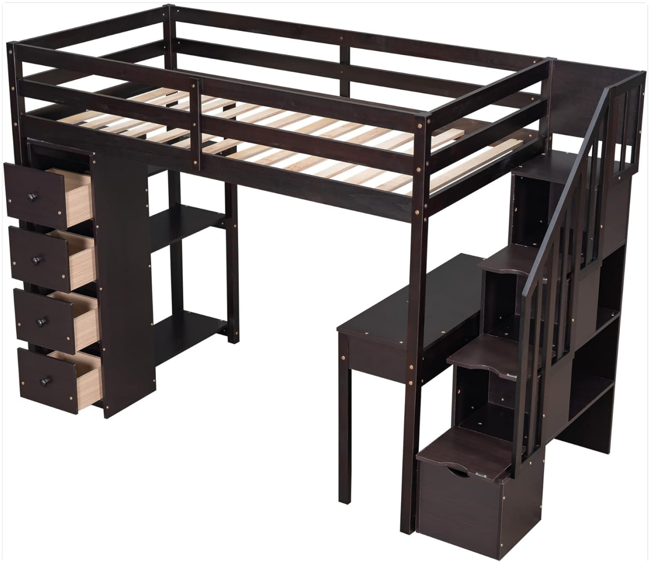
Image: A perspective view of the loft bed highlighting the integrated desk and the staircase with built-in storage.