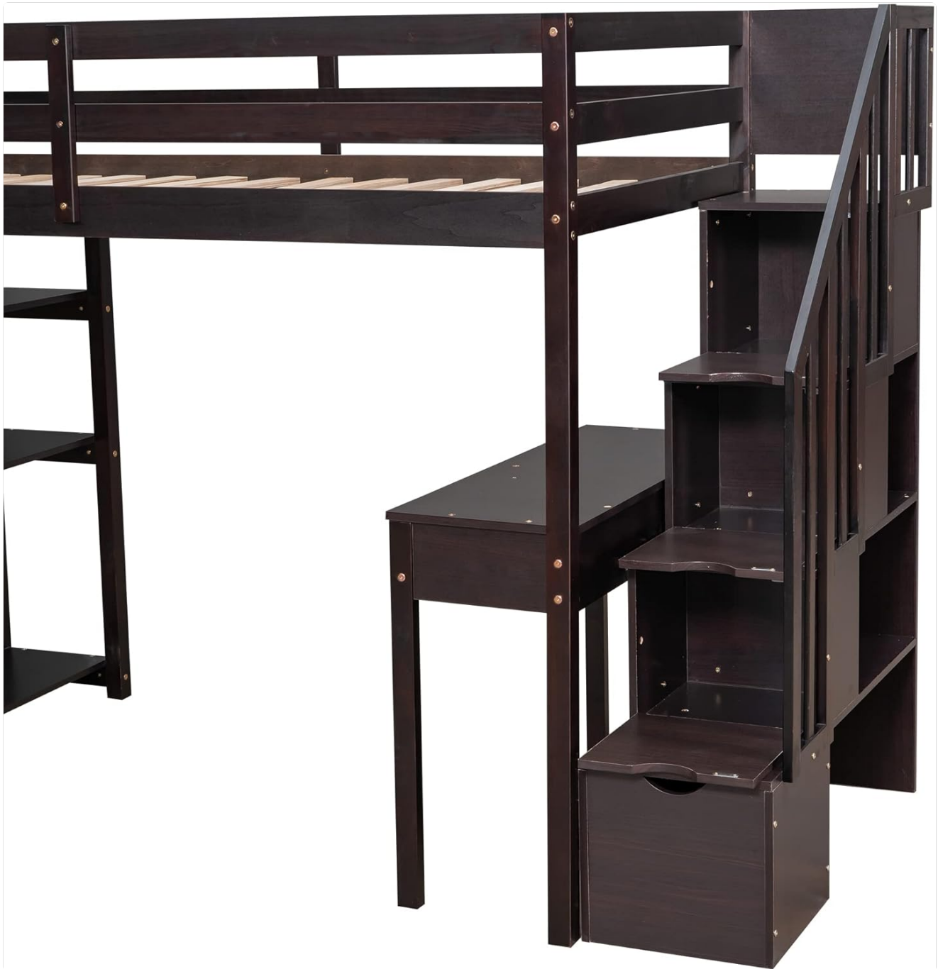
Image: The fully assembled loft bed with its desk, drawers, and stairs, shown in a bedroom setting.