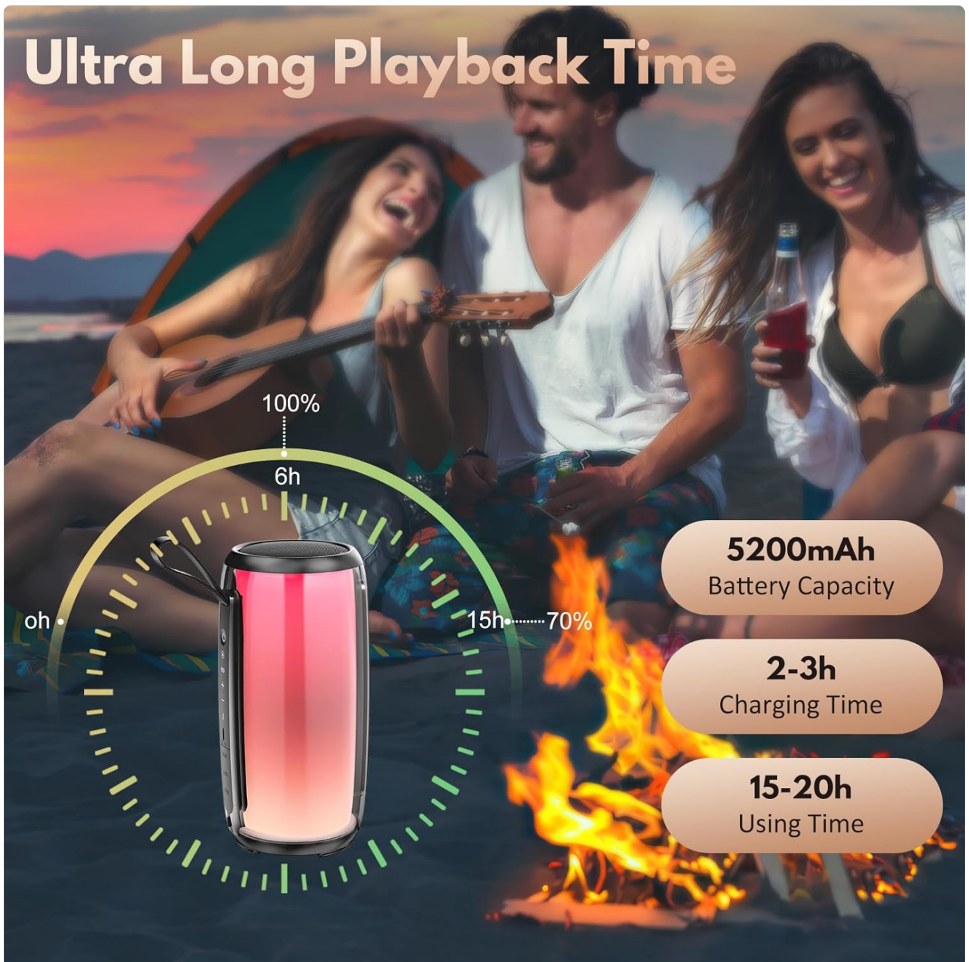
Image: Visual representation of the speaker's battery capacity, charging time, and usage duration.