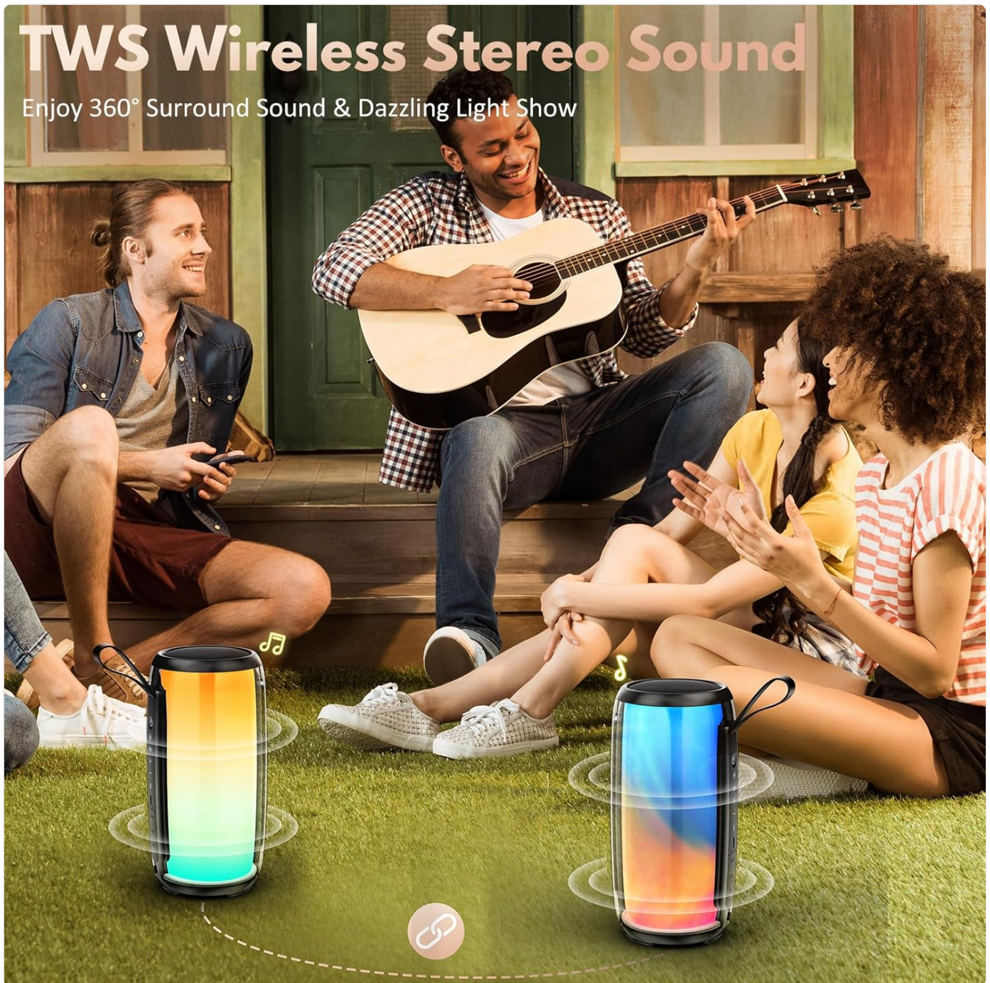
Image: Two JYX D21 speakers operating in TWS mode, enhancing the audio experience.