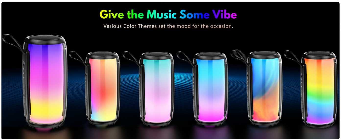
Image: A selection of the speaker's colorful light themes, demonstrating its visual capabilities.

The JYX D21 speaker features dynamic LED lighting with 26 different effects. Press the Light Mode button to cycle through the available light patterns. The lights can sync with the music rhythm.