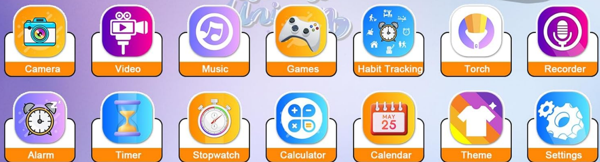
Image: The Luoba Kids Smart Phone interface showing multiple functions like camera, music, games, and utility apps.