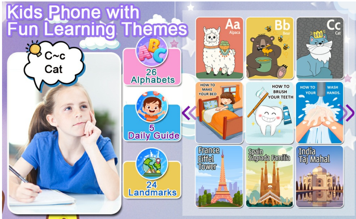
Image: The learning themes section, showcasing ABC learning, daily guides, and world landmarks, designed to make learning enjoyable.