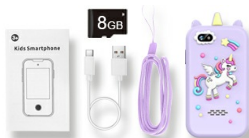
Image: An illustration showing the Luoba Kids Smart Phone, its silicone case, an 8GB SD card, a USB charging cable, and