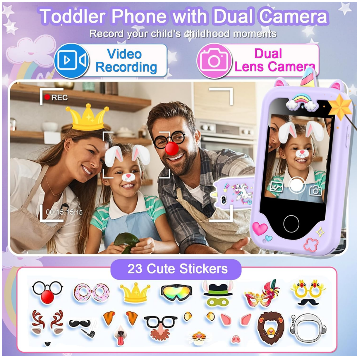
Image: The dual camera function of the smart phone, demonstrating how children can take photos and videos with fun stickers.