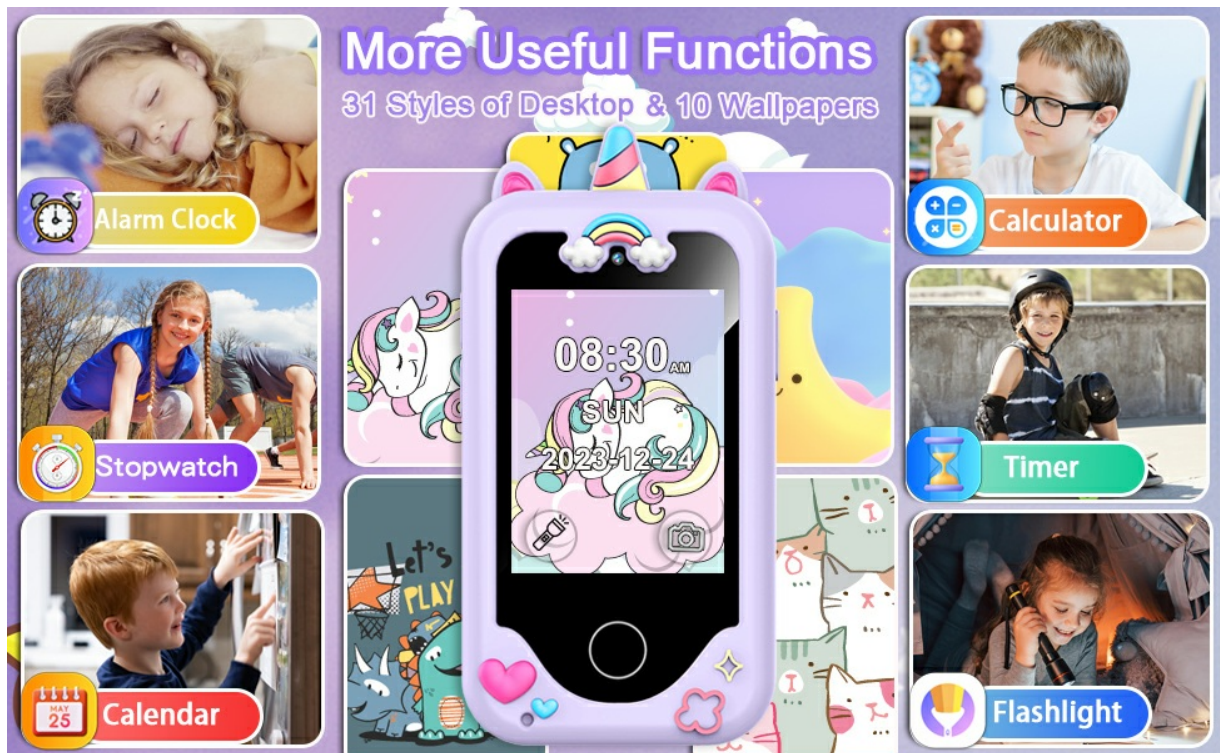
Image: A visual representation of the various useful functions available on the smart phone, including an alarm clock, calculator, timer, stopwatch, calendar, and flashlight.