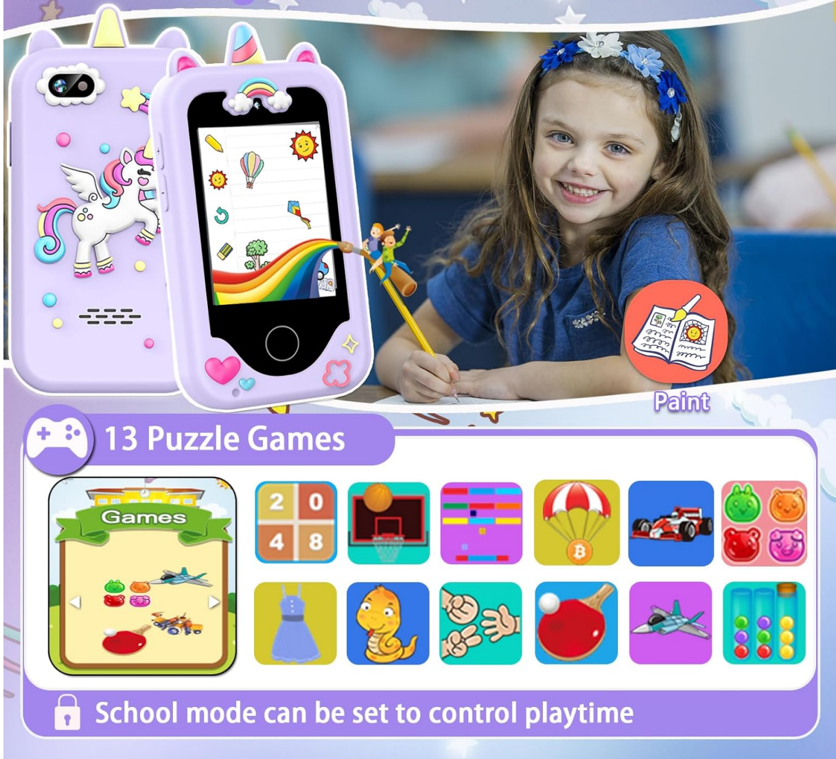
Image: The games section of the smart phone, illustrating various puzzle games available for children.