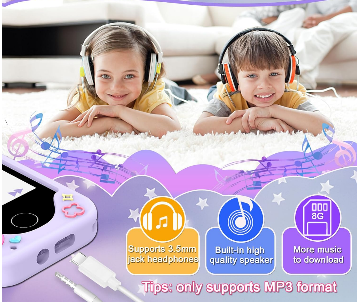
Image: The music player feature, showing children listening to music with headphones, and icons indicating 3.5mm jack support, built-in speaker, and 8GB card for more music.

Includes 8G SD card to download more child's favorite music