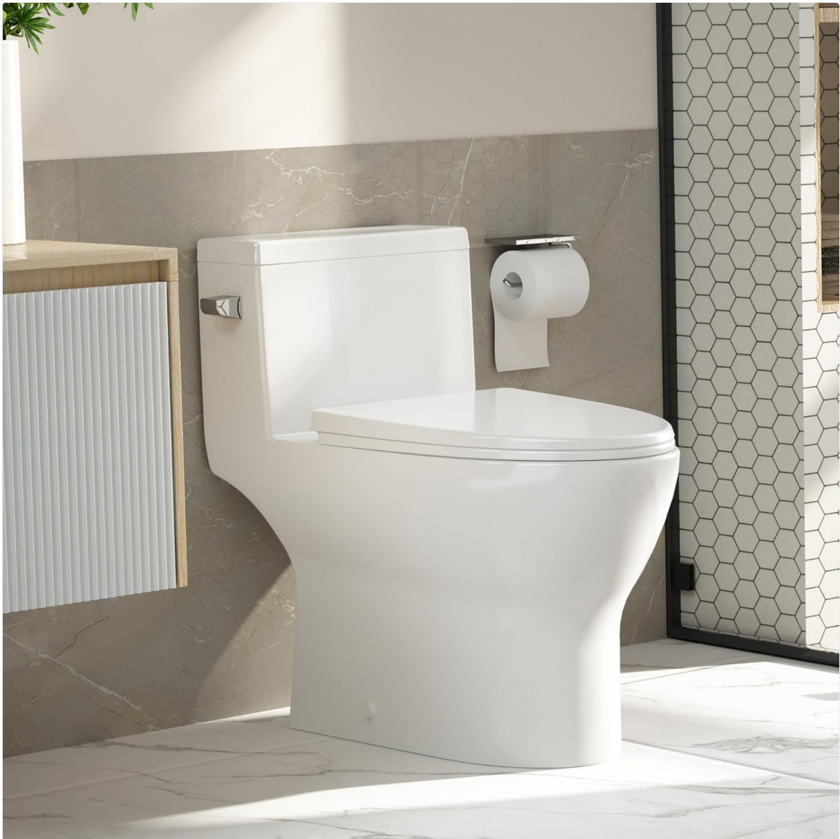
Image: The DeerValley DV-1F52626A One Piece Toilet, showcasing its sleek, modern design in a bathroom setting.