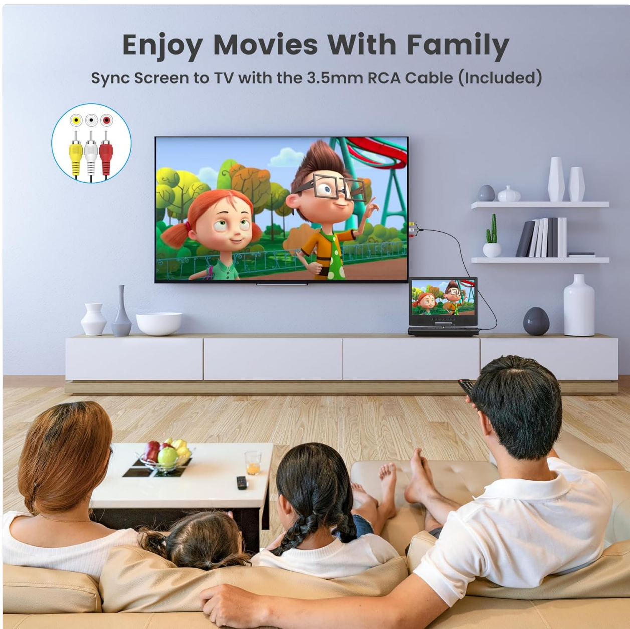
Image: A family watching a movie on a large television, with the portable DVD player connected via RCA cable, demonstrating the sync screen to TV feature.