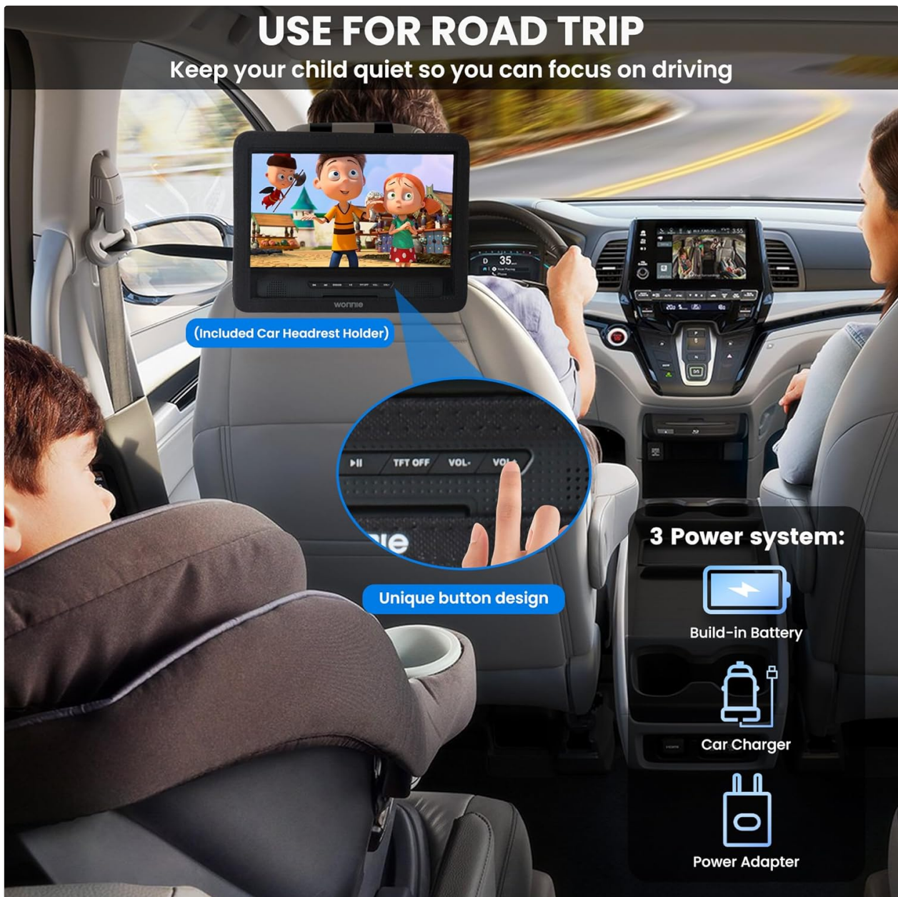
Image: The portable DVD player installed on a car headrest, demonstrating its use for entertaining passengers during road trips, with an inset showing the unique button design.