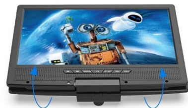
Image: Demonstrates the 270-degree rotation and 180-degree flip capability of the screen for optimal viewing comfort.