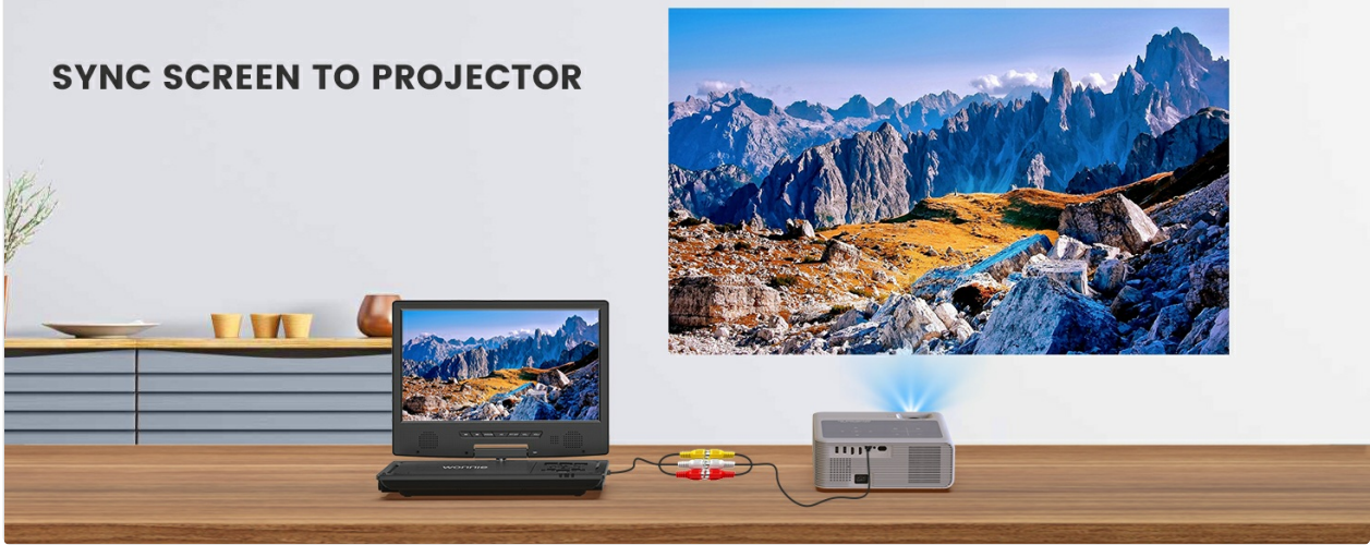
Image: The portable DVD player connected to a projector via RCA cables, displaying a scenic mountain view on a large screen.