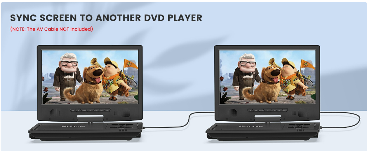
Image: Two portable DVD players side-by-side, connected by a cable, showing the same movie on both screens, illustrating the sync screen to another DVD player feature.