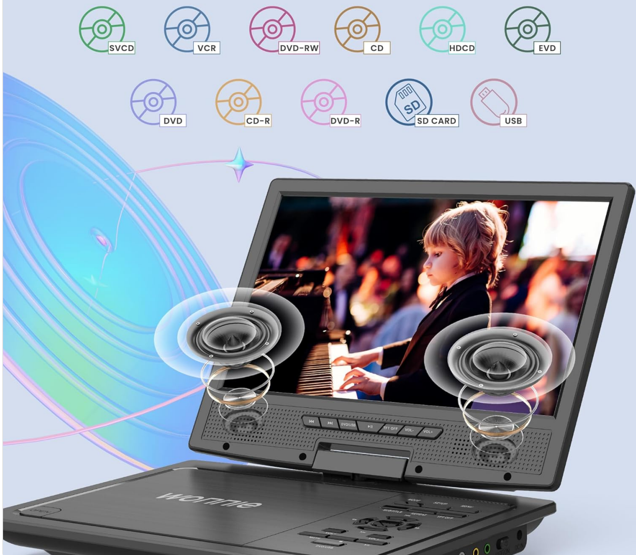
Image: Visual representation of the various disc formats (SVCD, VCR, DVD-RW, CD, HDCD, EVD, DVD, CD-R, DVD-R) and digital media (SD card, USB) supported by the player.