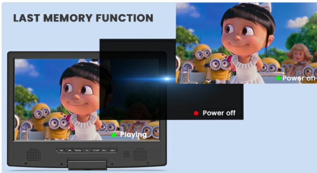
Image: Shows the player resuming a video from the exact point it was turned off, demonstrating the last memory function.