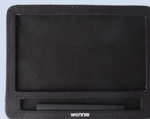
Car Headrest Mount Holder

Image: The packing list showing the DVD player, car headrest holder, remote control, AC power adaptor, car charger, and user manual.