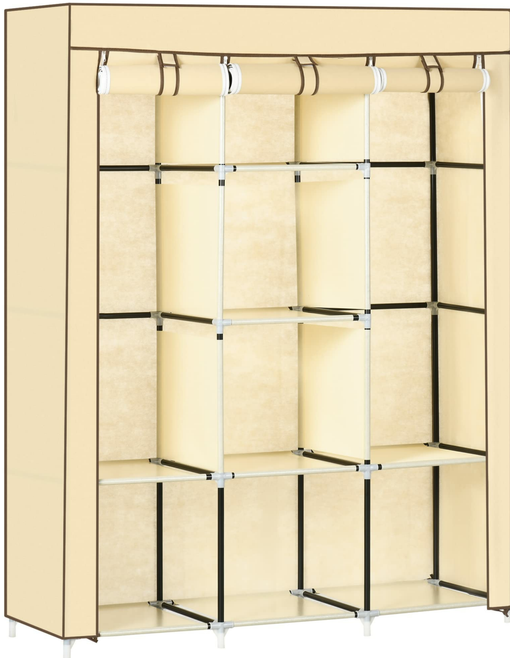
Image: The HOMCOM Fabric Wardrobe in beige, showcasing its full design and functionality.