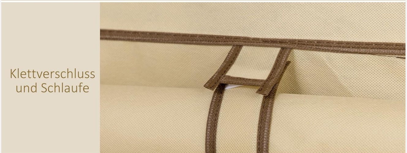
Klettverschluss und Schlaufe

Image: Close-up of the fabric cover's zipper for easy opening and closing, and the velcro strap for securing the rolled-up door.