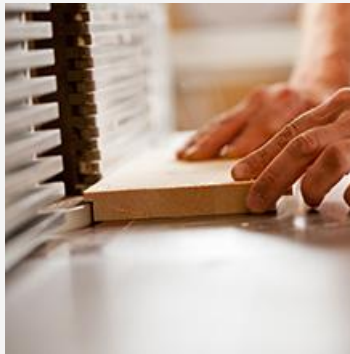
Image: Another example of a labeled component.