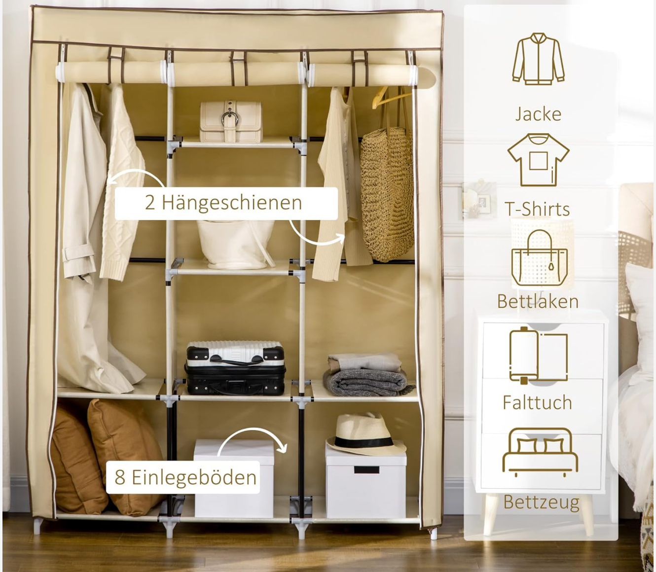
Image: Internal view of the fabric wardrobe, highlighting the two hanging rods and eight shelf levels for organized storage.