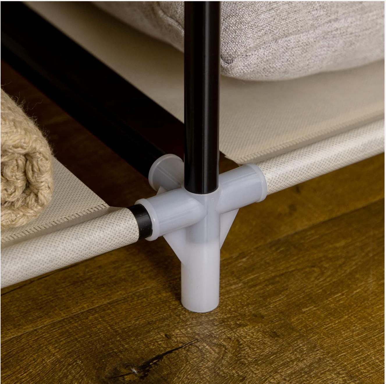
Image: Close-up of a plastic connector and metal rod, illustrating how components fit together.

Connect the shortest metal rods to the plastic connectors to form the base rectangle. Ensure all rods are fully inserted into the connectors for stability.