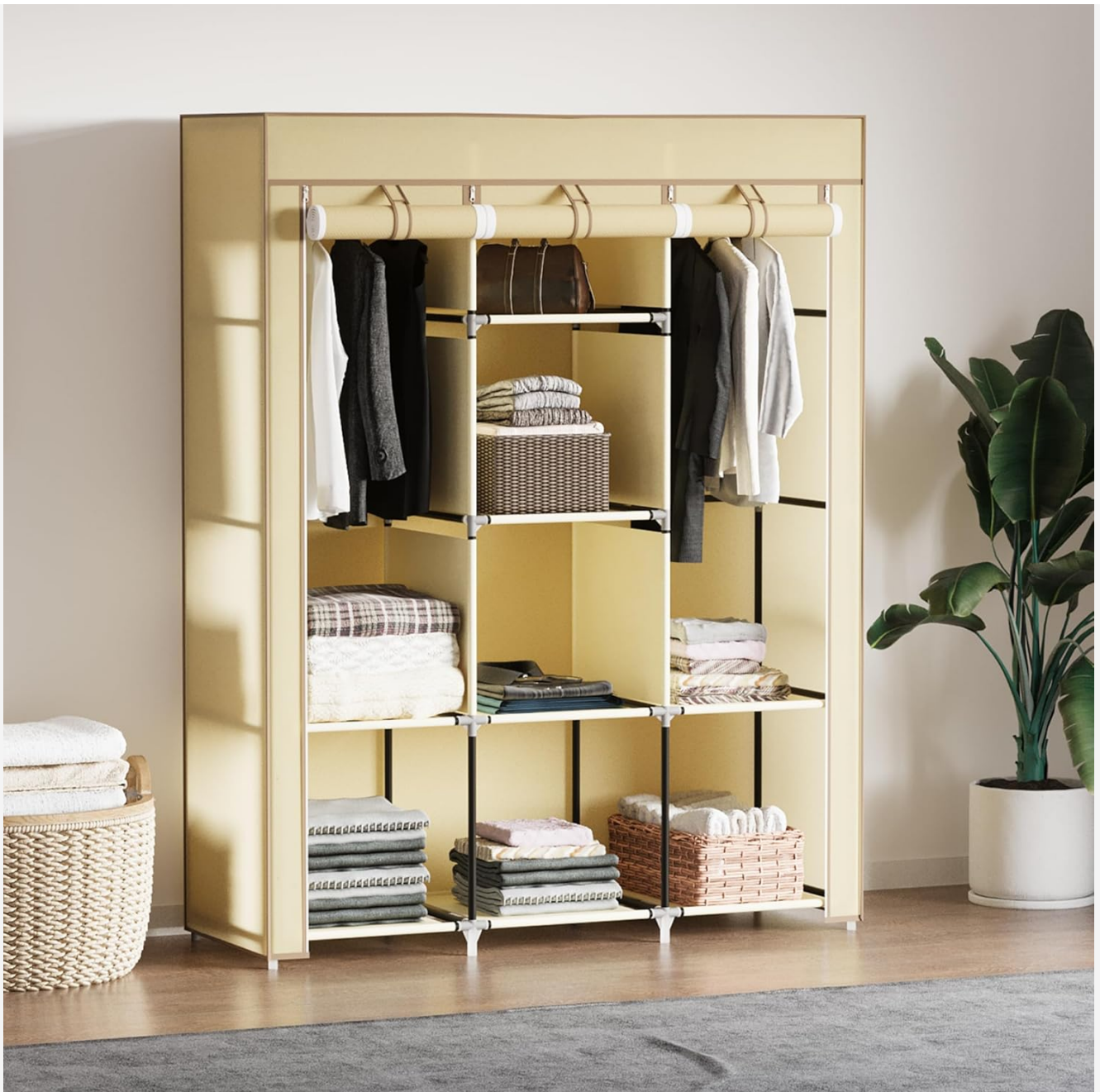
Image: The HOMCOM Fabric Wardrobe fully assembled and organized with various clothing items and storage baskets.