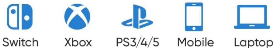
Figure 5: The portable monitor supports connection to multiple devices.