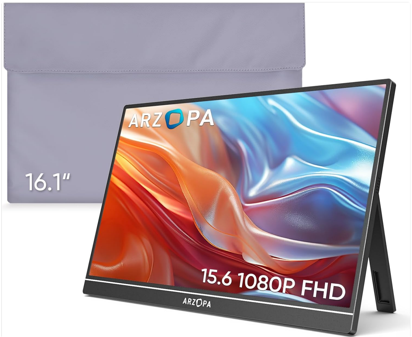
Figure 1: ARZOPA Portable Monitor with its protective PU sleeve.