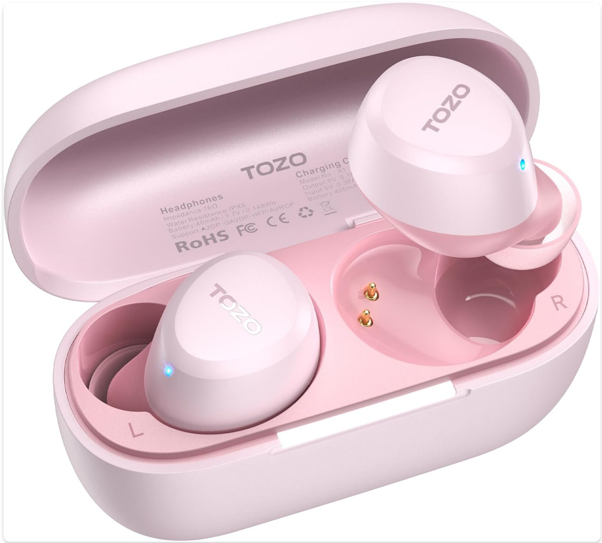
The TOZO A1 Rose Gold Wireless Earbuds in their charging case.