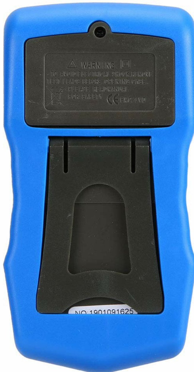
Figure 5.1: Rear view of the multimeter, indicating the battery compartment.