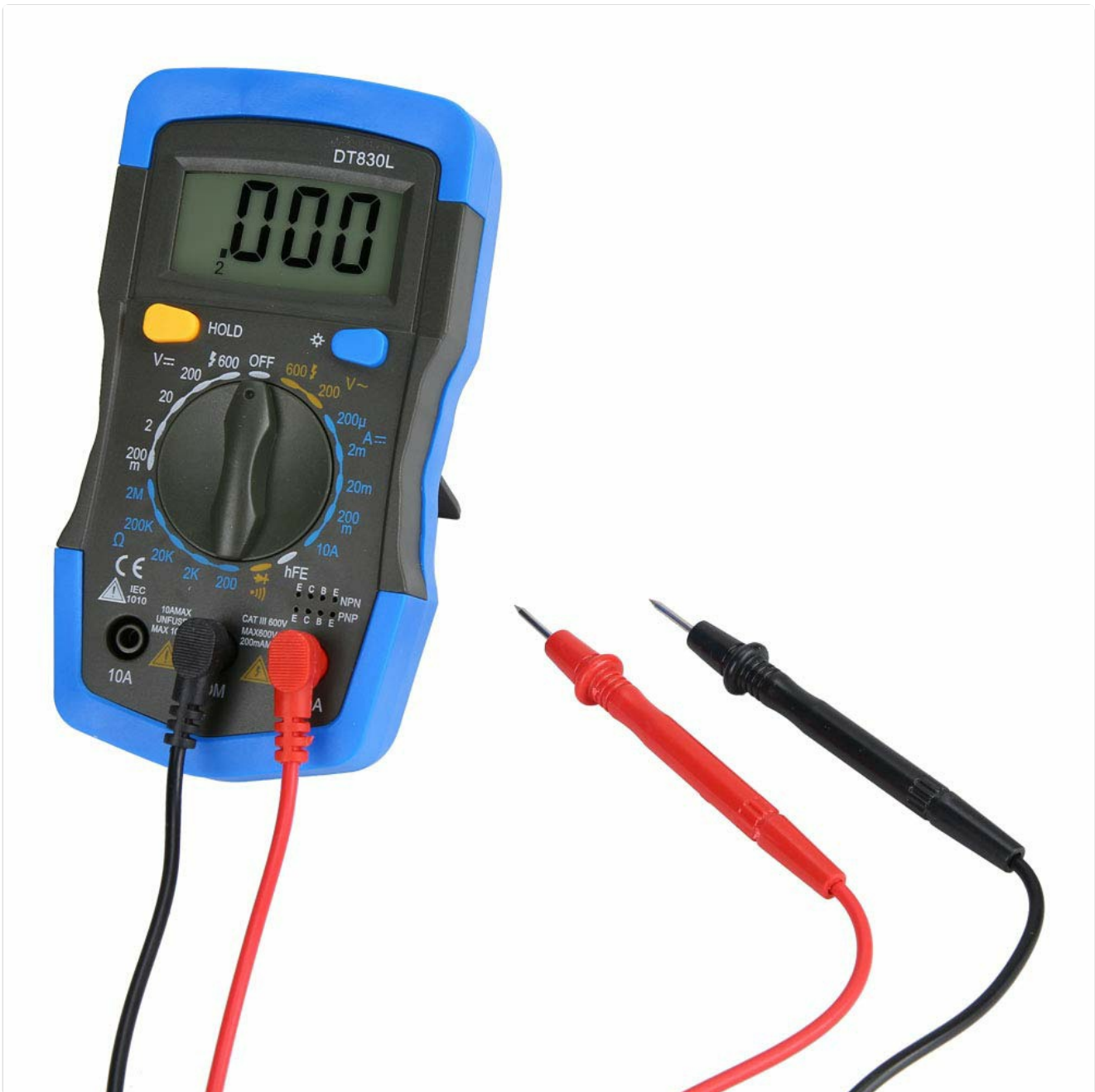
Figure 3.1: Airshi DT830L Multimeter with red and black test leads connected.