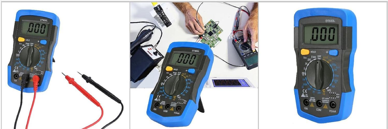
Figure 6.1: The Airshi DT830L Multimeter in use, demonstrating its application in electronic testing.