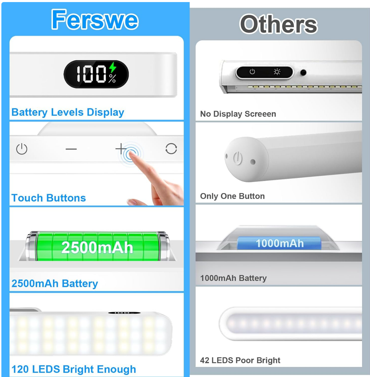
Figure 2.1: Overview of Ferswe Light Bar features including battery display and touch controls.