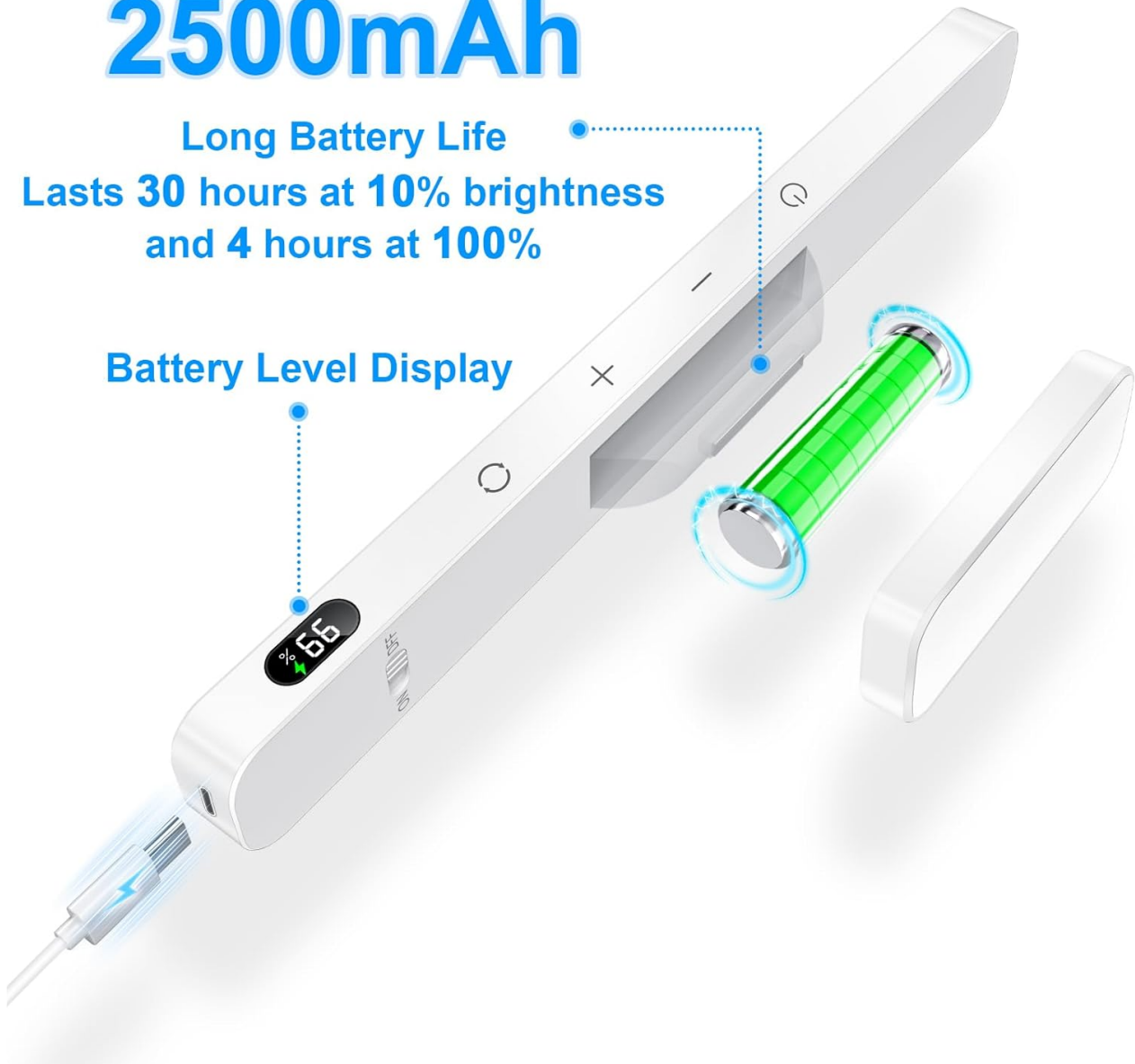
Figure 6.1: Charging the light bar and monitoring battery levels.

Your browser does not support the video tag. Please update your browser.