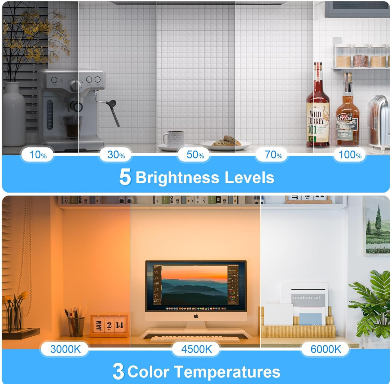
Figure 5.1: Brightness and color temperature adjustments.

Your browser does not support the video tag. Please update your browser.