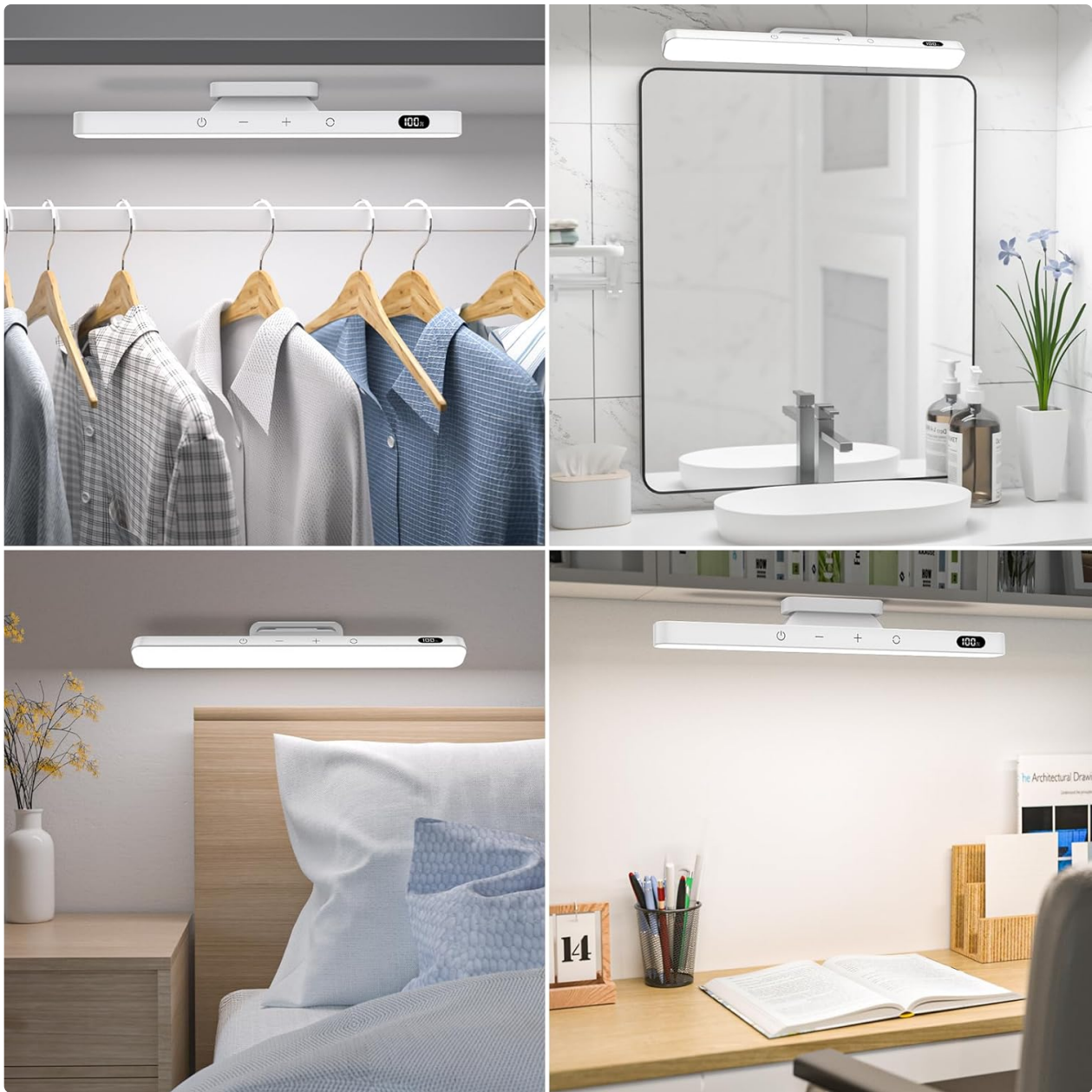
Figure 4.2: Versatile placement options for the Ferswe light bar.