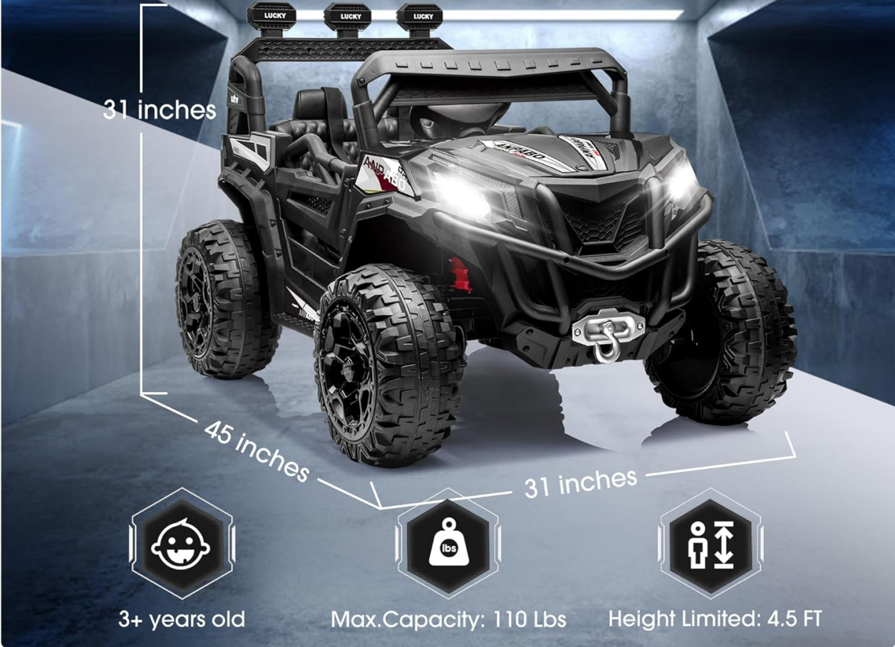
Figure 7: Product dimensions and capacity details.