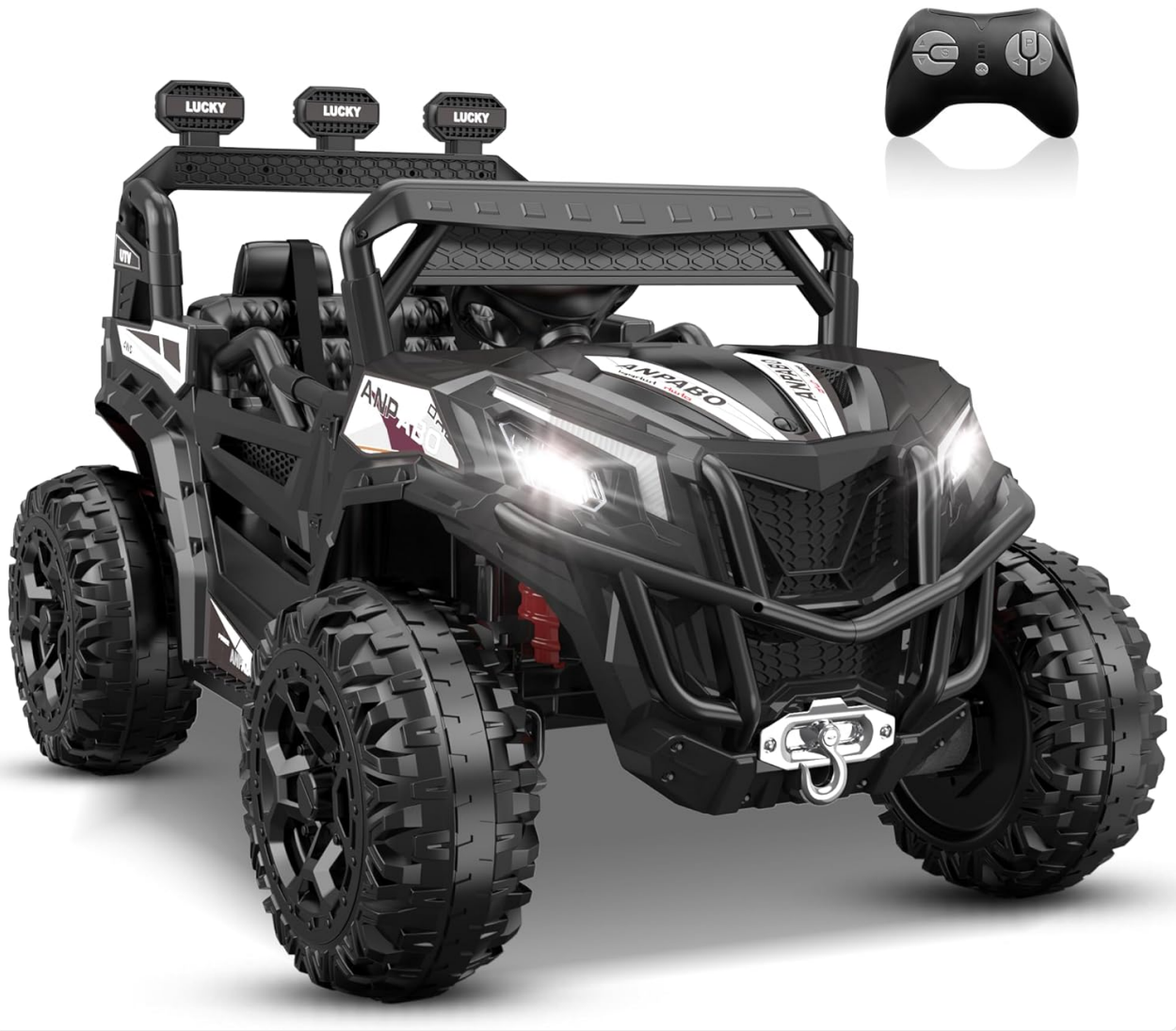
Figure 2: Fully assembled ANPABO 24V Ride-On UTV.