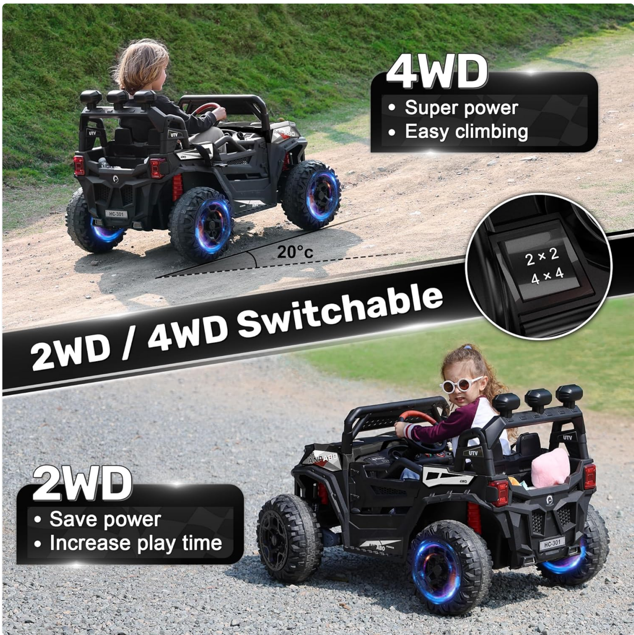
Figure 5: 4WD/2WD switchable feature for varied terrains.