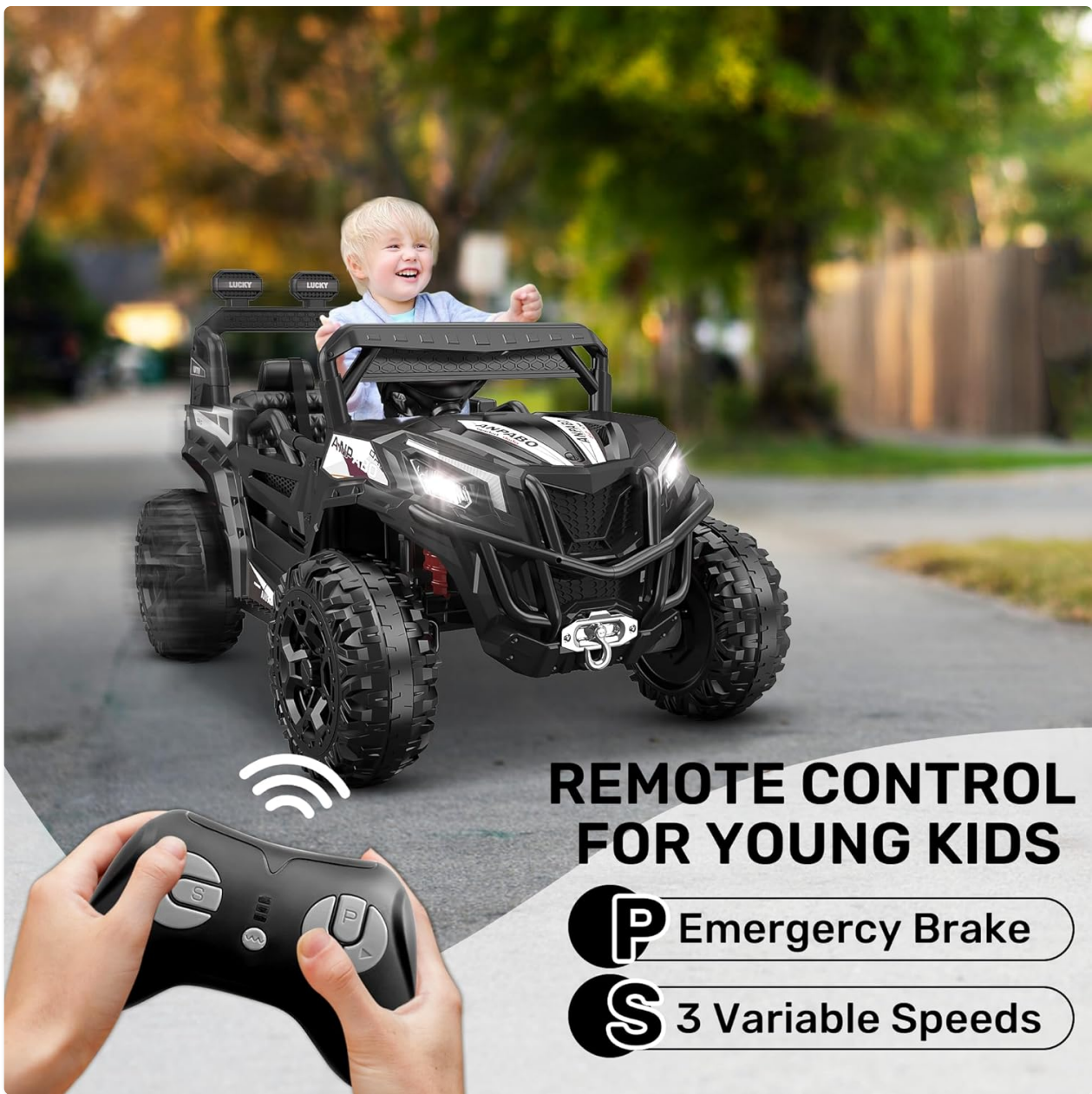
Figure 4: Remote control operation for parental supervision.