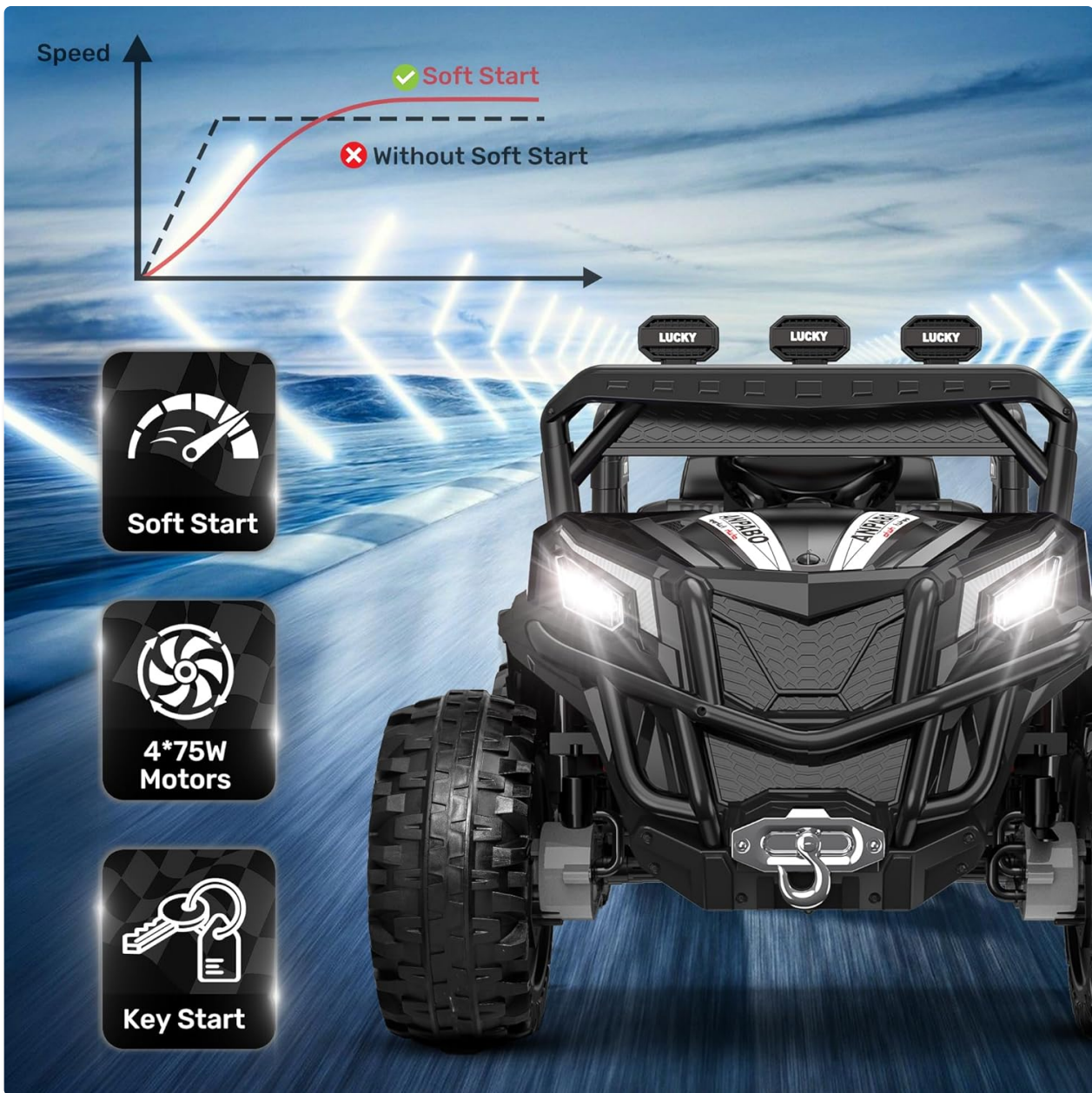
Figure 3: Key start and dashboard controls.