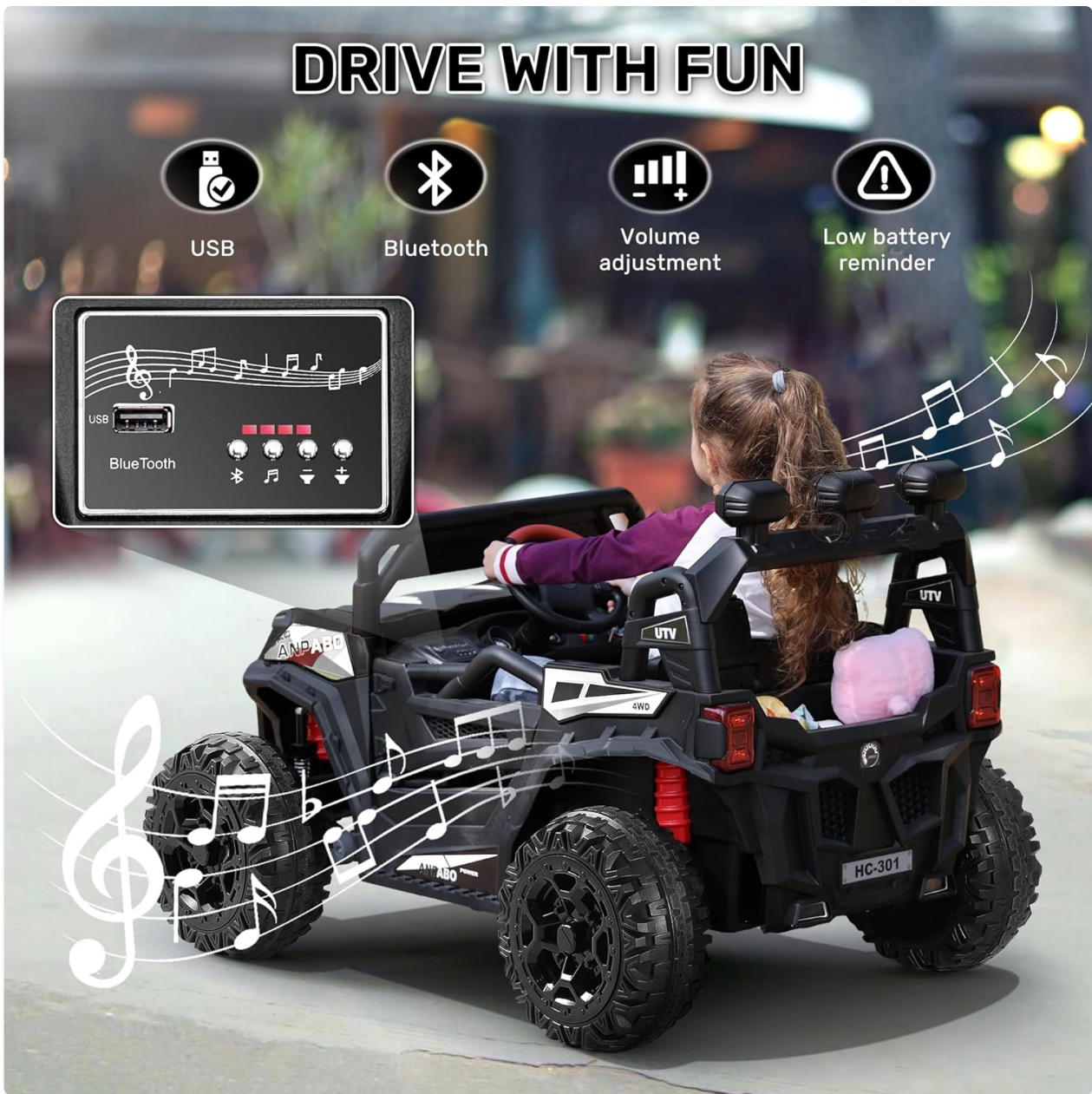
Figure 6: Dashboard with music player, Bluetooth, and USB port.

Your browser does not support the video tag.