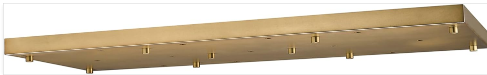
Image: Angled view of the Z-Lite CP4217L-RB 17-Light Rectangular Ceiling Plate in Rubbed Brass finish, showing its overall design.