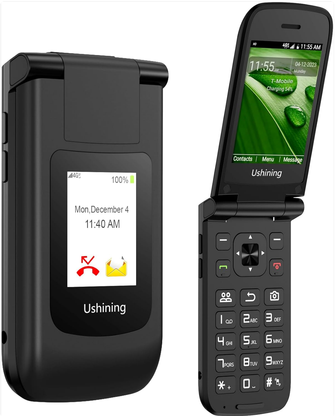
Figure 1: USHINING 4G Unlocked Flip Phone (Closed and Open)