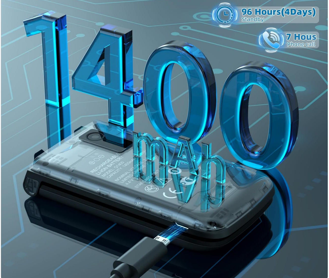
Figure 10: Battery Life Overview