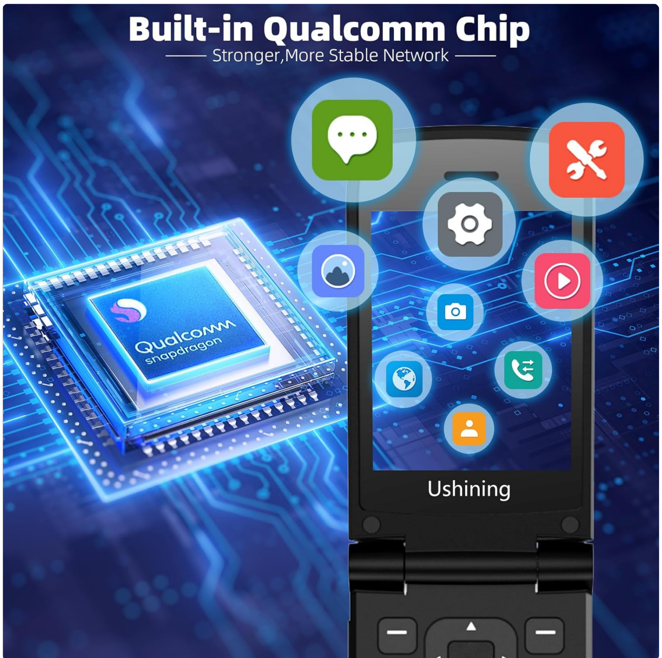
Figure 9: Qualcomm Chip for Stable Network Connectivity