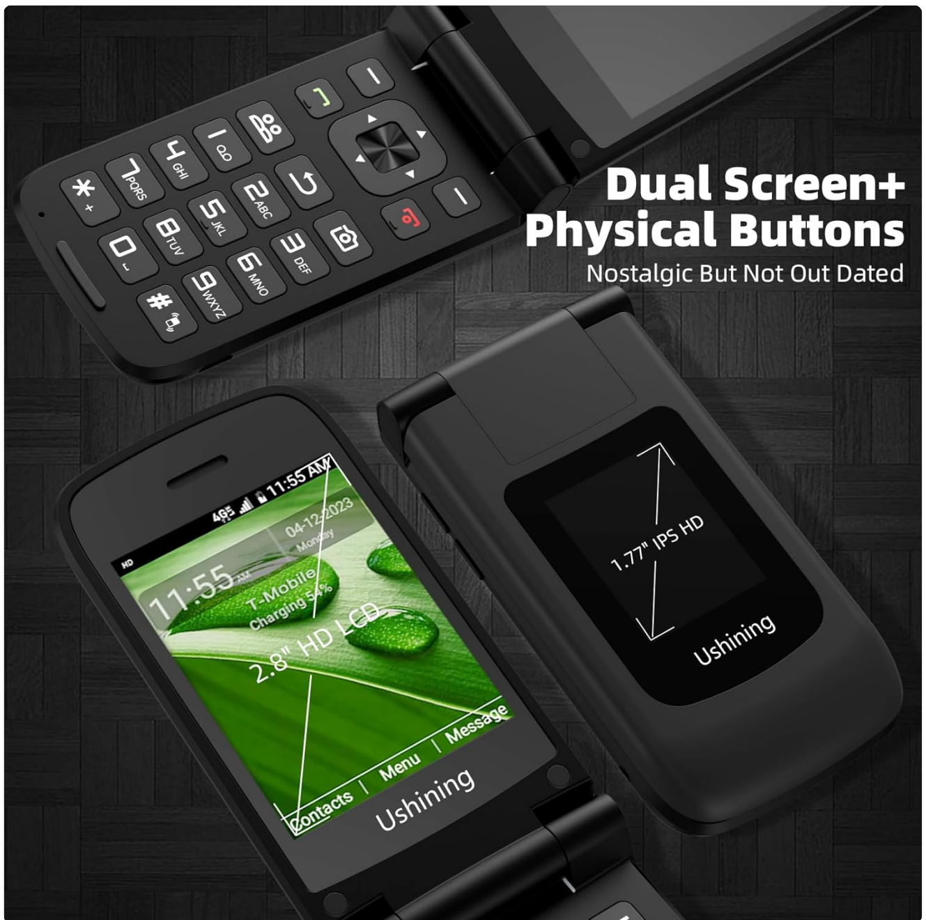
Figure 6: Dual Screens and Physical Buttons