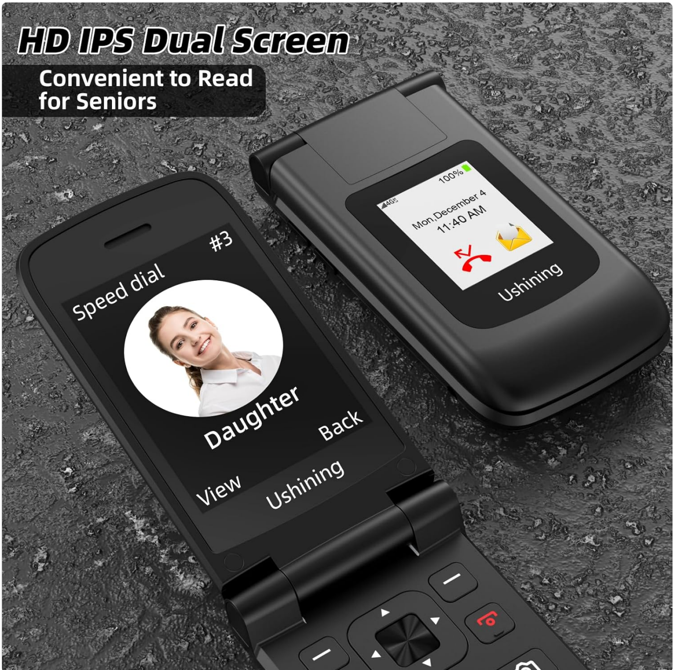
Figure 4: Speed Dial Feature