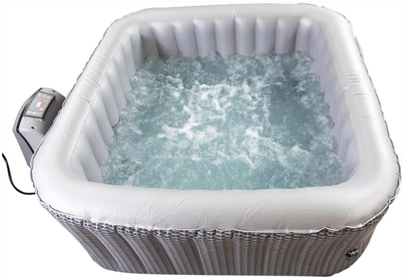
Figure 5.2: The spa with active massage jets creating bubbles.