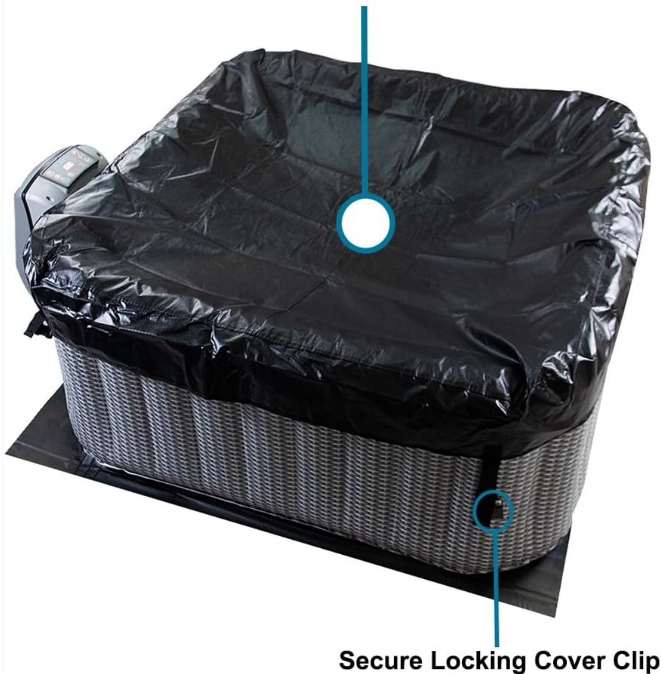
Figure 6.1: The spa covered with its all-weather resistant cover.