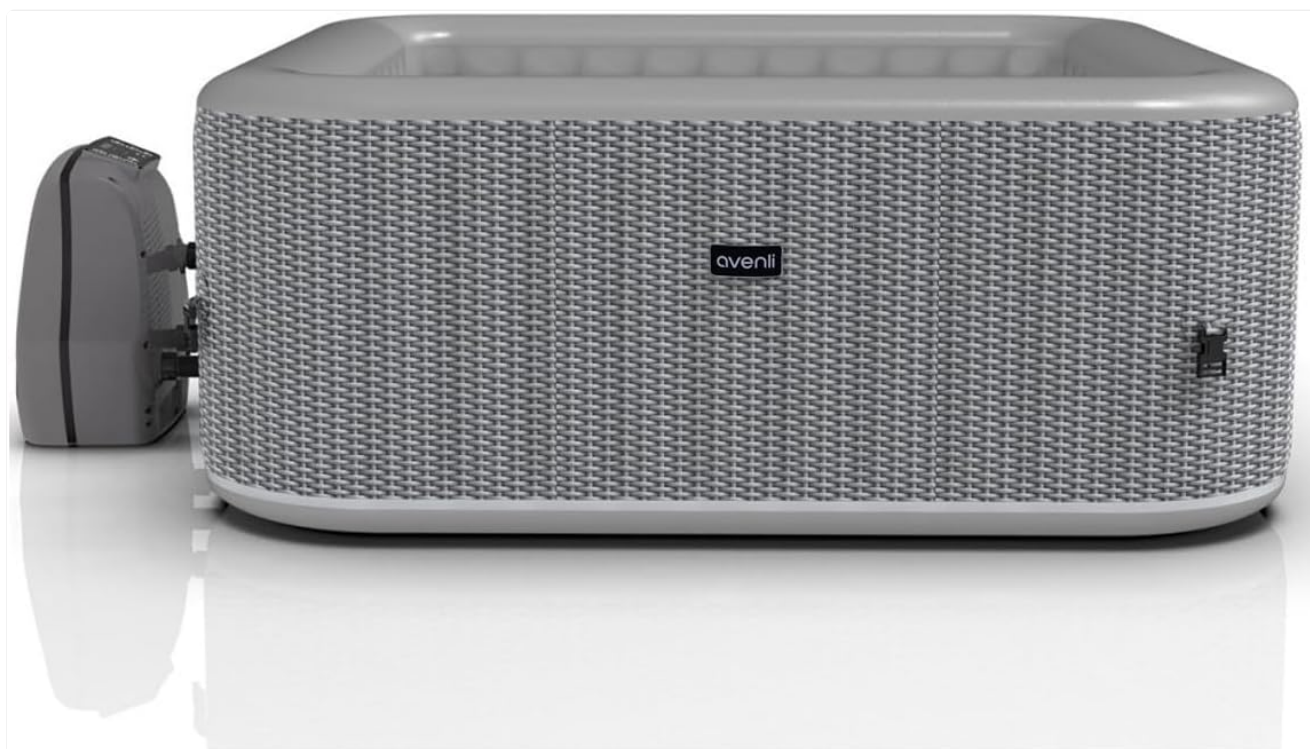
Figure 4.1: The Avenli Inflatable Square Spa fully inflated with the pump unit connected.