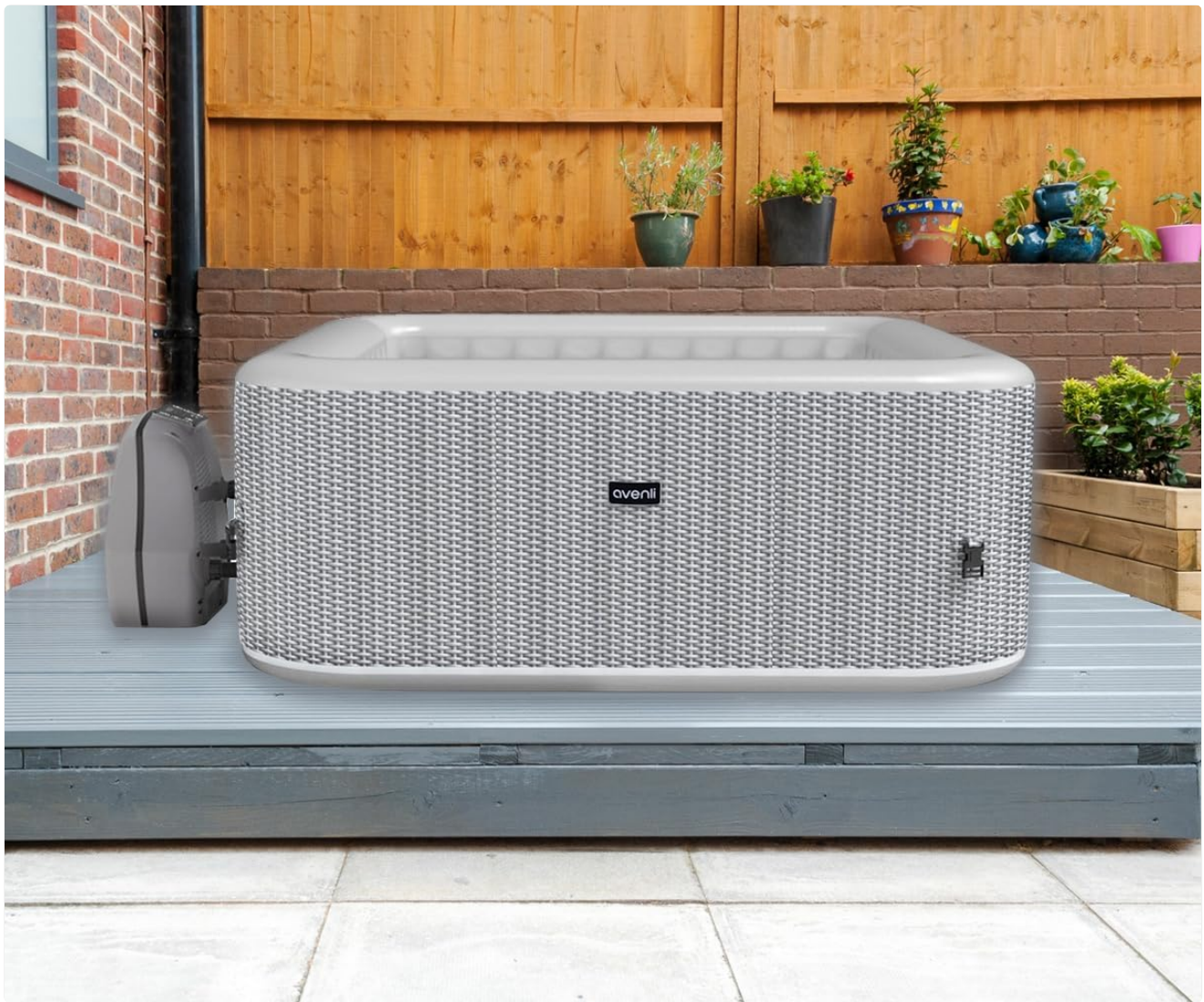
Figure 1.1: The Avenli Inflatable Square Spa in an outdoor setting.