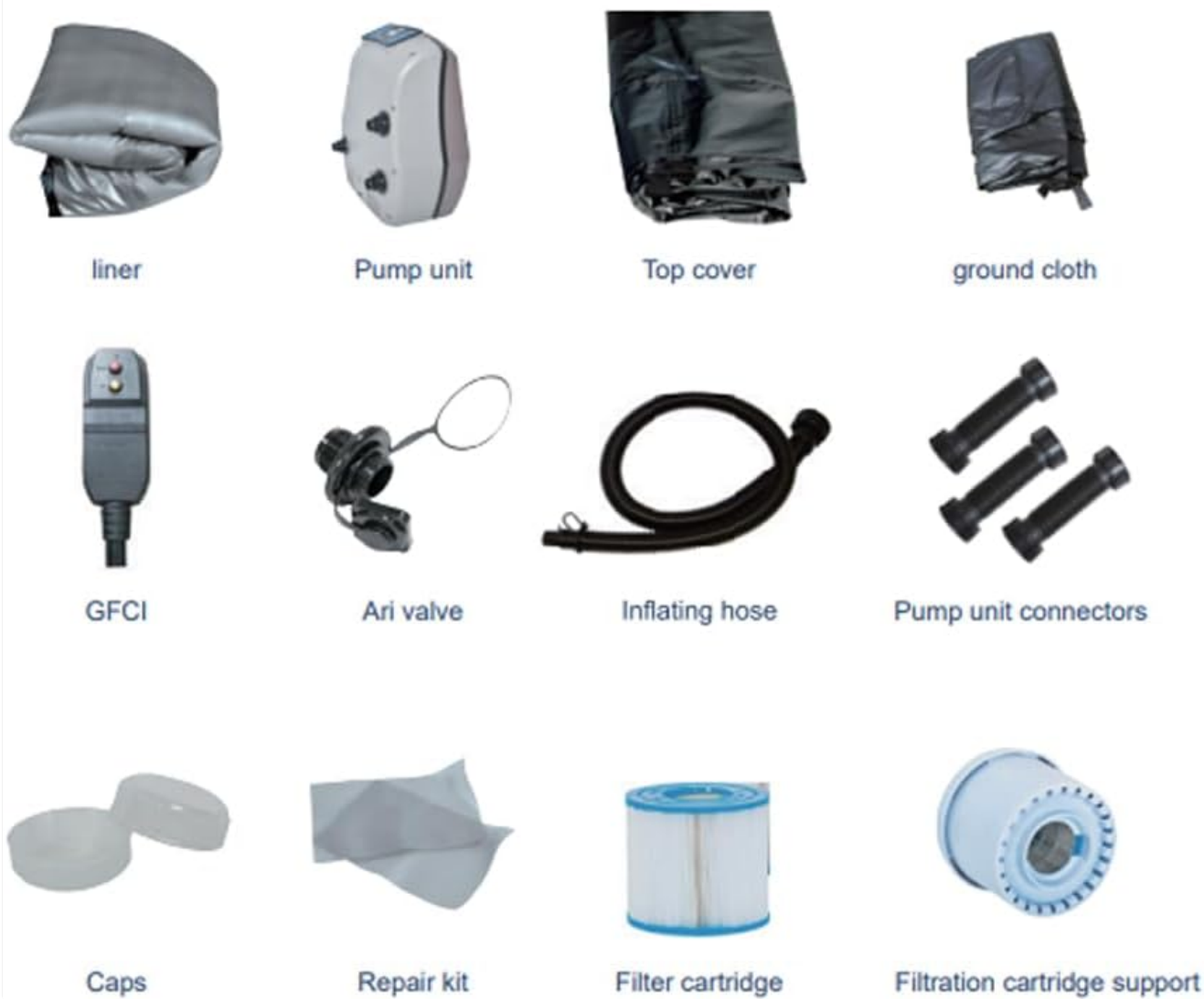
Figure 3.1: All included components for the Avenli Inflatable Square Spa.