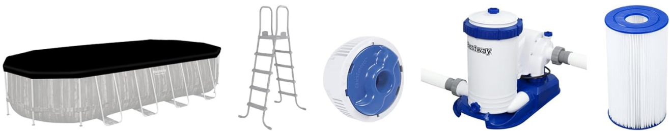
Image: Overview of all included components in the Bestway Power Steel Oval Pool Set.