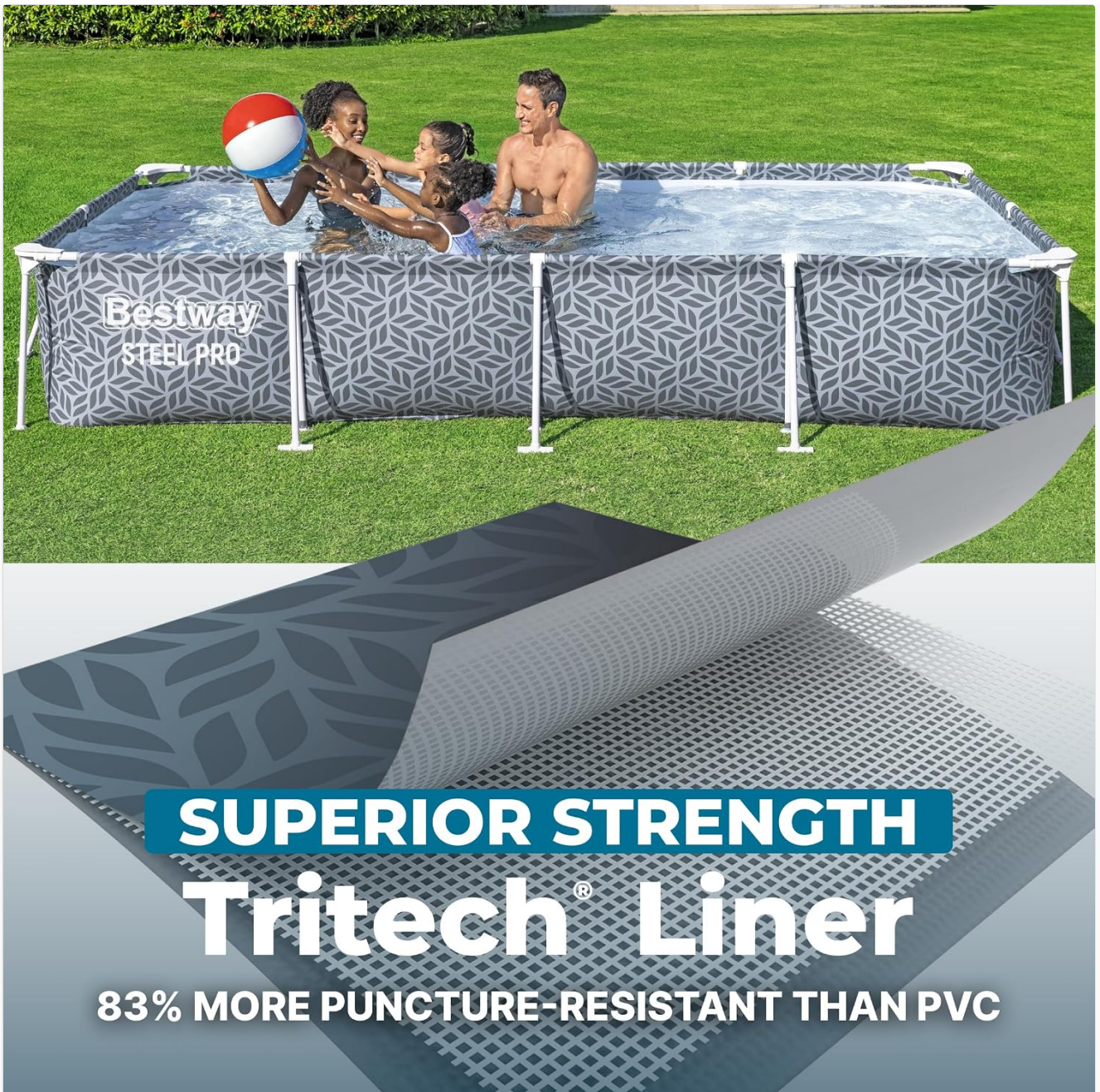
Figure 1.3: Tritech Liner Construction for Enhanced Durability.