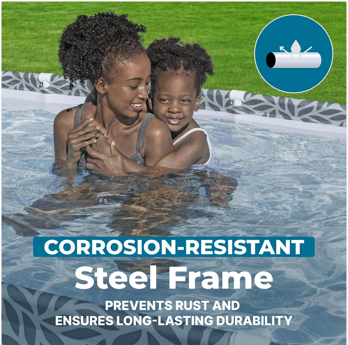
Figure 3.4: Corrosion-Resistant Steel Frame.