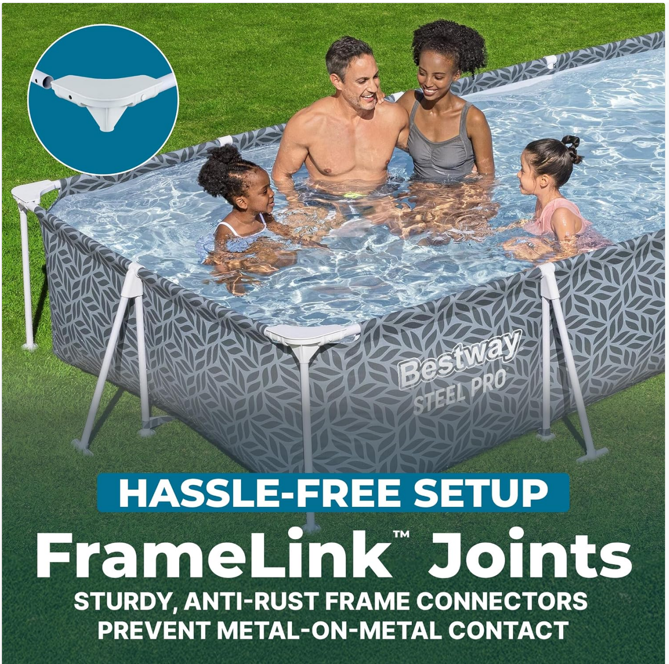
Figure 3.3: FrameLink System Joints.