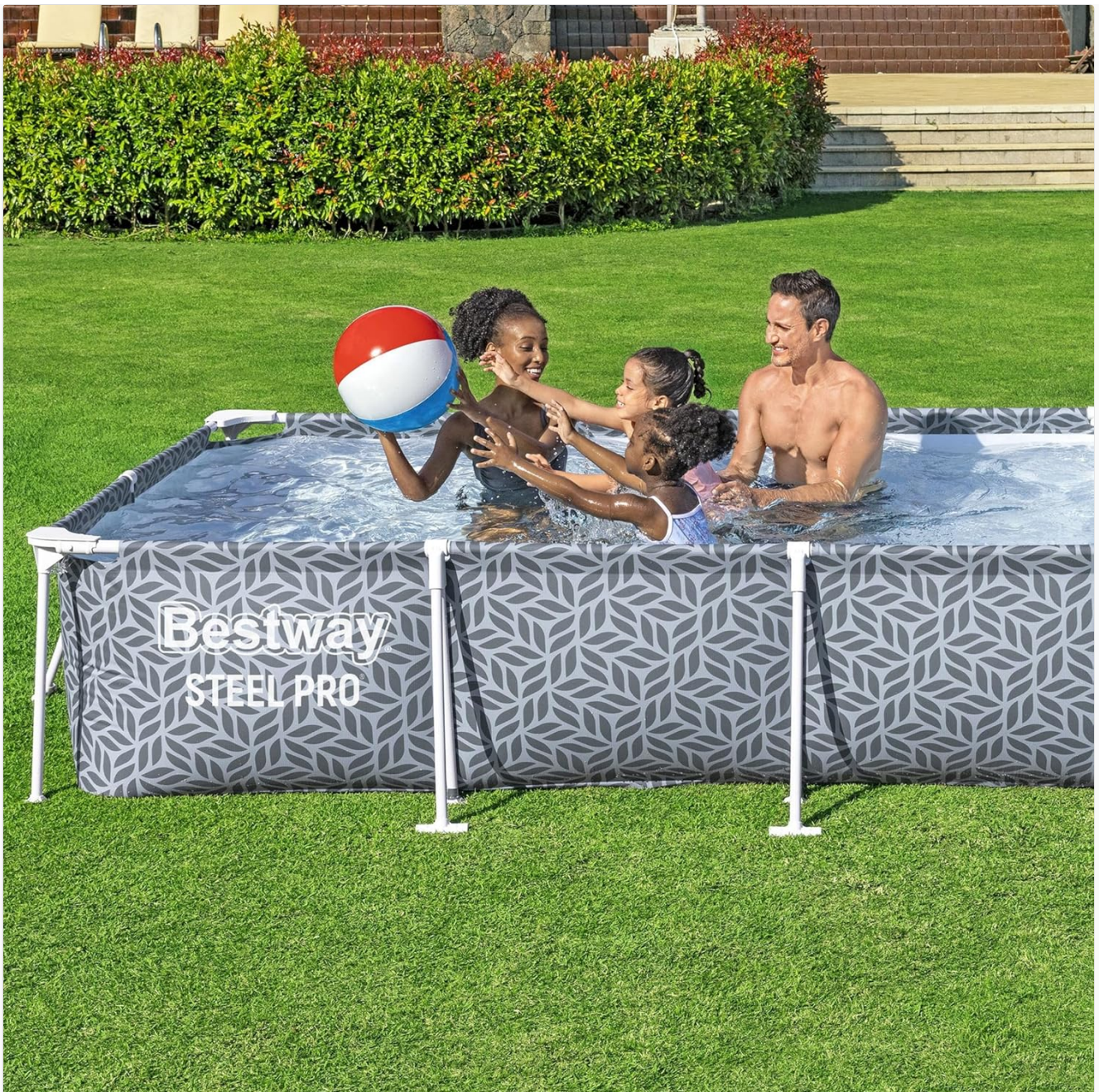
Figure 4.1: Family enjoying the pool.