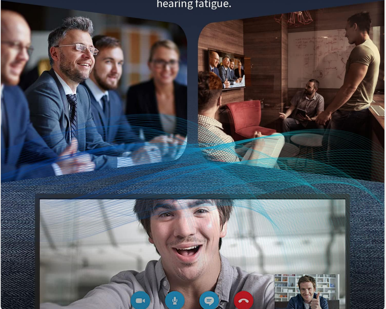
Image: Quad Split Screen

Support remote video conferencing and listen to the entire discussion without delay or hearing fatigue.