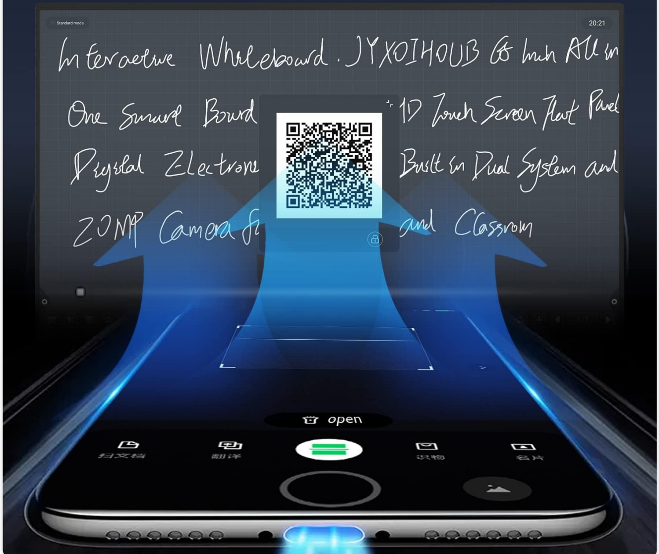
Image: Dual System One-Key Switch

The smartboard supports both Android 11.0 (4GB RAM, 32GB SSD) and Windows 10 (8GB RAM, 128GB SSD), offering versatile functionality.