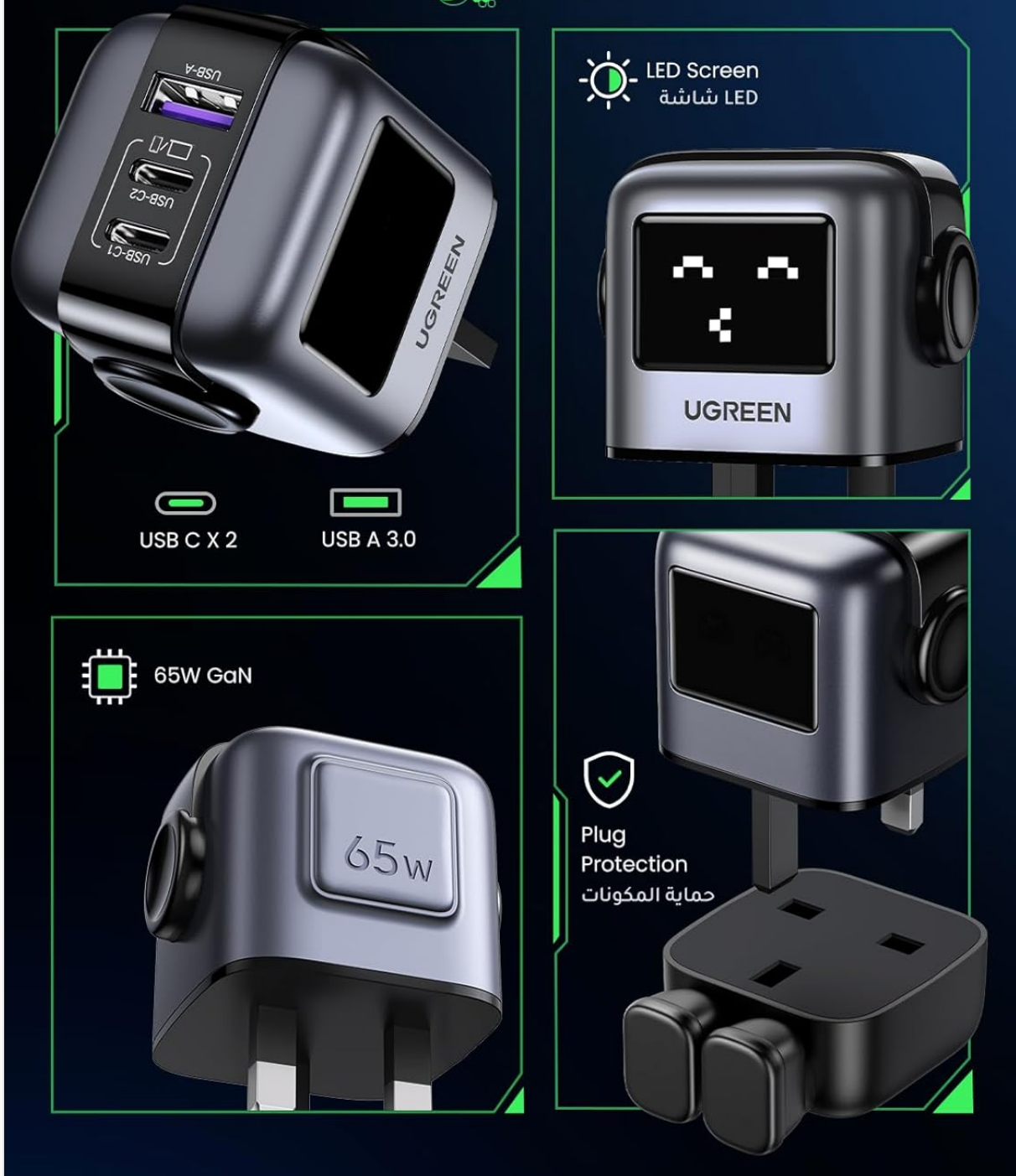
Figure 3.2: Detailed views of the UGREEN CD361 charger's ports (2 USB-C, 1 USB-A), 65W GaN technology, and the protective 'Uno-Shoe' pin covers. This image highlights the input/output interfaces and the safety features.