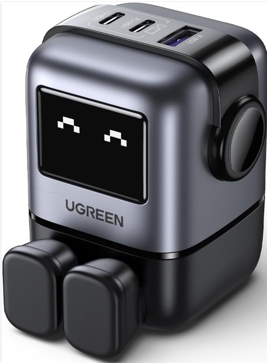
Figure 3.1: UGREEN CD361 UNO 65W 3-Port GaN USB-C Charger. This image shows the compact, robot-like design of the charger with its three charging ports visible at the top and the LED display on the front.