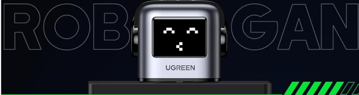
Figure 5.1: UGREEN CD361 charger simultaneously charging three devices, demonstrating its multi-port capability.