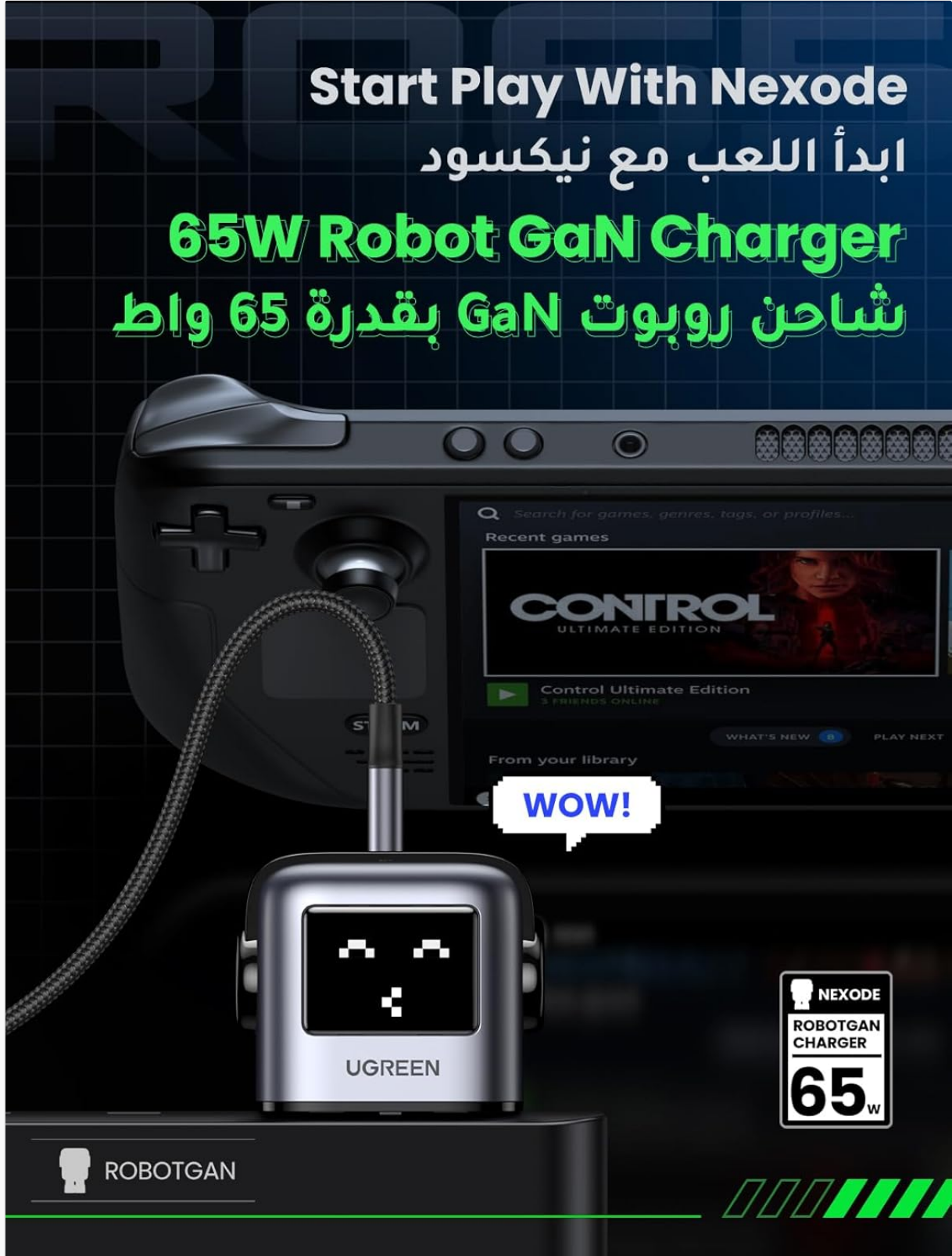
Figure 4.1: UGREEN CD361 charger connected to a gaming console, illustrating how to connect a device for charging.