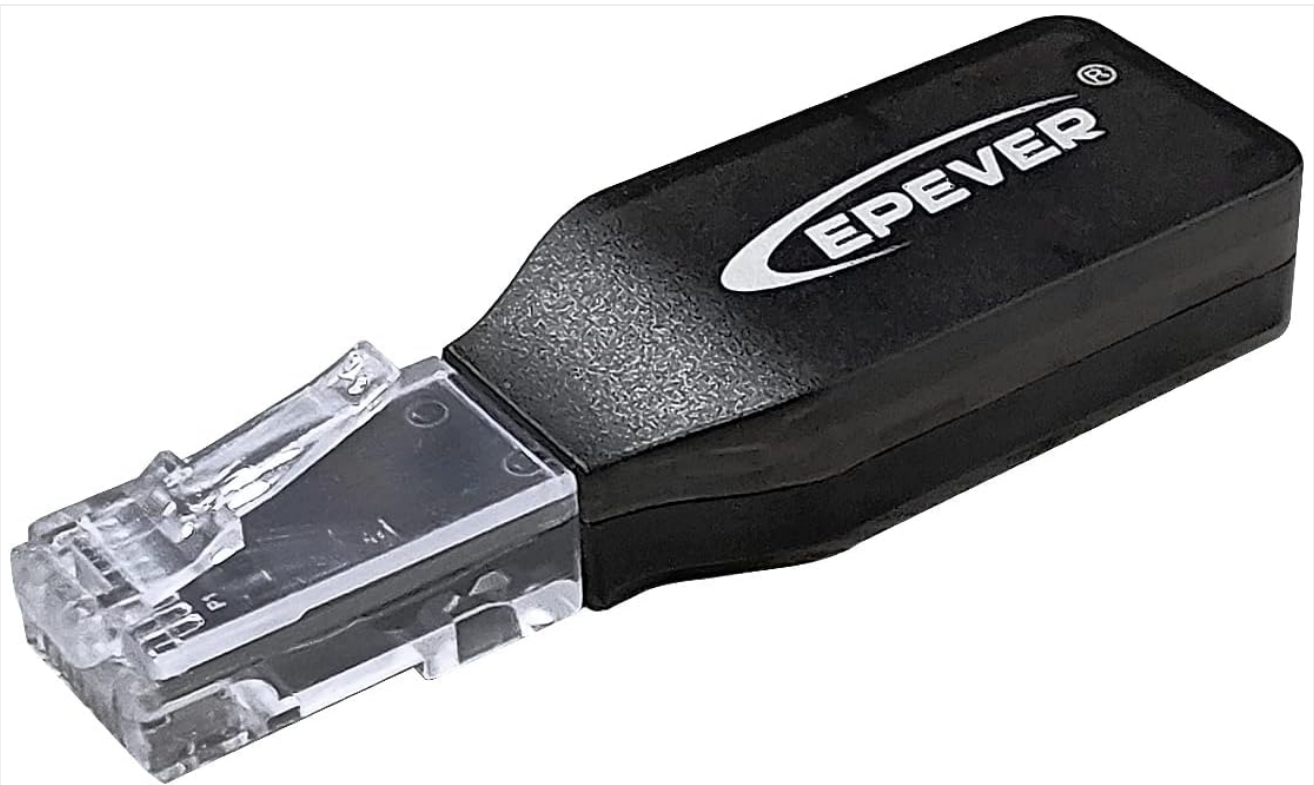
Figure 1: Front view of the EPEVER WiFi Adapter.

The EPEVER WiFi Adapter (Model: WIFI-2.4G-RJ45-D) is designed to enable wireless monitoring and parameter setting for EPEVER solar charge controllers, inverters, and inverter/chargers equipped with an RJ45 communication port. This adapter facilitates real-time data transmission and supports both local monitoring and cloud-based operation.