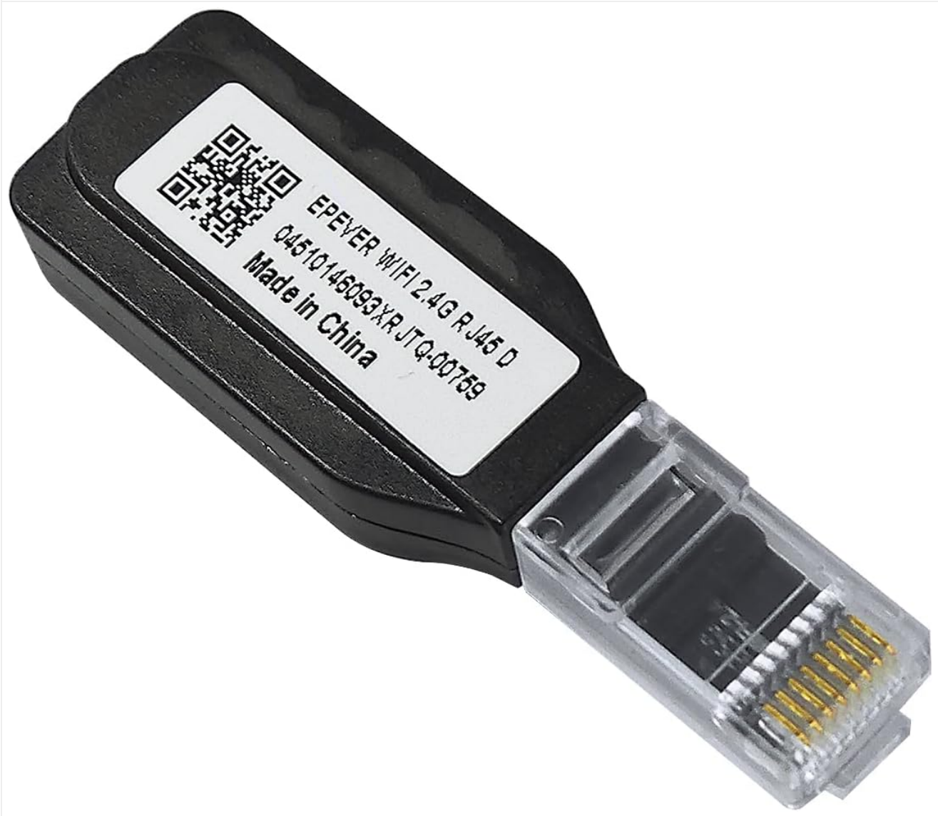
Figure 2: Back view of the EPEVER WiFi Adapter, showing the serial number (SN:04510146093XRJTQ-00759) and QR code for easy setup.