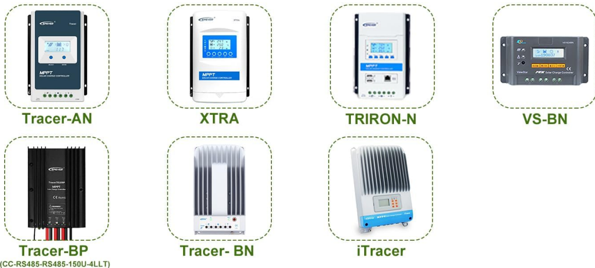
Figure 3: EPEVER WiFi Adapter compatibility with Tracer-AN, XTRA, TRIRON-N, VS-BN, Tracer-BP, Tracer-BN, and iTracer series controllers.

The EPEVER WiFi 2.4G RJ45 D WiFi adapter is mainly used for real-time transmission of various power generation data from EPEVER controllers, inverters, hybrid inverter chargers, etc. to the EPEVER cloud server. It supports wireless monitoring and parameter setting of on-site devices via cloud servers, mobile apps, or large screens.