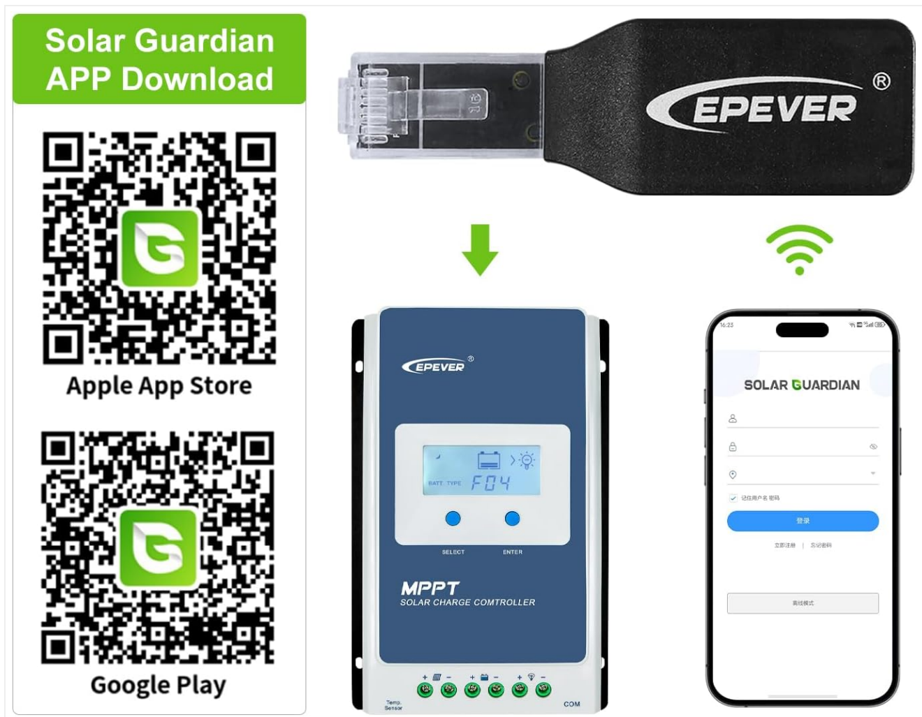
Figure 4: QR codes for downloading the Solar Guardian App from Google Play and Apple App Store .