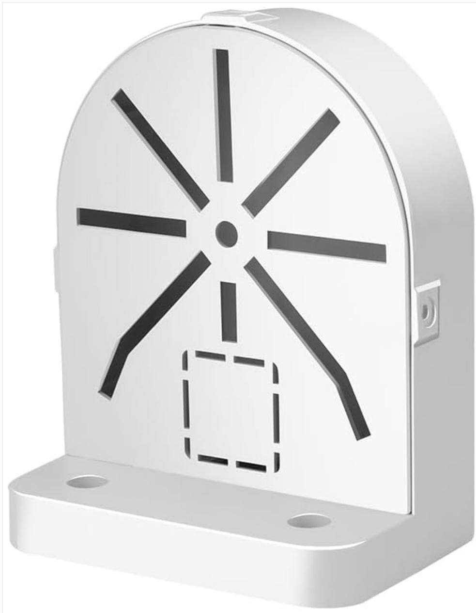
Image: A close-up front view of a single CTXSumTec wall mount bracket, highlighting the screw holes on the base for wall attachment.