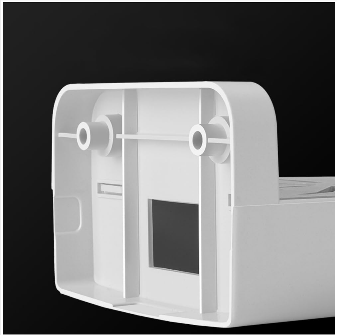
Image: The rear view of the bracket reveals the designated openings for cable routing, ensuring a tidy installation without exposed wires.