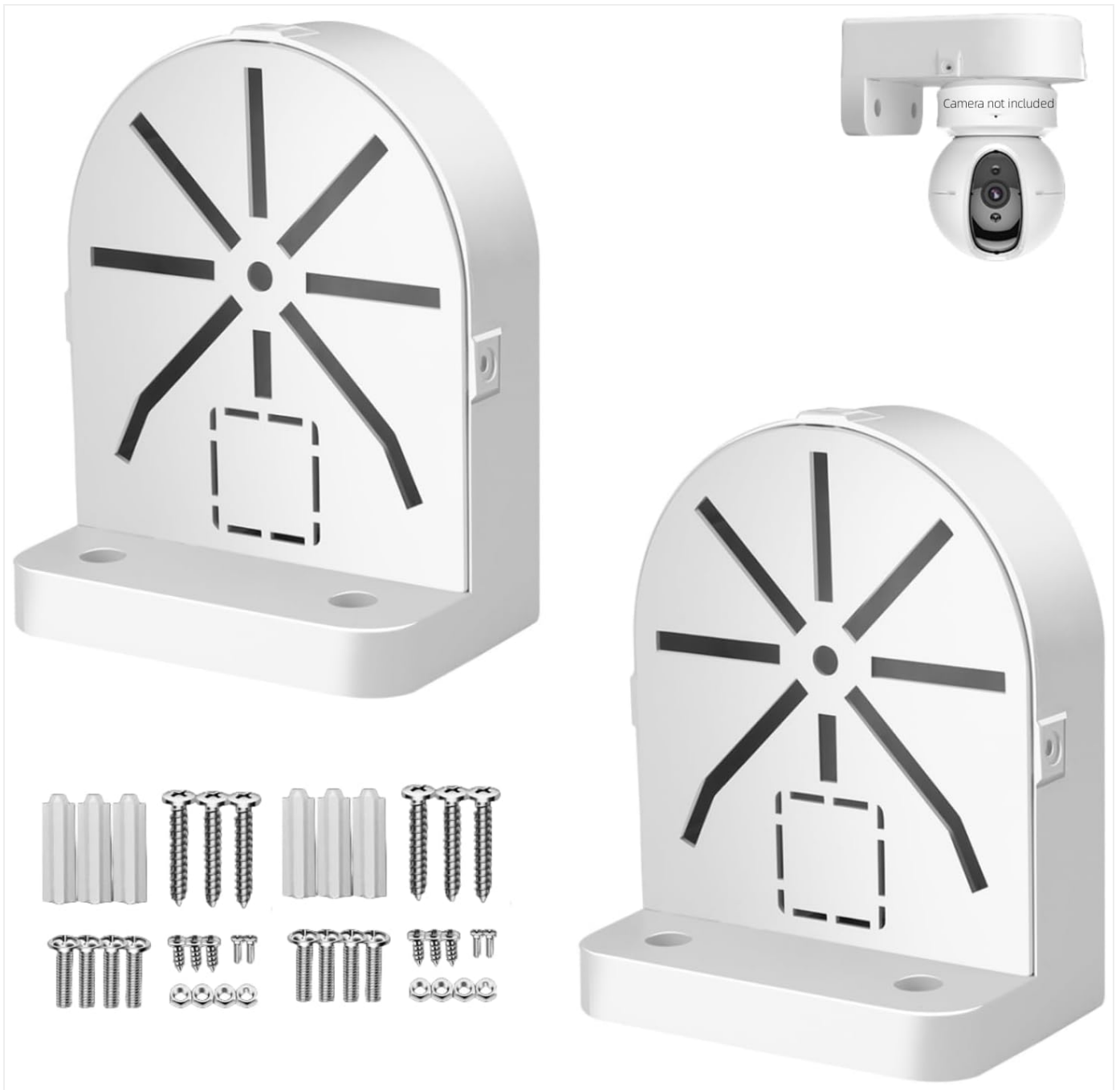
Image: Two CTXSumTec security camera wall mount brackets shown with the included screw kits. These brackets are designed to provide a stable and discreet mounting solution for various security cameras.