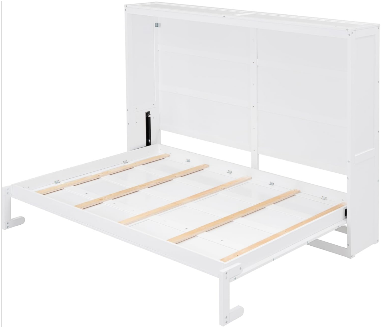
Figure 2: Angled view of the Merax Queen Murphy Bed in the open position, highlighting the wooden slat support system.