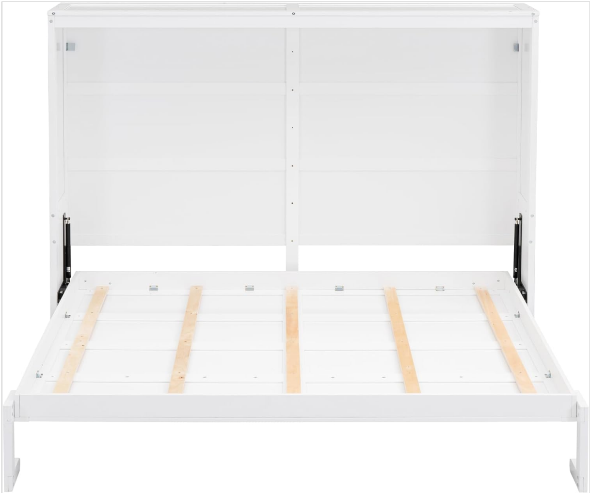
Figure 4: Merax Queen Murphy Bed in the fully open position, ready for a mattress.