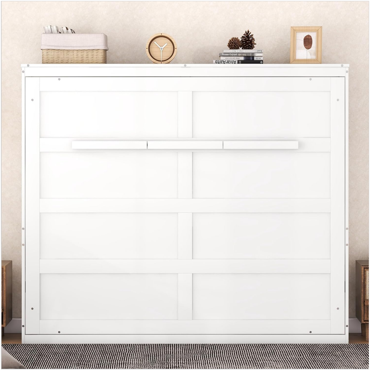
Figure 3: Merax Queen Murphy Bed in the closed cabinet position, appearing as a decorative wall unit.