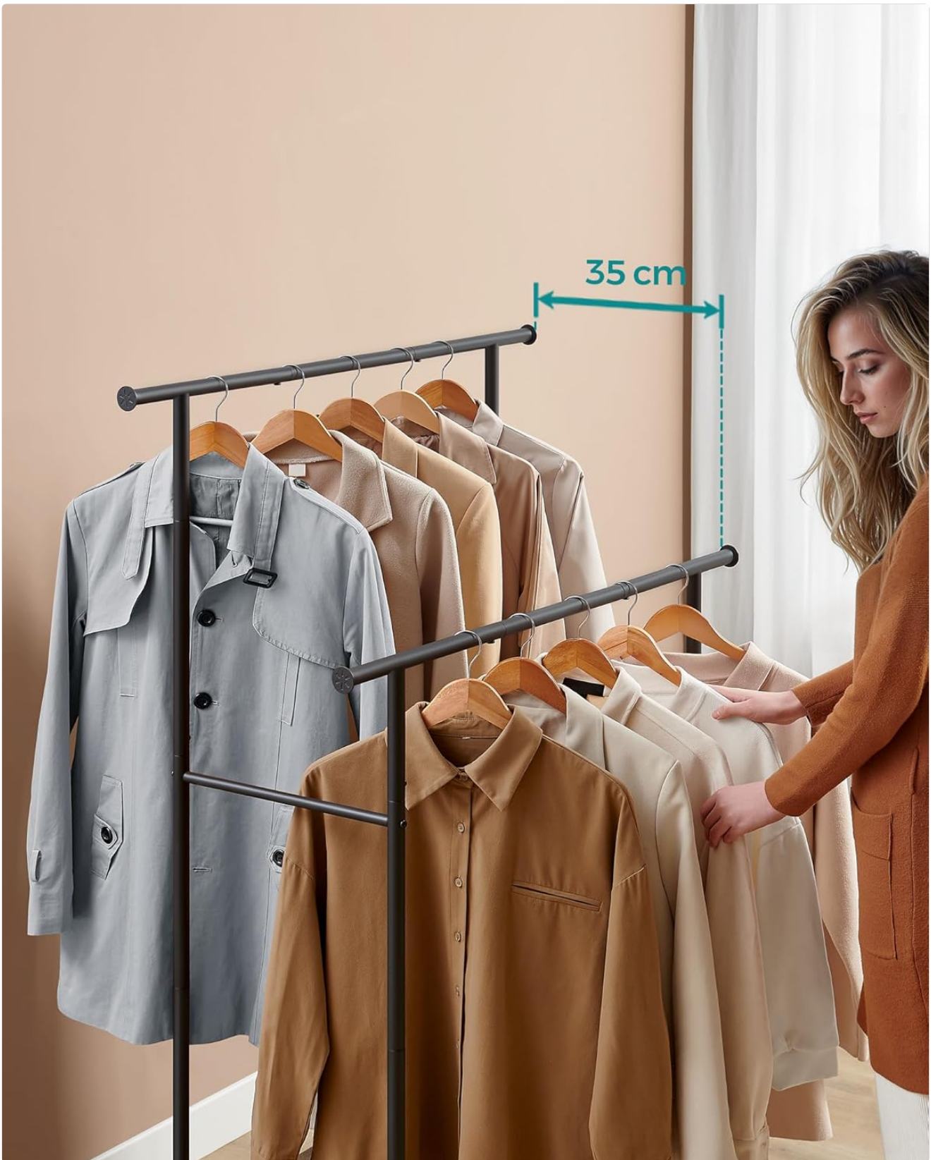
Image: Demonstrating the 35 cm gap between the two hanging bars, allowing for easy access and organization.