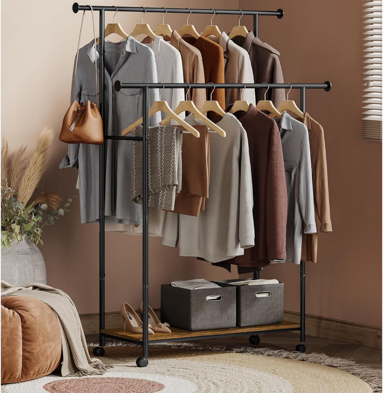
Image: The coat rack in use, showcasing its storage capacity for clothes and accessories.