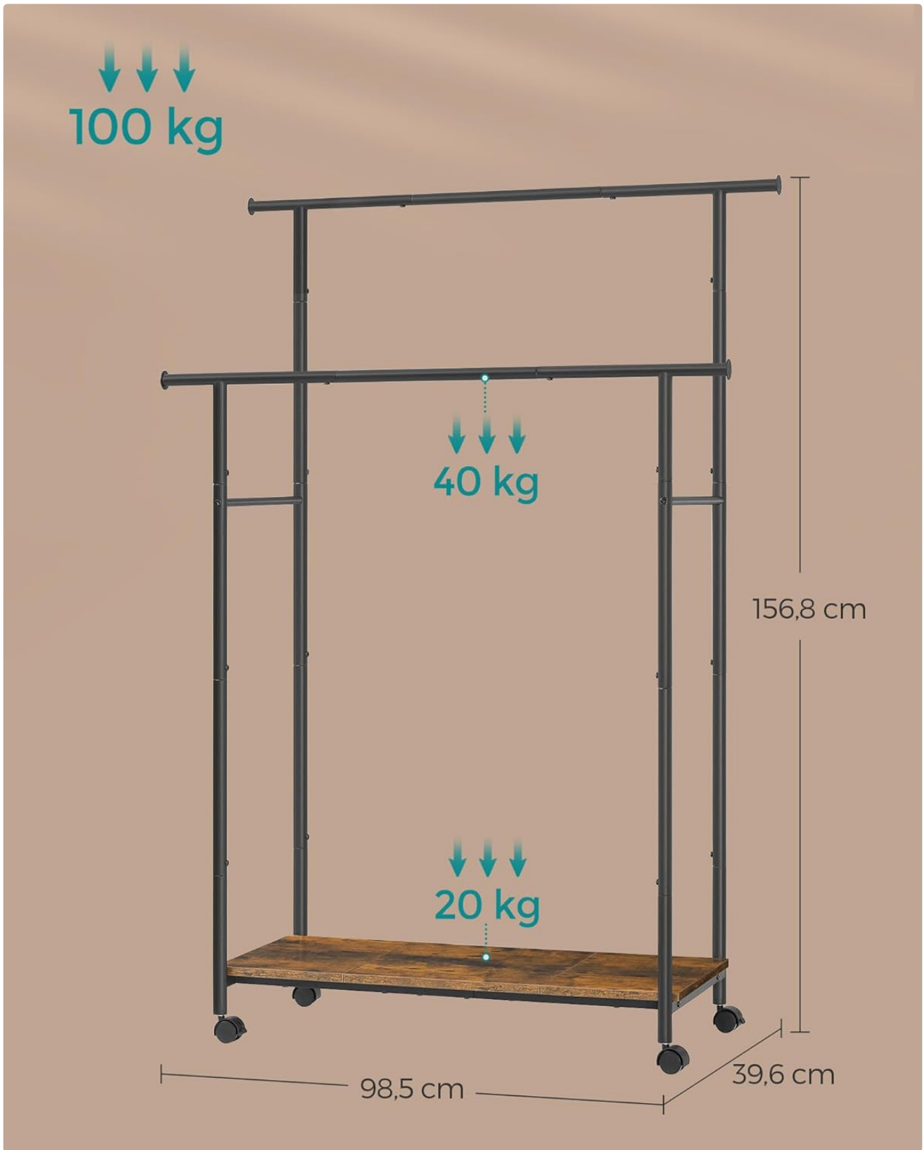
Image: Overall dimensions and total load capacity of the coat rack.