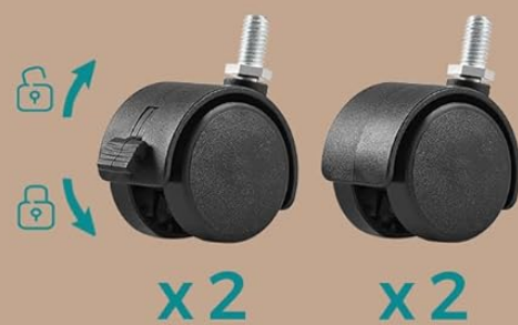
Image: Detail of the bottom shelf and casters, highlighting the 360° swivel and brake function.