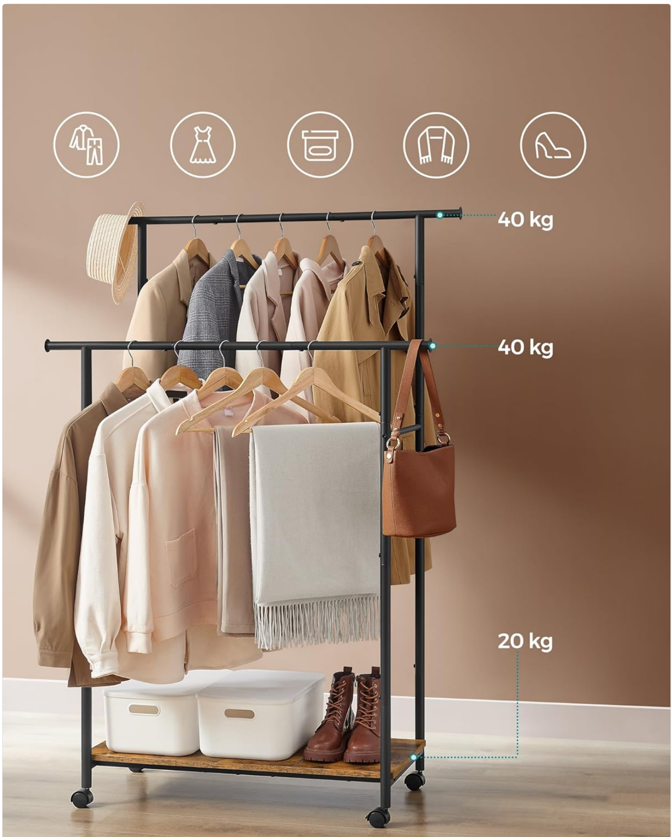
Image: Visual representation of the load capacities for the hanging bars and bottom shelf.