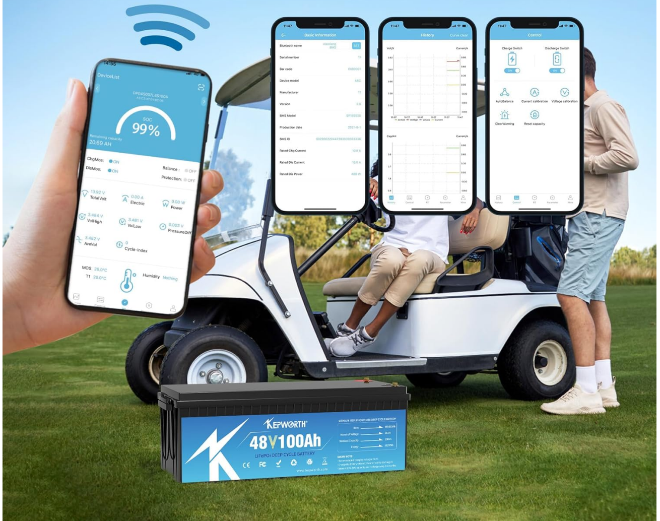
Image 3.2: Real-time battery information viewable via the mobile app with Bluetooth BMS.