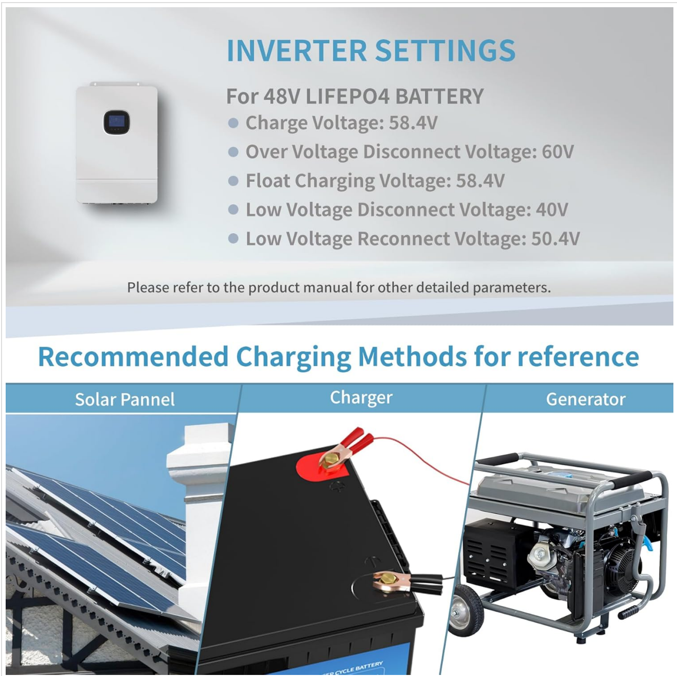
Image 4.1: Recommended charging methods including solar panel, charger, and generator. Inverter settings for 48V LiFePO4 battery are also shown: Charge Voltage: 58.4V, Over Voltage Disconnect Voltage: 60V, Float Charging Voltage: 58.4V, Low Voltage Disconnect Voltage: 40V, Low Voltage Reconnect Voltage: 50.4V.