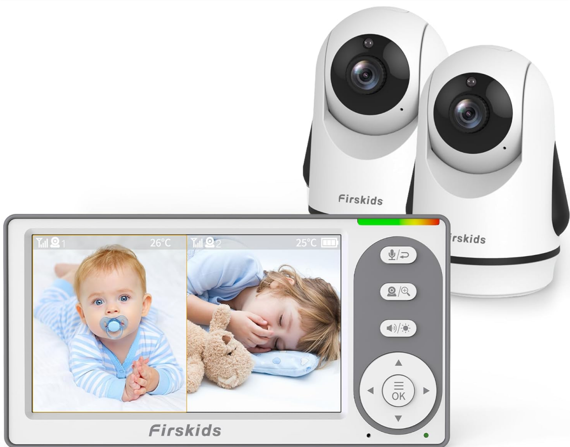
Image 1.1: Firskids Baby Monitor System (Parent Unit and Two Cameras)

This manual provides detailed instructions for the safe and effective use of your Firskids Baby Monitor Model 4863-2. This system includes a parent unit with a 4.3-inch IPS display and two camera units, designed to provide secure and reliable monitoring of your child without requiring a Wi-Fi connection. Please read this manual thoroughly before use and retain it for future reference.