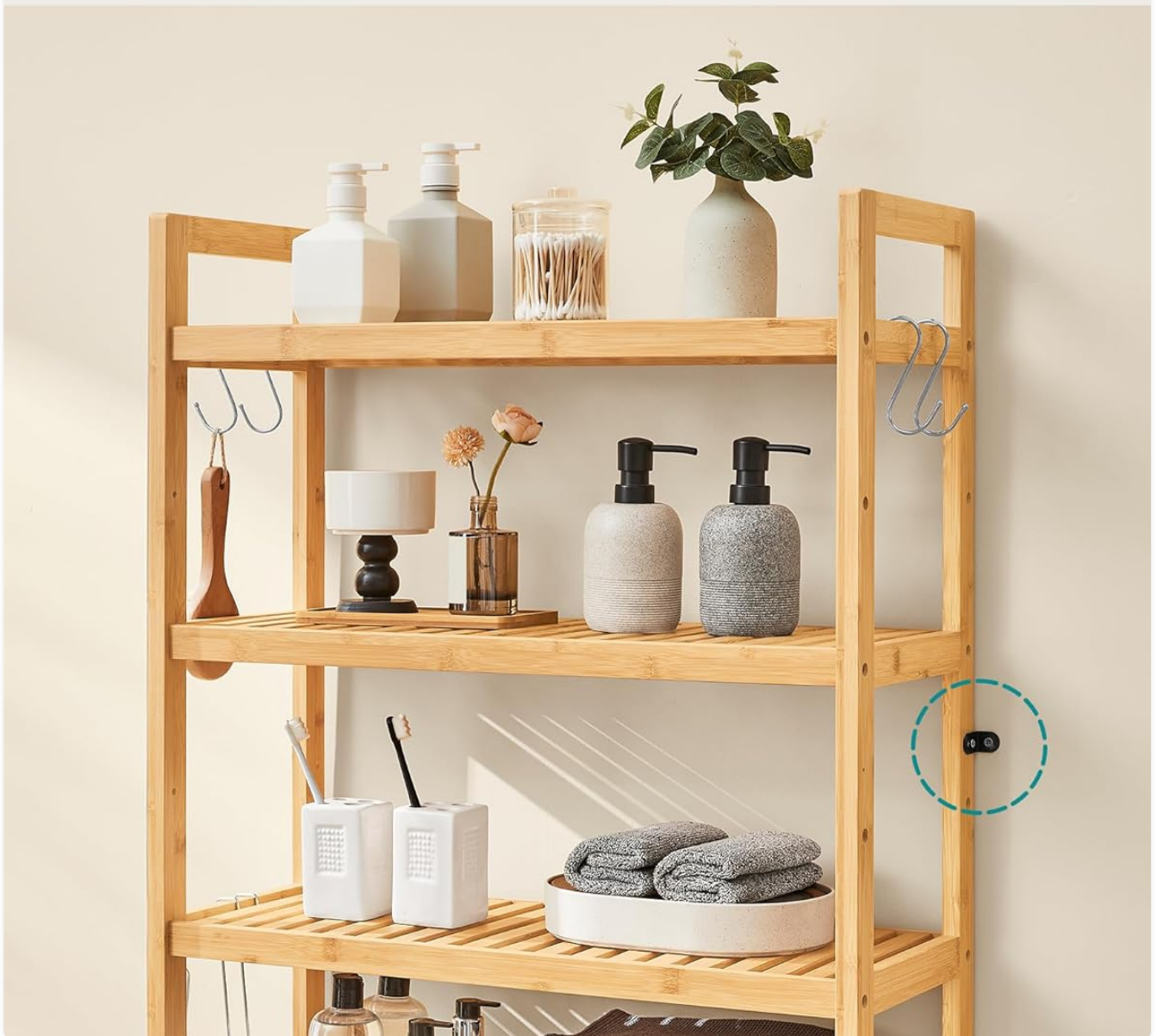
Image 5.1: The anti-tip kit, essential for securing the unit to the wall and ensuring stability.