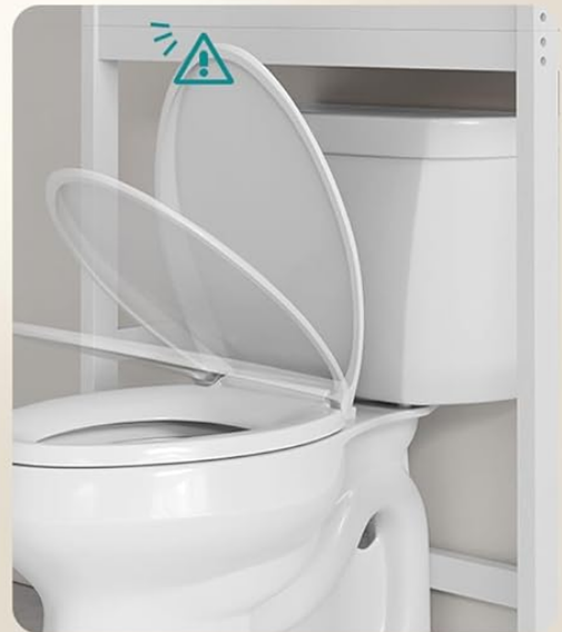
Image 3.3: The spacious bottom area designed to fit over various bathroom fixtures without obstruction.

Toilet lid won't fully open due to obstruction