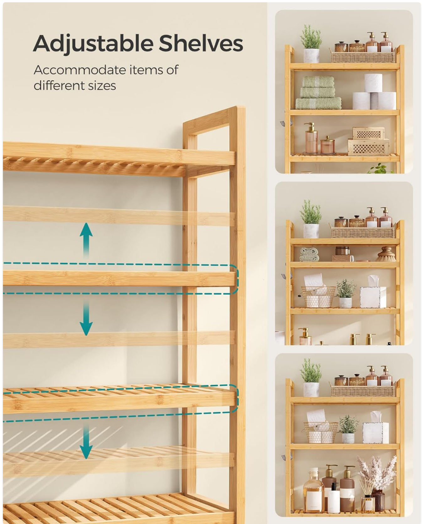
Image 3.1: Illustration of the adjustable shelf mechanism, allowing for customized storage heights.

The three upper shelves of the organizer are adjustable to three different heights. This allows you to customize the storage space to fit items of varying sizes, such as tall shampoo bottles or decorative plants.