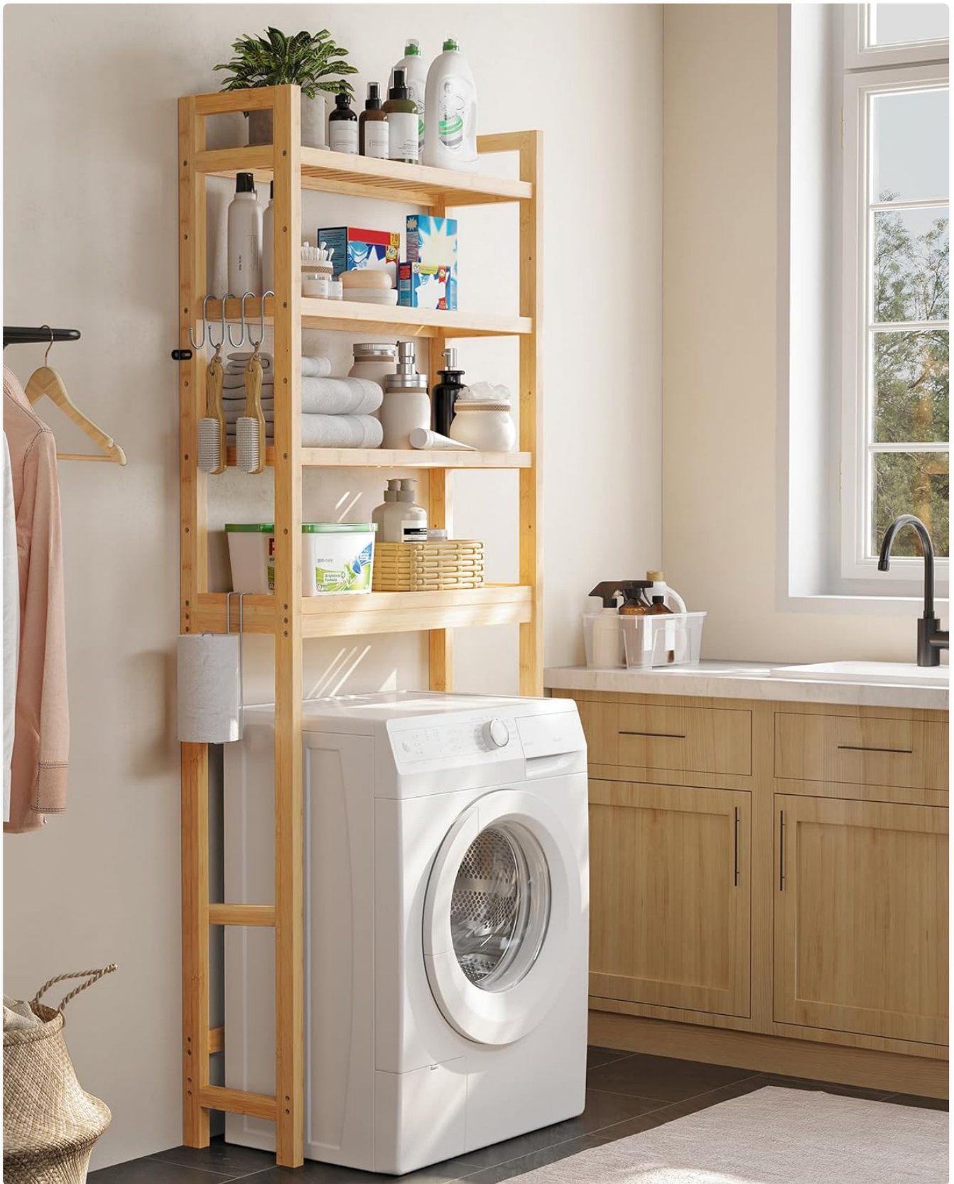
Image 3.4: The storage unit demonstrating its versatility by being placed over a washing machine.