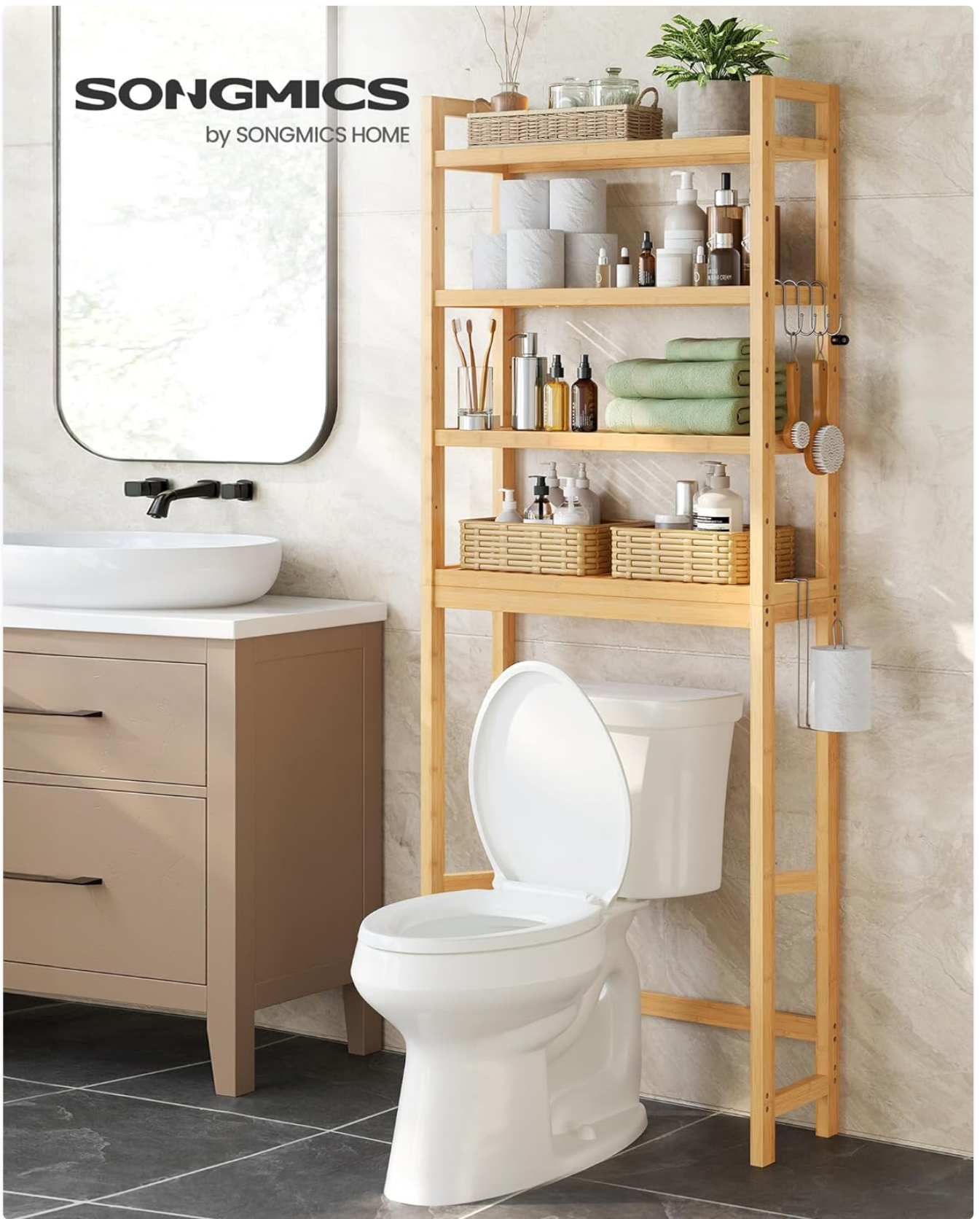
Image 2.1: The assembled storage unit in a bathroom, ready for use.