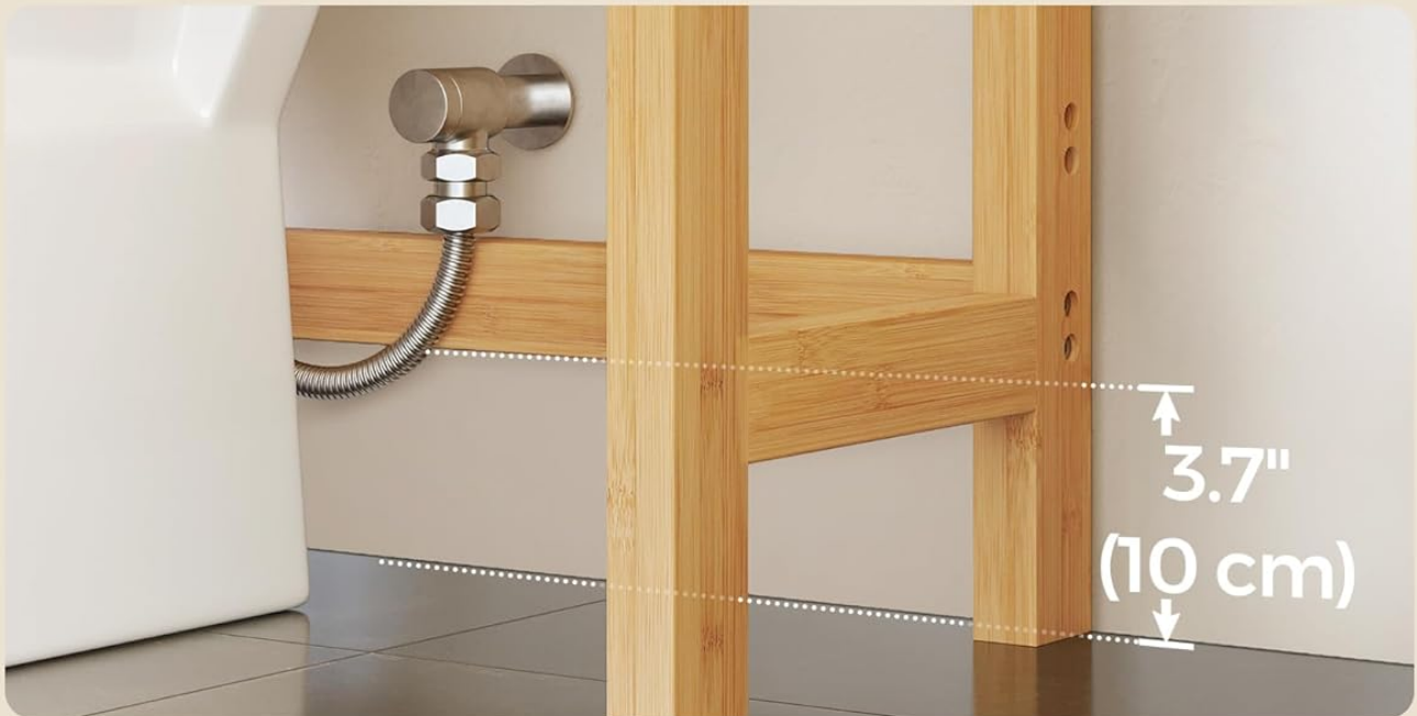
Image 3.2: Visual guide for adjusting the bottom bar to accommodate different toilet pipe heights.