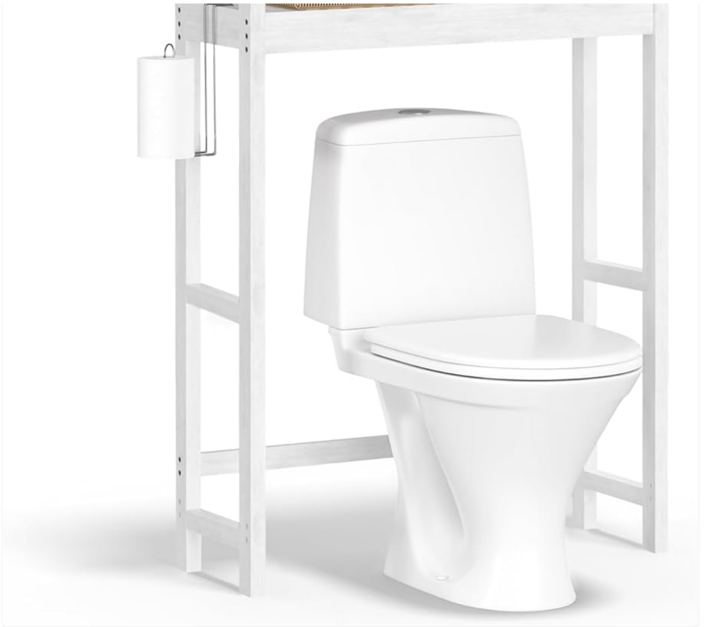
Image: The SONGMICS 4-Tier Over The Toilet Storage unit, fully assembled and styled with various bathroom essentials.