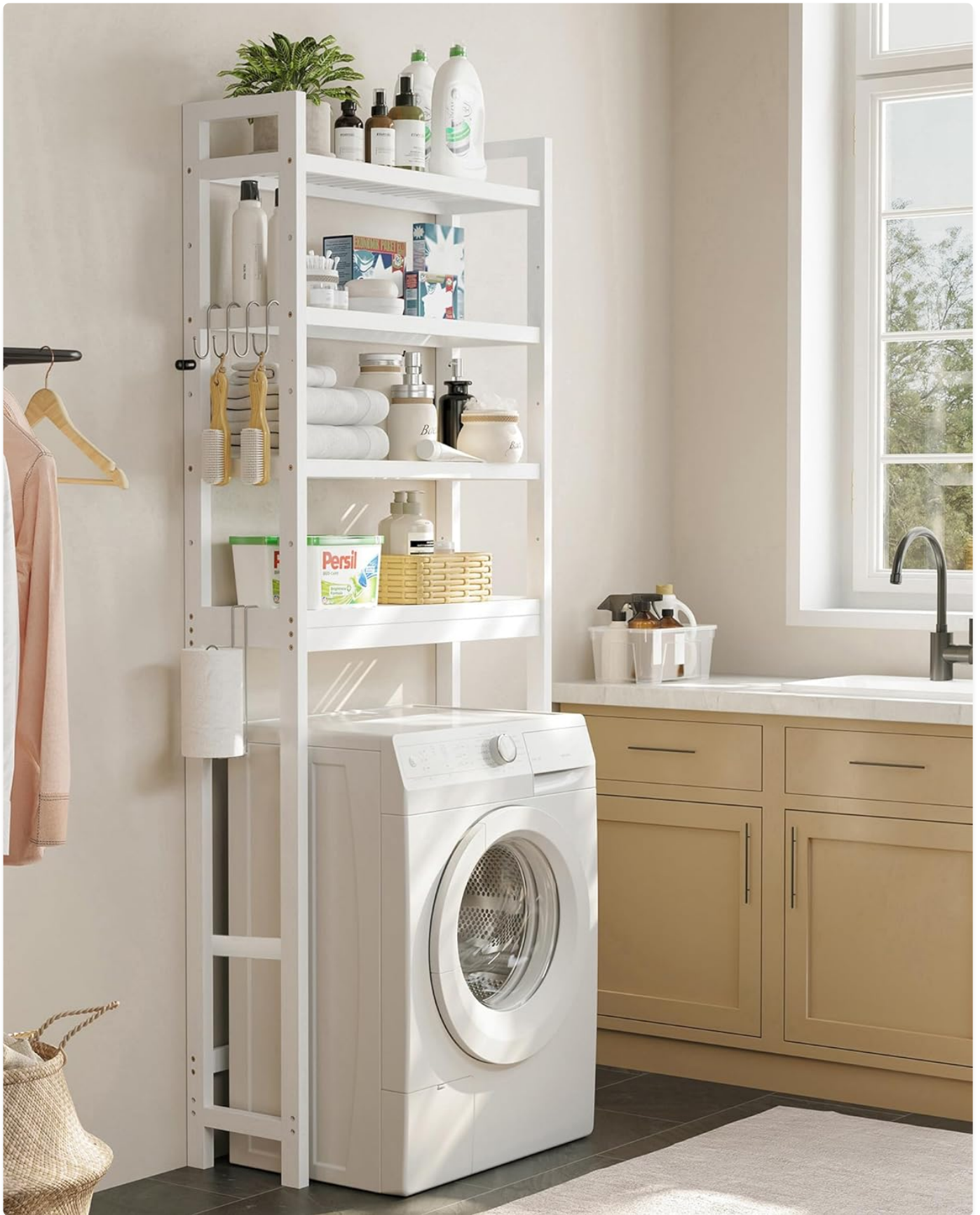
Image: The versatile storage unit positioned over a washing machine in a laundry room, demonstrating alternative usage.