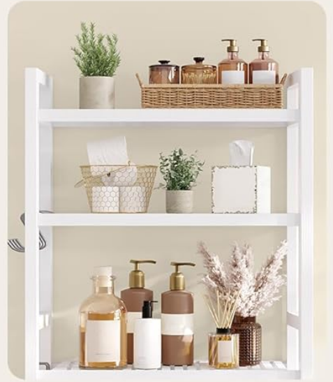
Image: Illustration demonstrating the adjustable shelf feature, allowing customization of storage space.