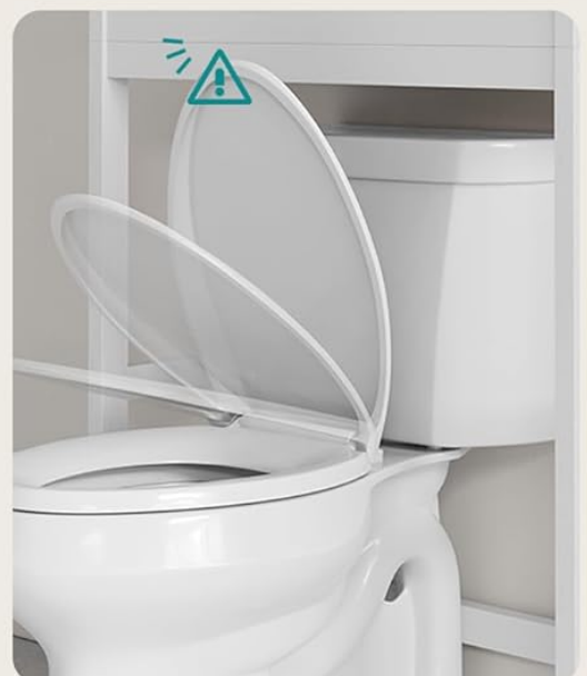
Image: The spacious bottom area of the organizer, designed to fit over standard toilets without obstruction.

Toilet lid won't fully open due to obstruction