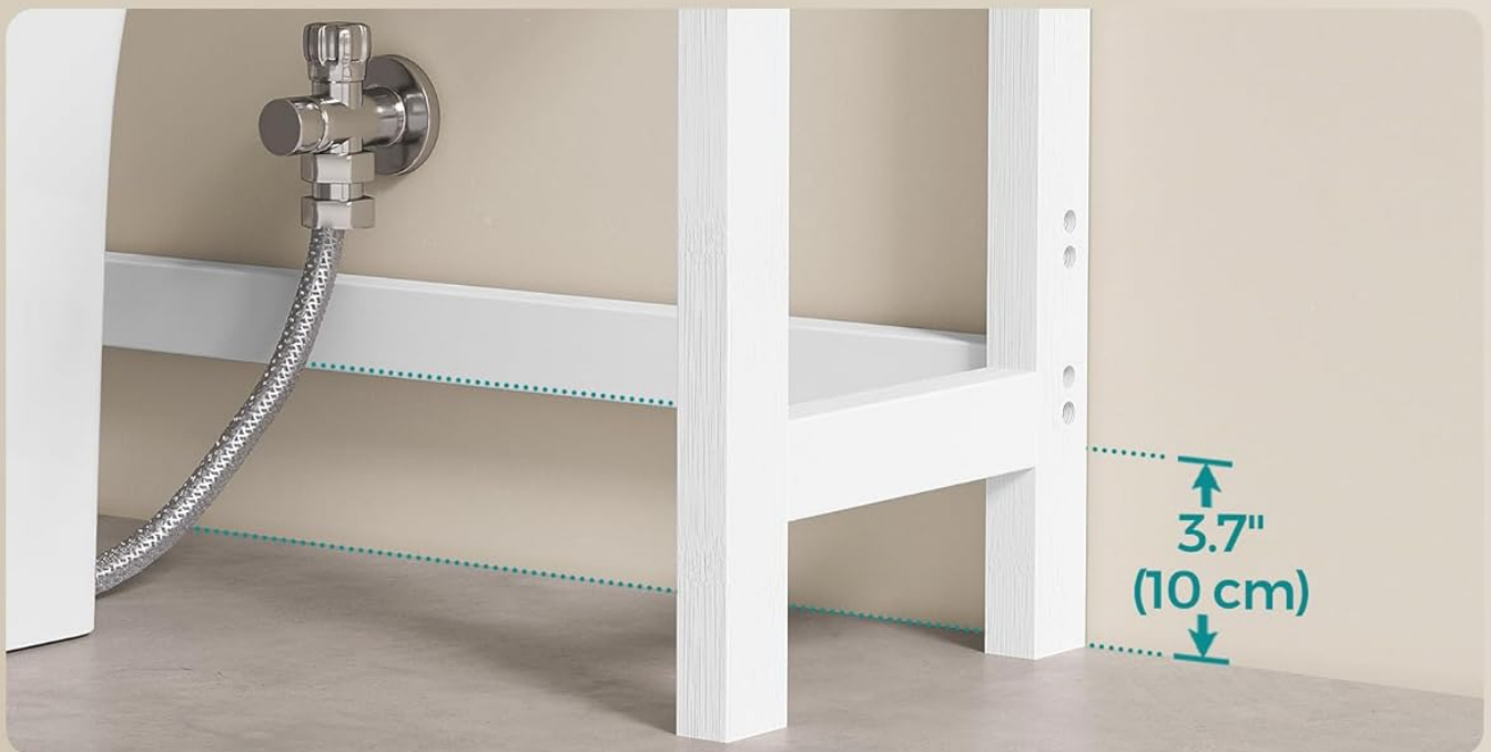
Image: Illustration detailing the adjustable bottom bar, designed to fit various toilet heights and plumbing.