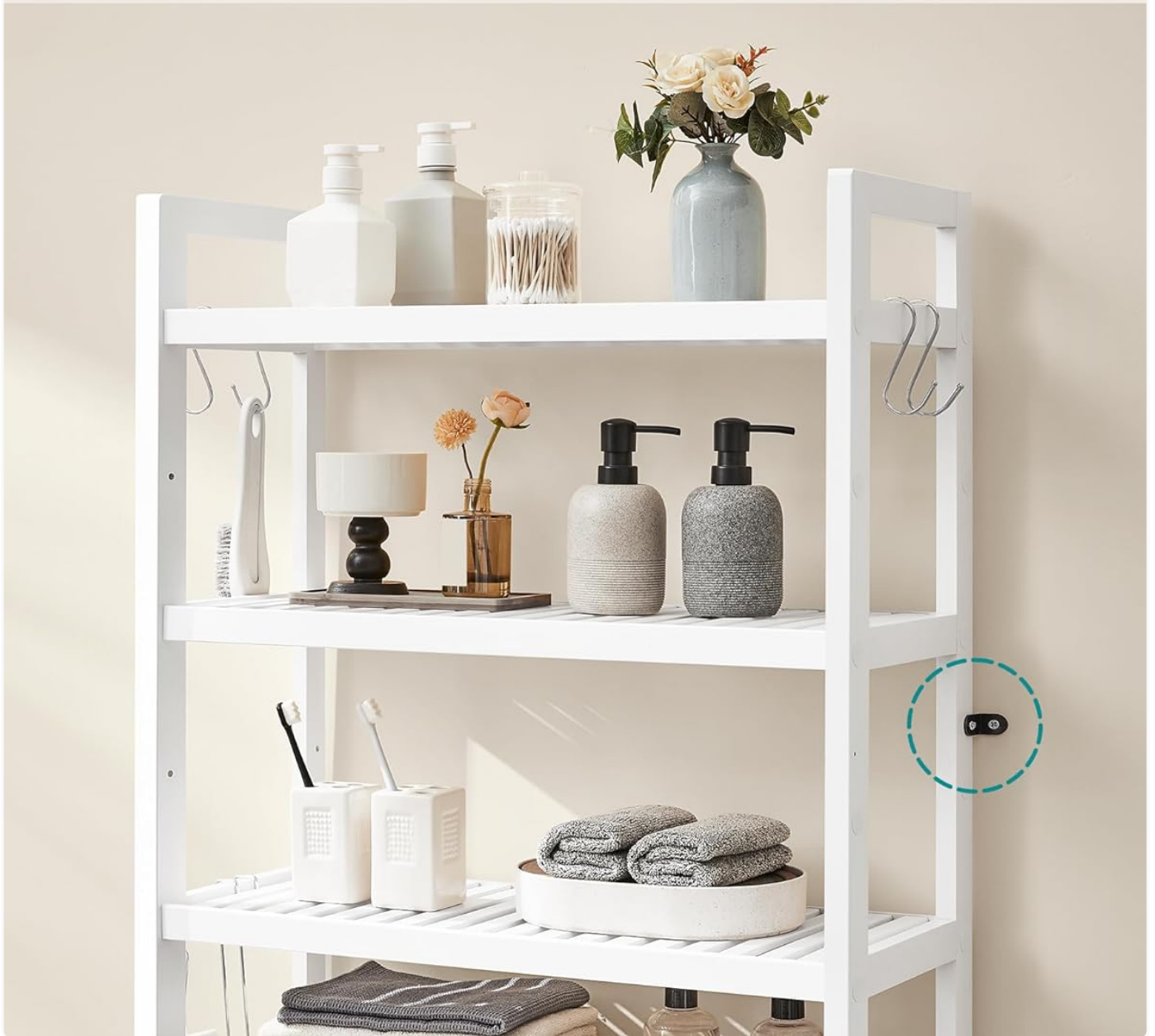
Image: Detail of the anti-tip kit installation, showing how the shelf is secured to the wall for stability.