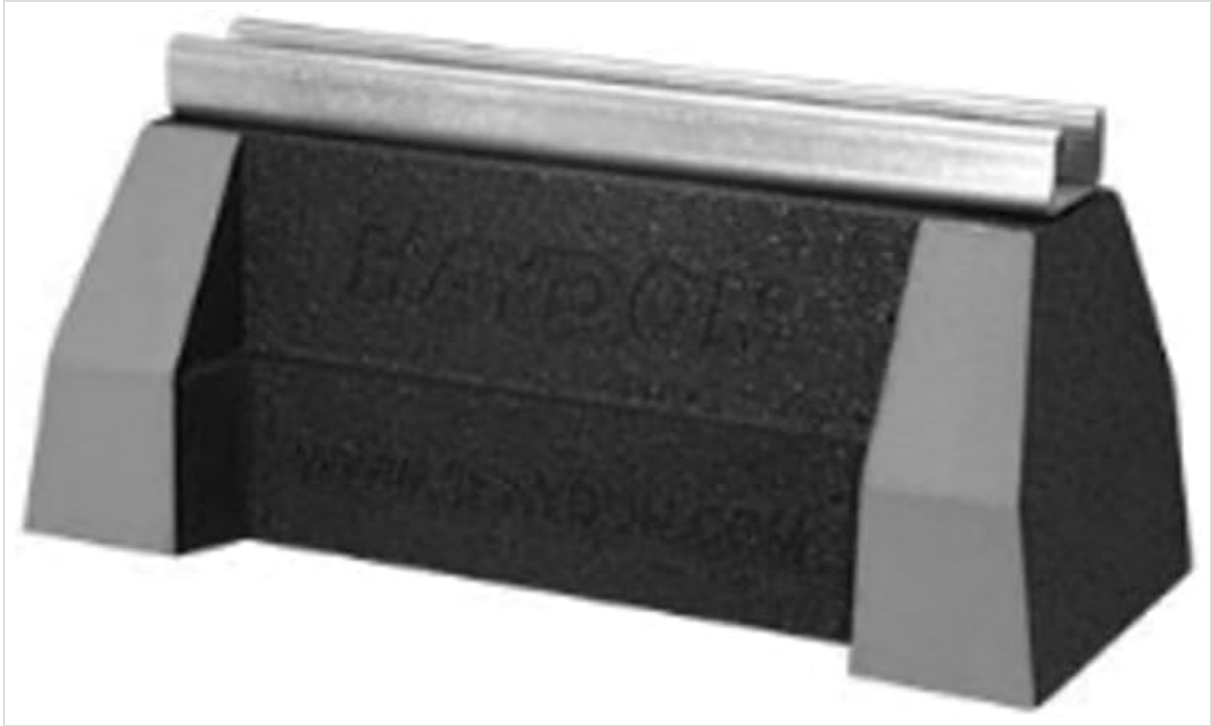
Figure 1: The Generic BE-STRUTRSB Strut Support Base, featuring the integrated 13/16" pre-galvanized strut channel.