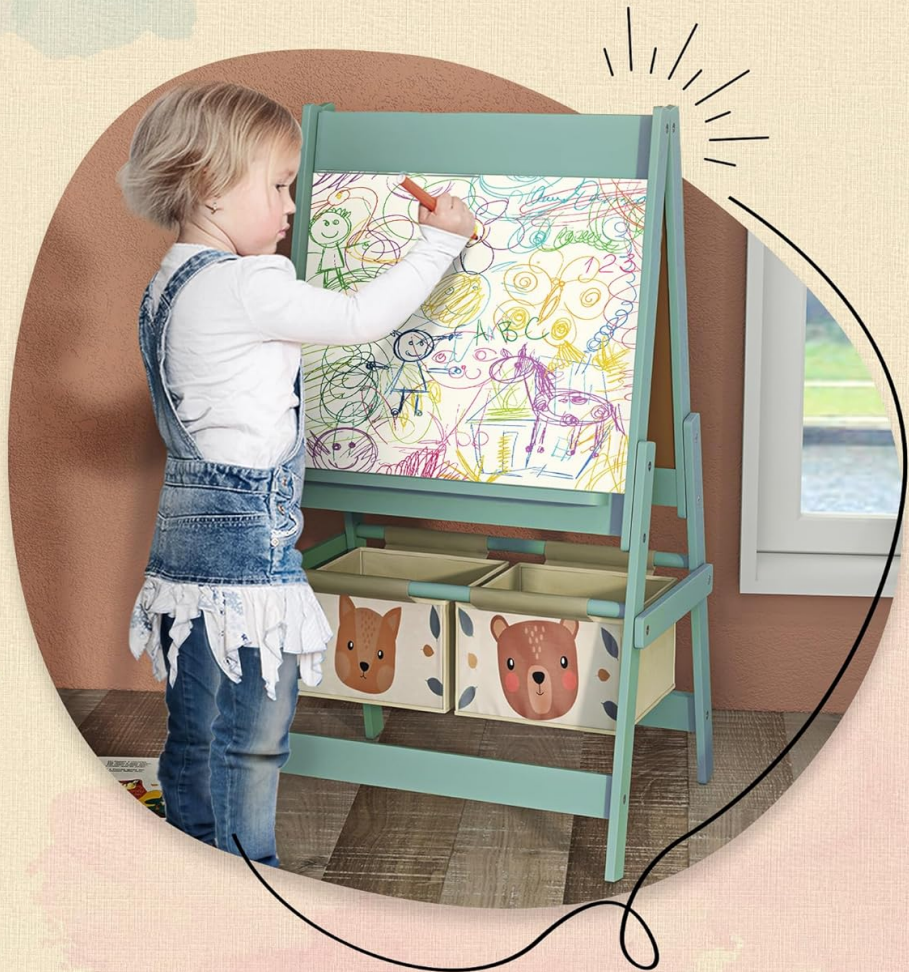
Image 3: This image focuses on the practical storage baskets and the smooth, child-safe edges of the easel, emphasizing its thoughtful design.