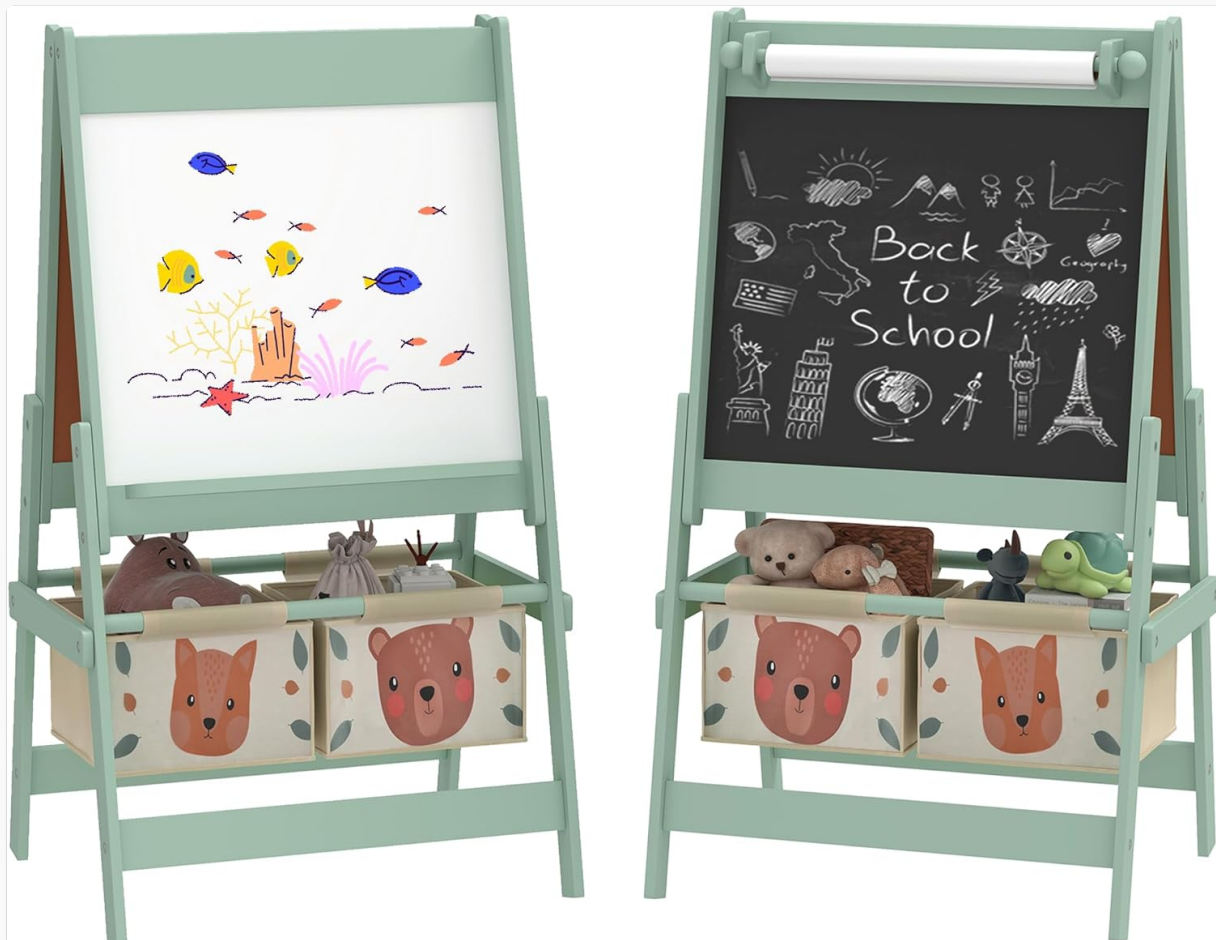
Image 1: The Qaba 3-in-1 Kids Art Easel, showcasing its double-sided design with a whiteboard on one side and a blackboard on the other, along with two fabric storage baskets below.

Thank you for choosing the Qaba 3-in-1 Kids Art Easel. This versatile easel is designed to inspire creativity in children aged 3-8, offering multiple ways to engage in artistic expression. It features a double-sided board with a blackboard and a whiteboard, a convenient paper roll, and integrated storage solutions.