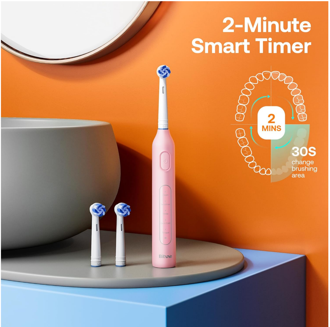
Image: A visual representation of a mouth divided into four quadrants, with a timer indicating '2 MINS' total brushing time and '30S change brushing area', guiding users on proper brushing duration per section.