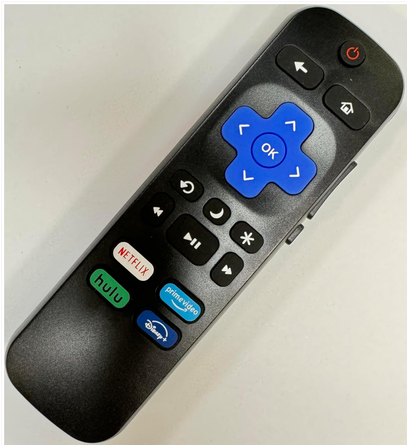
Image: Side view of the USARMT Universal Remote Control, illustrating its ergonomic design and the location of the battery compartment on the rear.